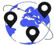
Figure 8: Multi-Device Support

DPN technology overcomes geo-restrictions for unrestricted global access.