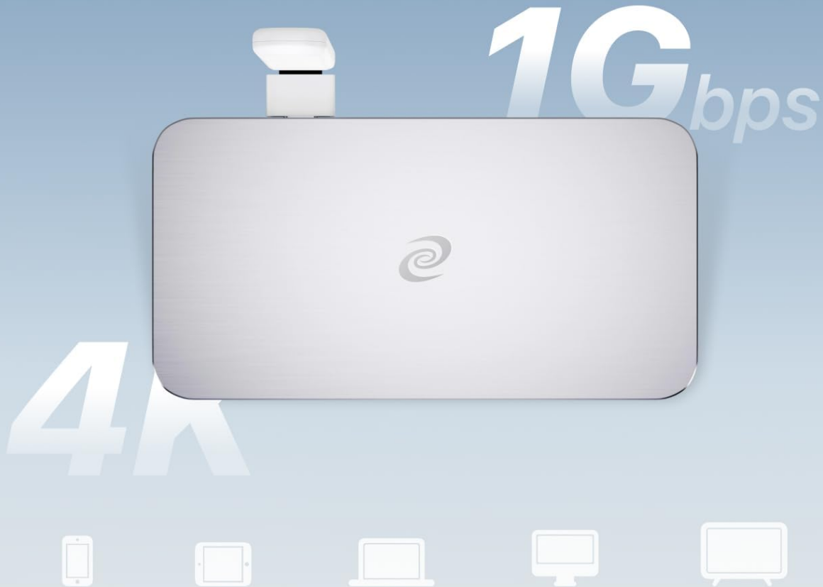
Figure 2: Deeper Connect Mini Port Layout