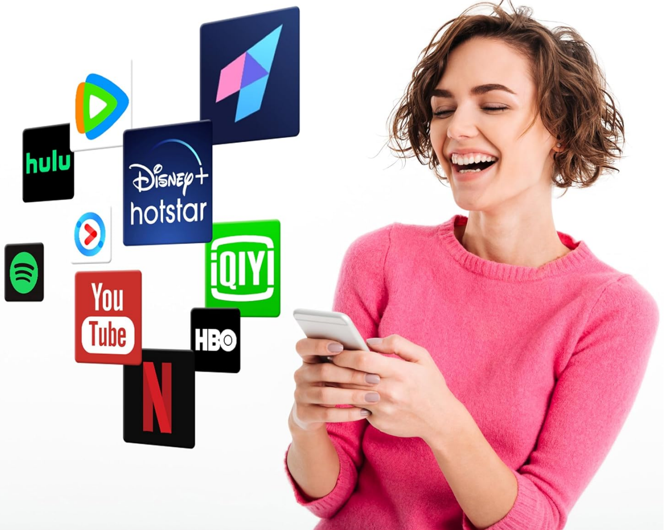
Figure 4: Ad Blocking Feature

Enjoy video streams without ad interruptions.