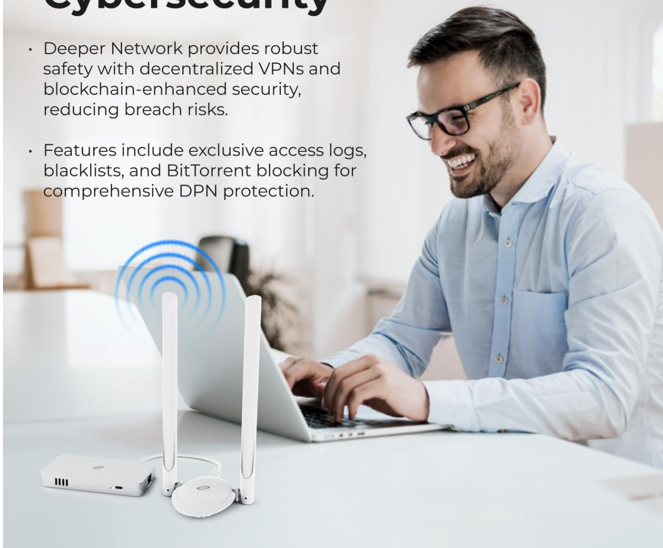
Figure 5: Enhanced Cybersecurity