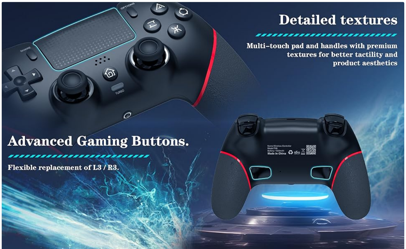
Illustration of the advanced buttons and their programming capabilities.