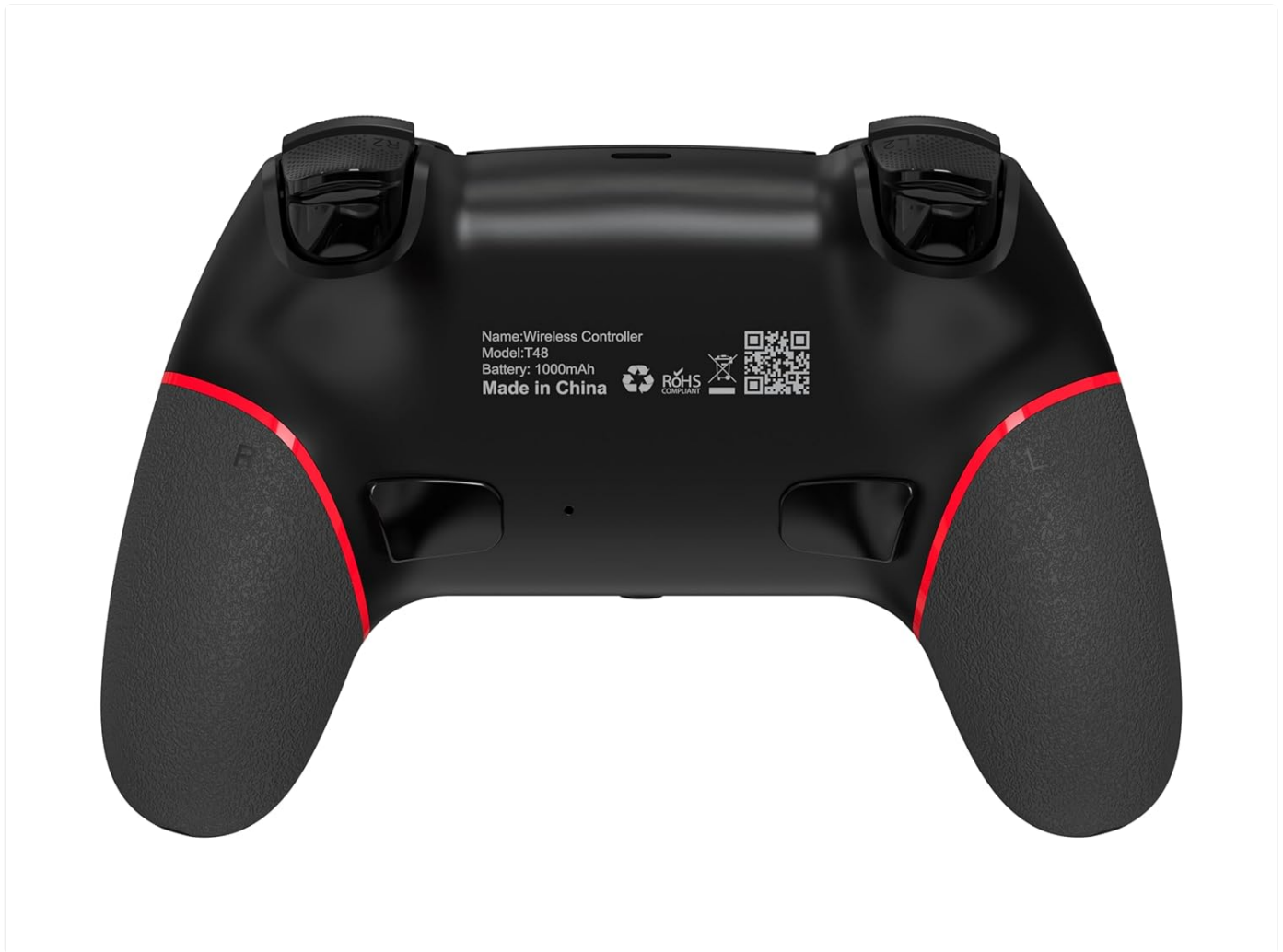
Back view of the controller, highlighting the M1 and M2 programmable buttons and product information.