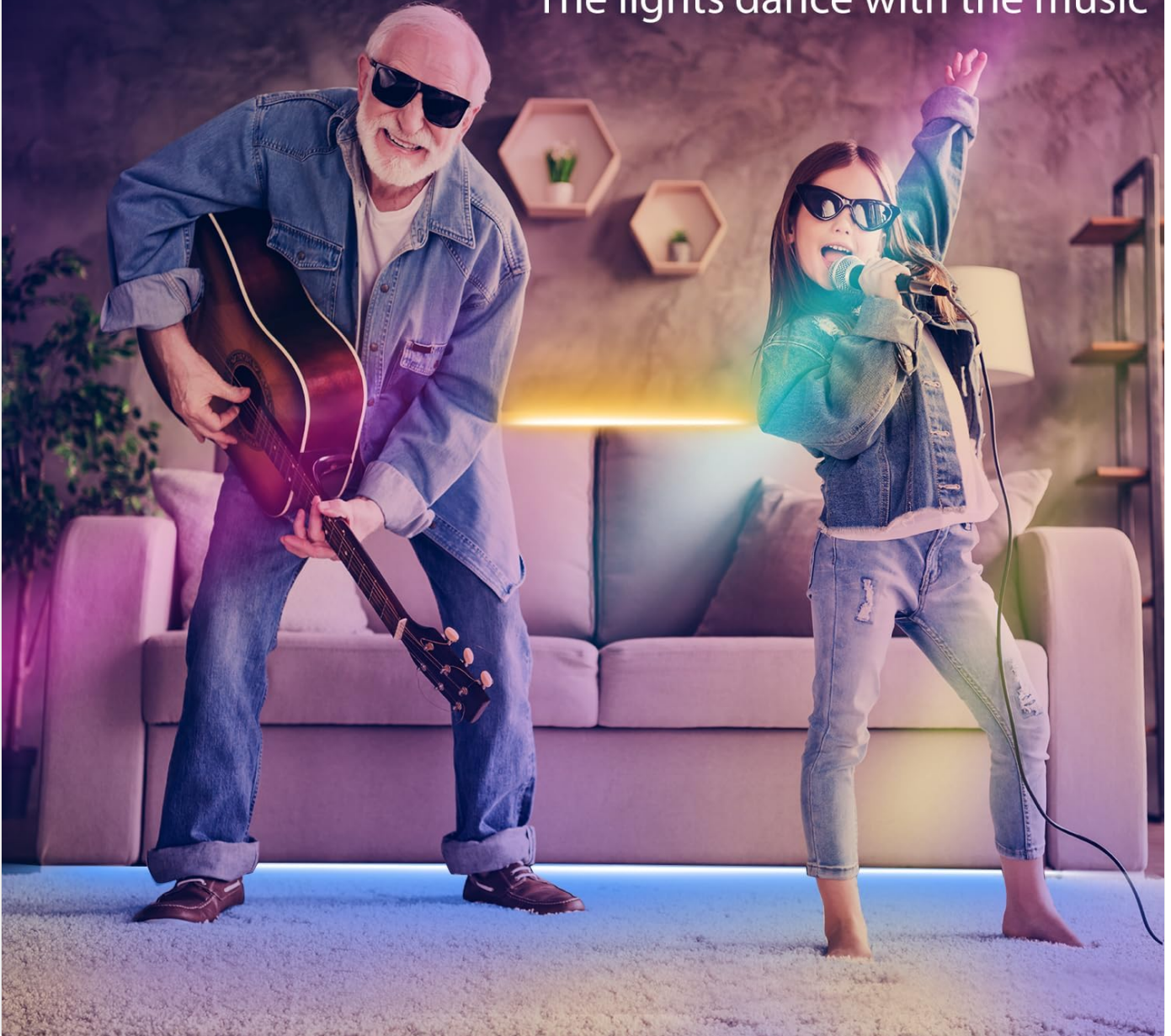
Image: Example of the music mode in action, where the LED lights synchronize with music, creating a dynamic atmosphere.