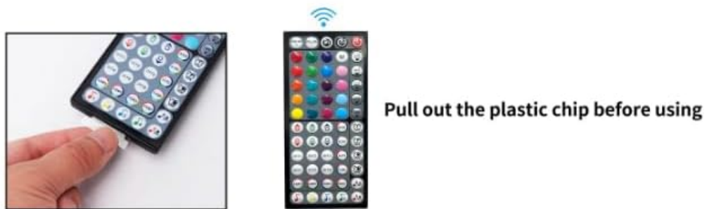
Image: Visual guide for connecting the LED strip to its controller and power adapter. Also shows the remote control, highlighting the protective plastic chip that needs removal before first use.