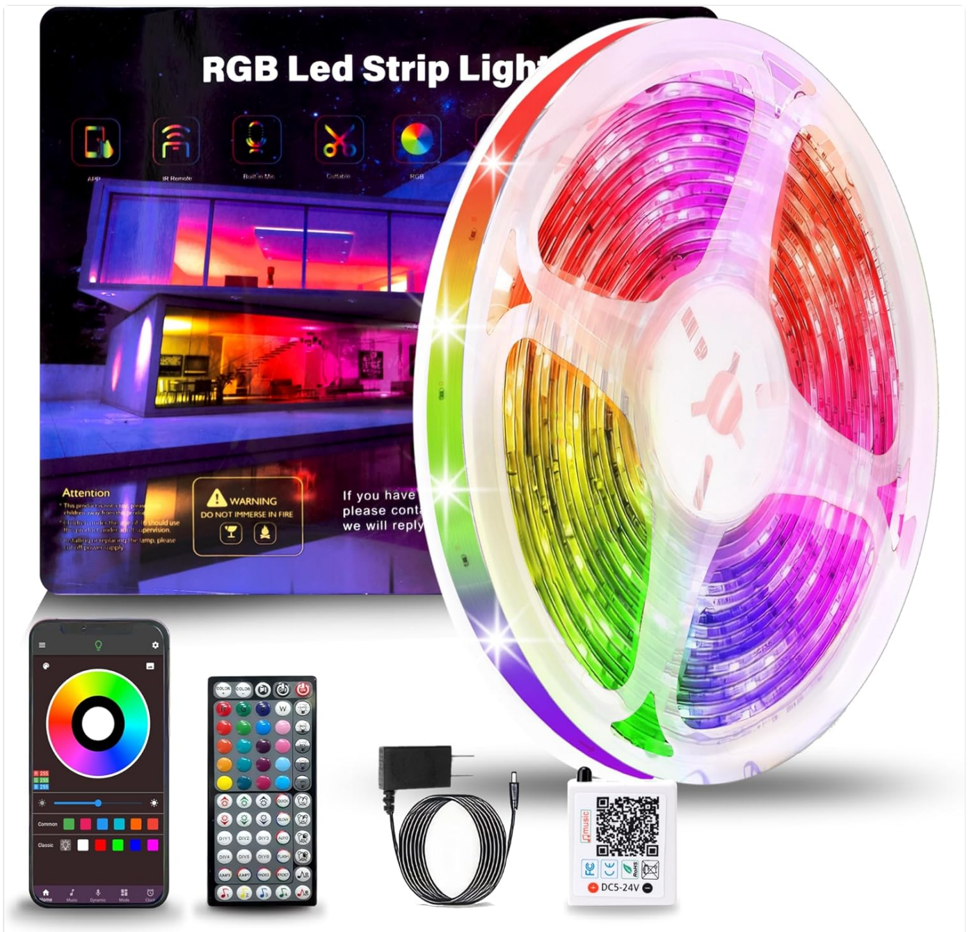
Image: Overview of the NBBUFF 50ft RGB LED Strip Lights, showing the LED strip, remote control, power adapter, and controller, alongside a smartphone illustrating app control.