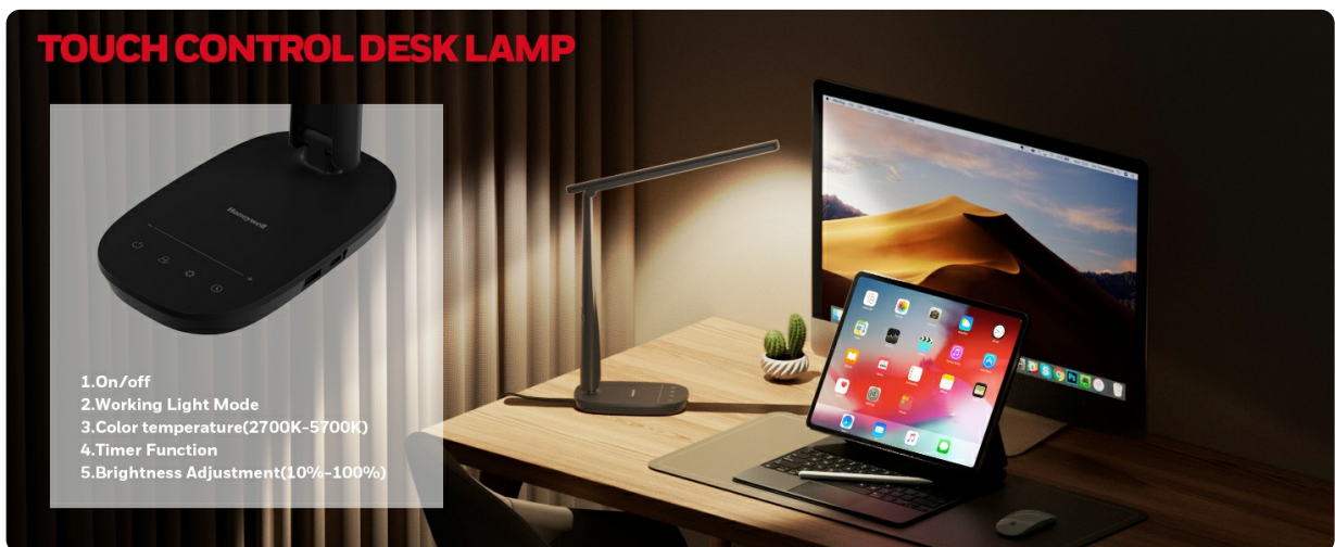
Figure 5: Stepless brightness adjustment.