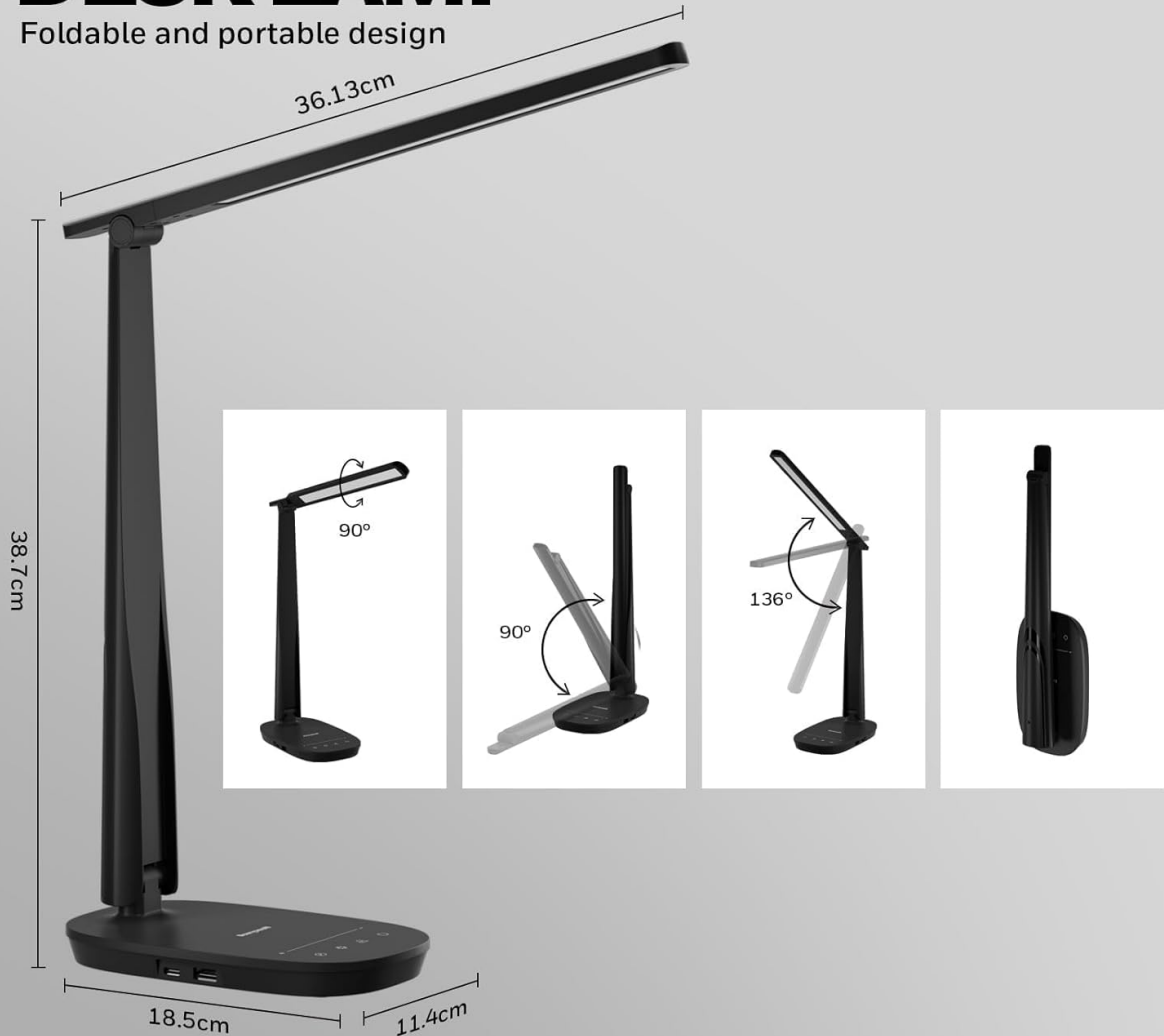
Figure 3: Adjustable and foldable design for optimal positioning.

Video 1: Demonstration of the Honeywell HWT-H2 Desk Lamp's modern design and adjustability for various work and office settings.