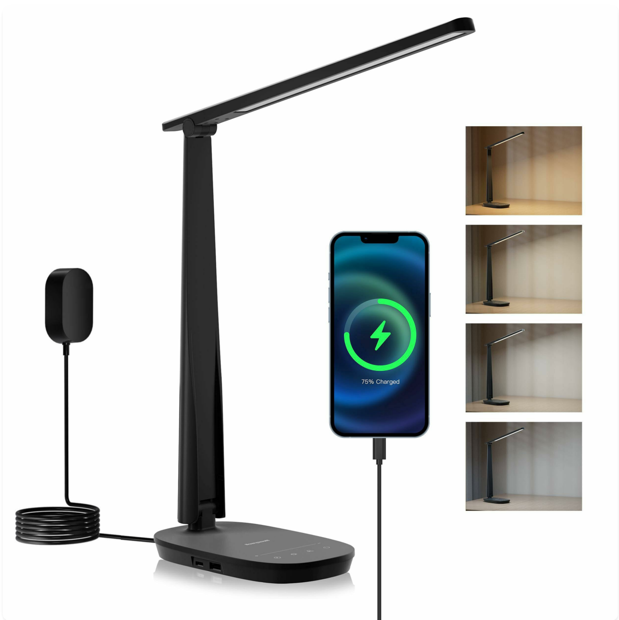
Figure 1: Honeywell HWT-H2 Sunturalux LED Desk Lamp in its extended position.