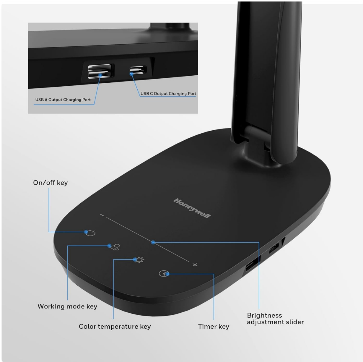
Figure 4: Touch control panel and dual charging ports on the lamp base.