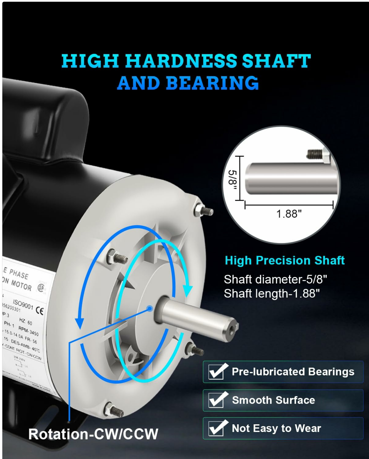
Image 3.2: Detailed view of the motor shaft, showing 5/8" diameter and 1.88" length, with indicators for CW/CCW rotation.