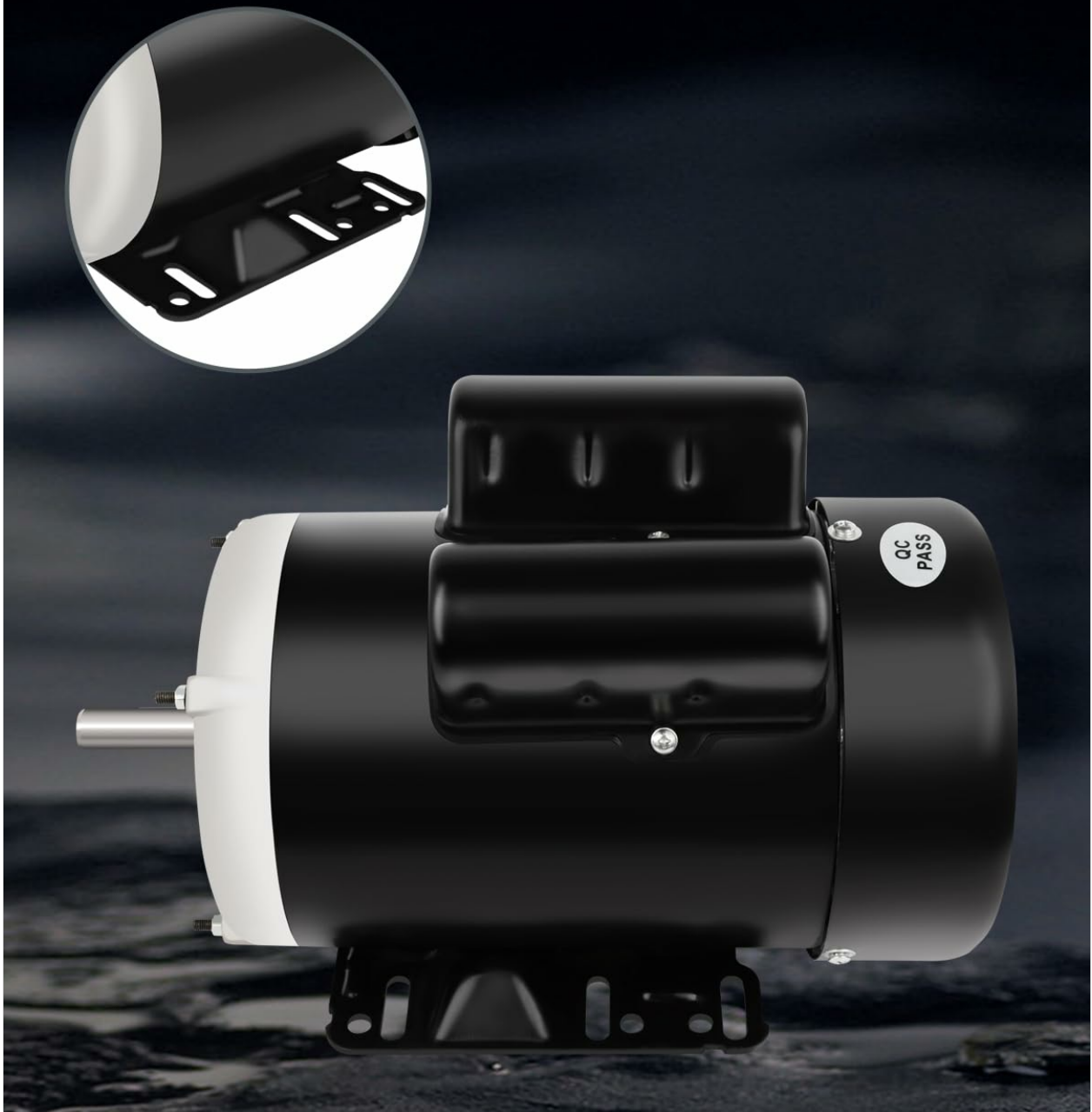
Image 5.1: The motor housing is constructed from rolled steel, offering durability and efficient heat dissipation.

The motor housing is made of rolled steel shell