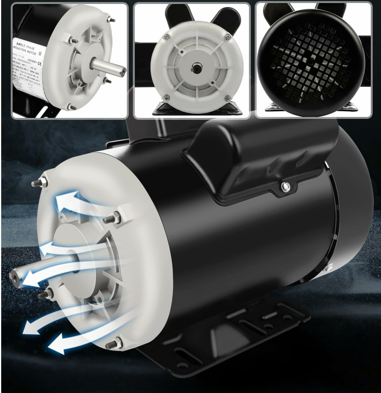
Image 3.1: The motor features a fully enclosed fan for efficient cooling, indicated by airflow arrows.