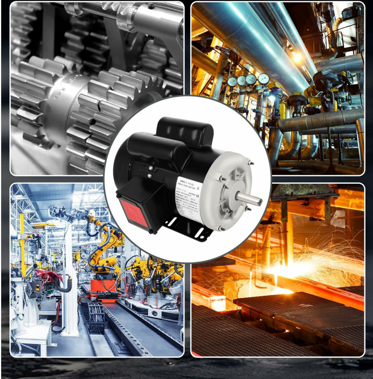
Image 4.1: Examples of typical applications for this type of electric motor, including industrial machinery and agricultural equipment.

Replace the old motor, work more efficiently