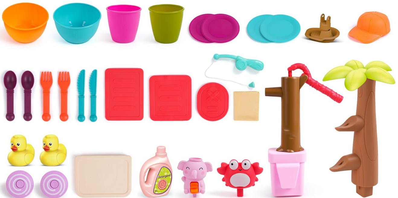
Image: Detailed view of the product components and their dimensions, providing a clear overview of what is included and the overall size.