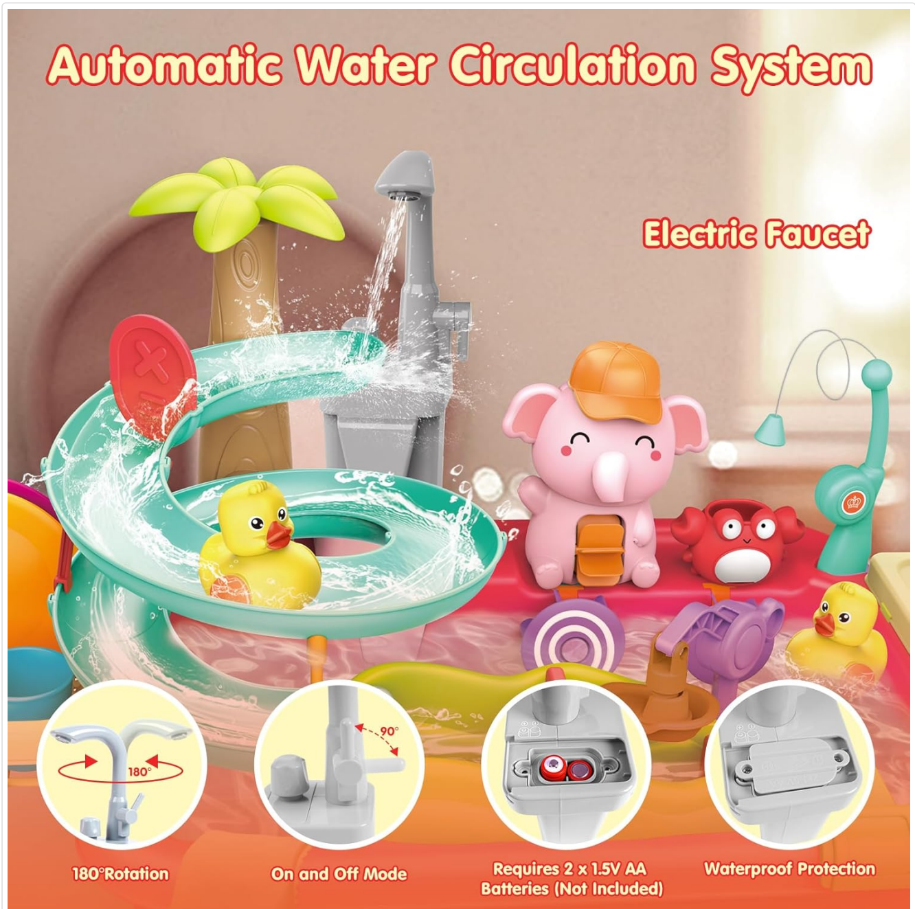
Image: Close-up view of the electric faucet and the automatic water circulation system, highlighting the battery compartment and waterproof protection.