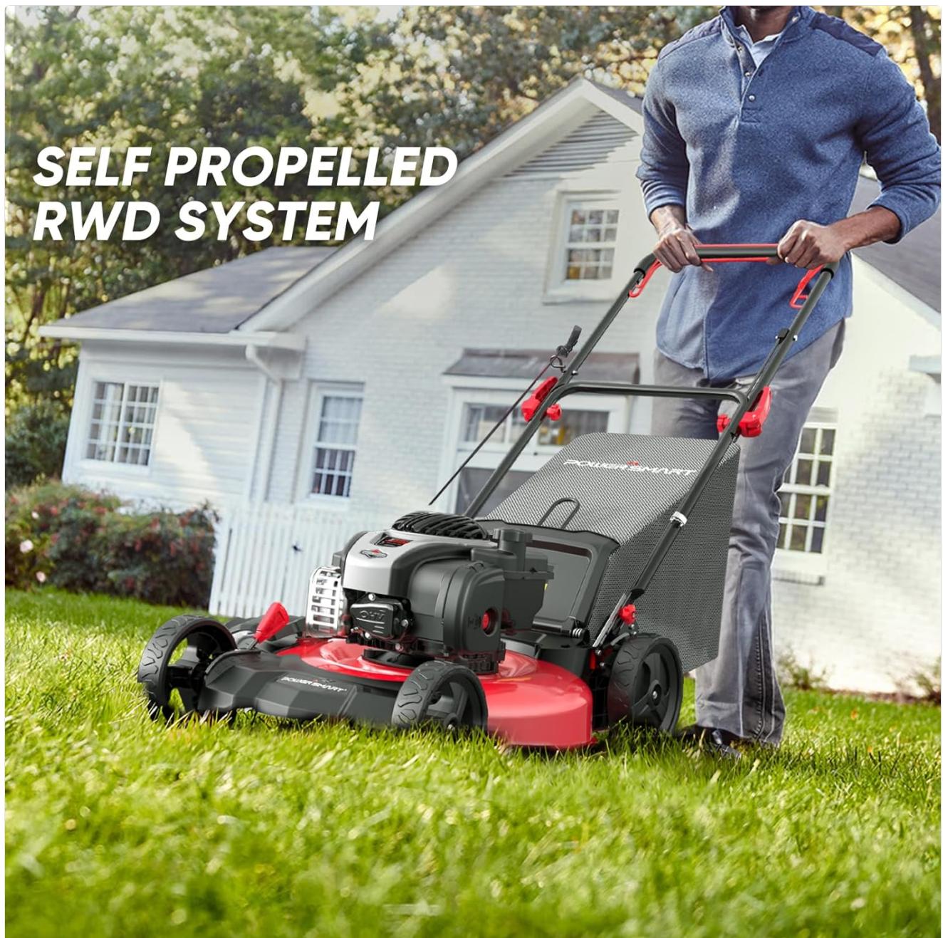
Figure 4.3: A person is shown operating the PowerSmart self-propelled lawn mower on a lawn, demonstrating its ease of use with the rear-wheel drive system.