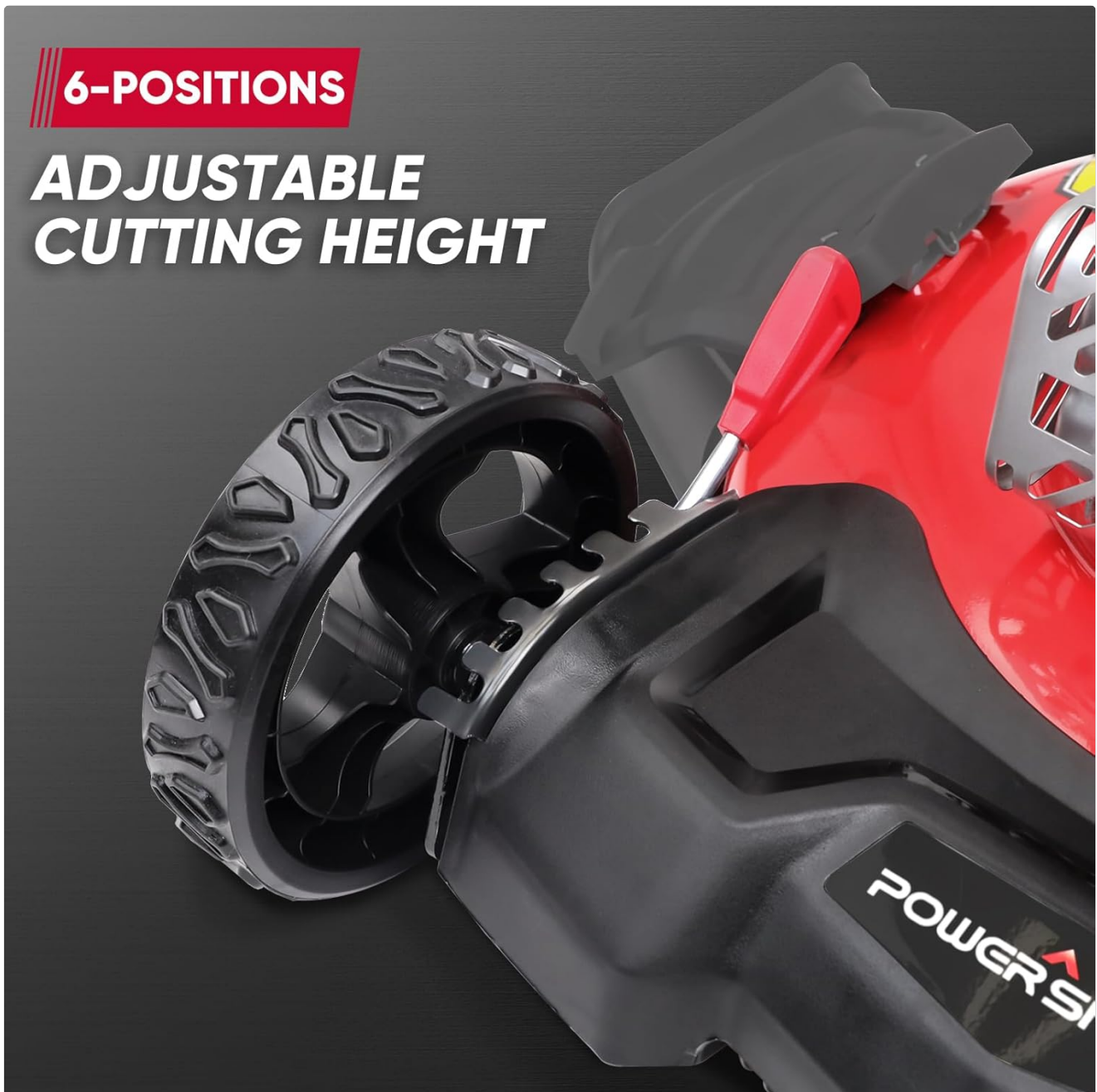
Figure 4.2: Detail of the 6-position single-lever height adjustment mechanism on the mower's wheel, allowing for easy changes to cutting height.