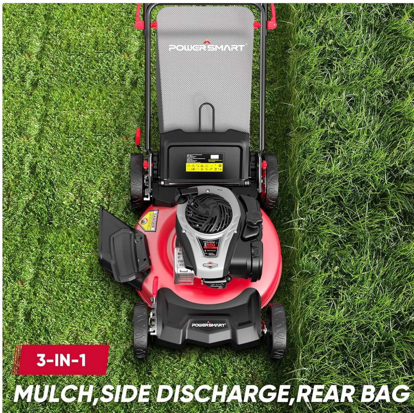
Figure 4.4: Overhead view of the mower illustrating its 3-in-1 functionality, highlighting options for mulching, side discharge, and rear bagging.