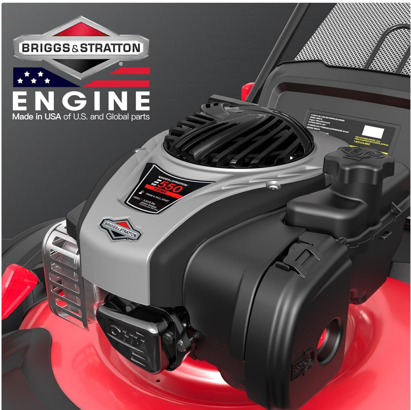
Figure 4.1: Close-up view of the Briggs and Stratton 140cc engine, highlighting its design and components for starting.