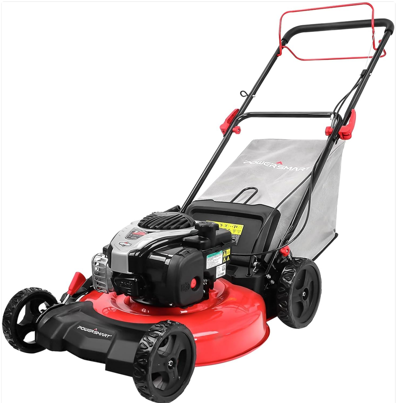
Figure 1.1: PowerSmart 21-Inch Self Propelled Gas Lawn Mower. This image shows the complete lawn mower with its handle extended and grass bag attached, ready for use.