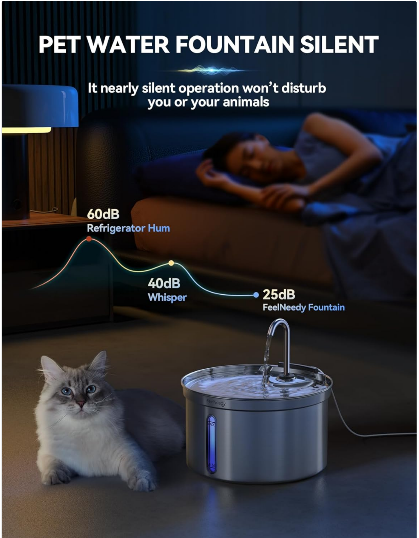
Image: Demonstration of the fountain's silent operation, highlighting its low noise level compared to common household sounds.