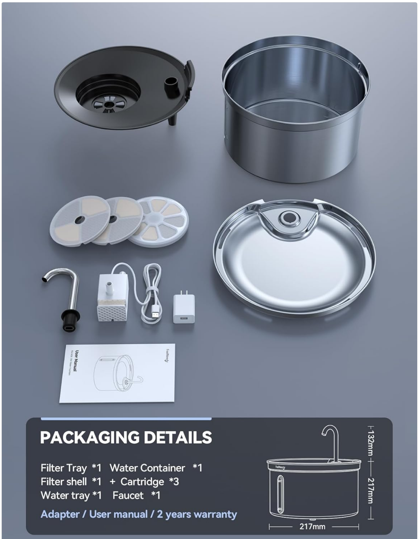
Image: Overview of all included components for the FEELNEEDY Stainless Steel Cat Water Fountain, showing the main stainless steel body, the top tray with faucet, the pump, filter cartridges, and power accessories.