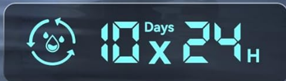
Image: Visual representation of the 3.5L large capacity, highlighting its ability to provide sufficient water for extended periods.

The right amount of water to satisfy thirsty four-legged friends without leaving too much water