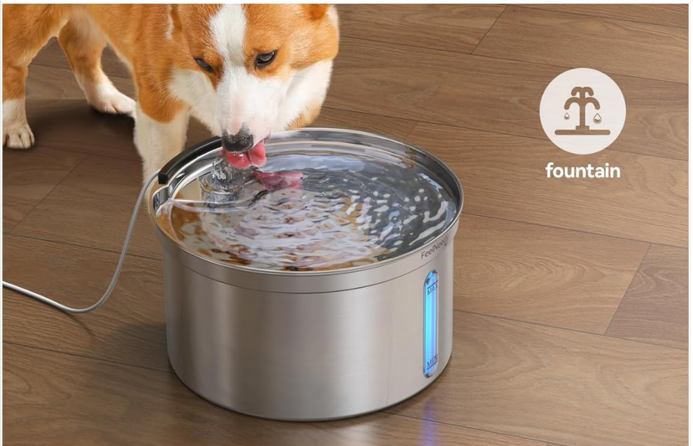
Image: Illustration of the two spout modes: a faucet waterfall for cats and a bubbling fountain for dogs, designed to encourage pets to drink more.