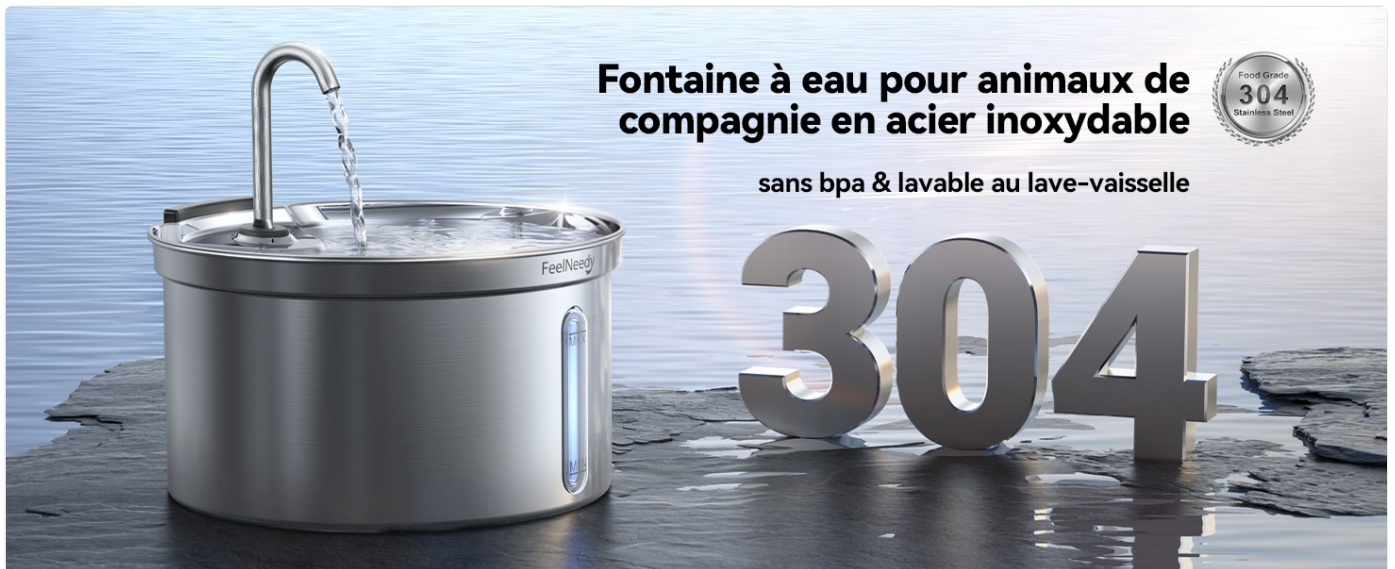
Image: Visual representation of the water level indicator, showing the difference between sufficient water (above MIN) and low water (below MIN).

operation. When the water level drops below the minimum, the pump may become louder, indicating a need for refilling.