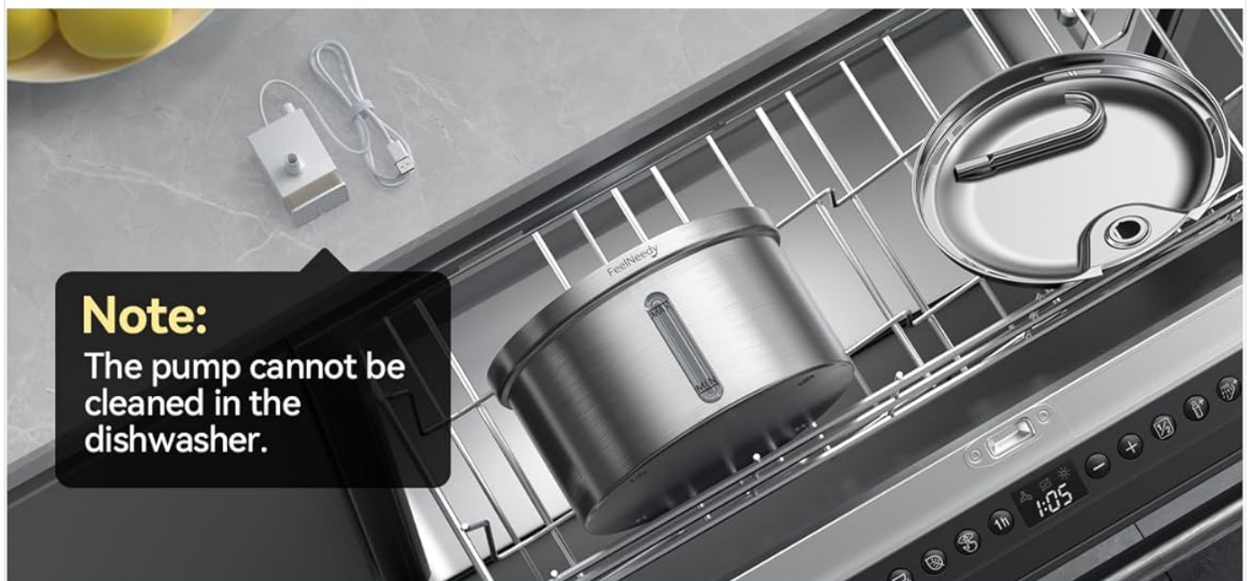
Image: Instructions for easy cleaning, showing how to hand wash components and highlighting that the stainless steel parts are dishwasher safe, with a crucial note that the pump is not.