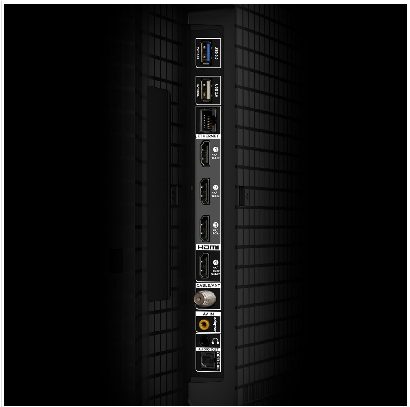
Image: Detailed view of the back panel of the TCL Q681G TV, showing various input ports including HDMI, USB, Ethernet, Cable/Antenna, AV, and Optical audio output.