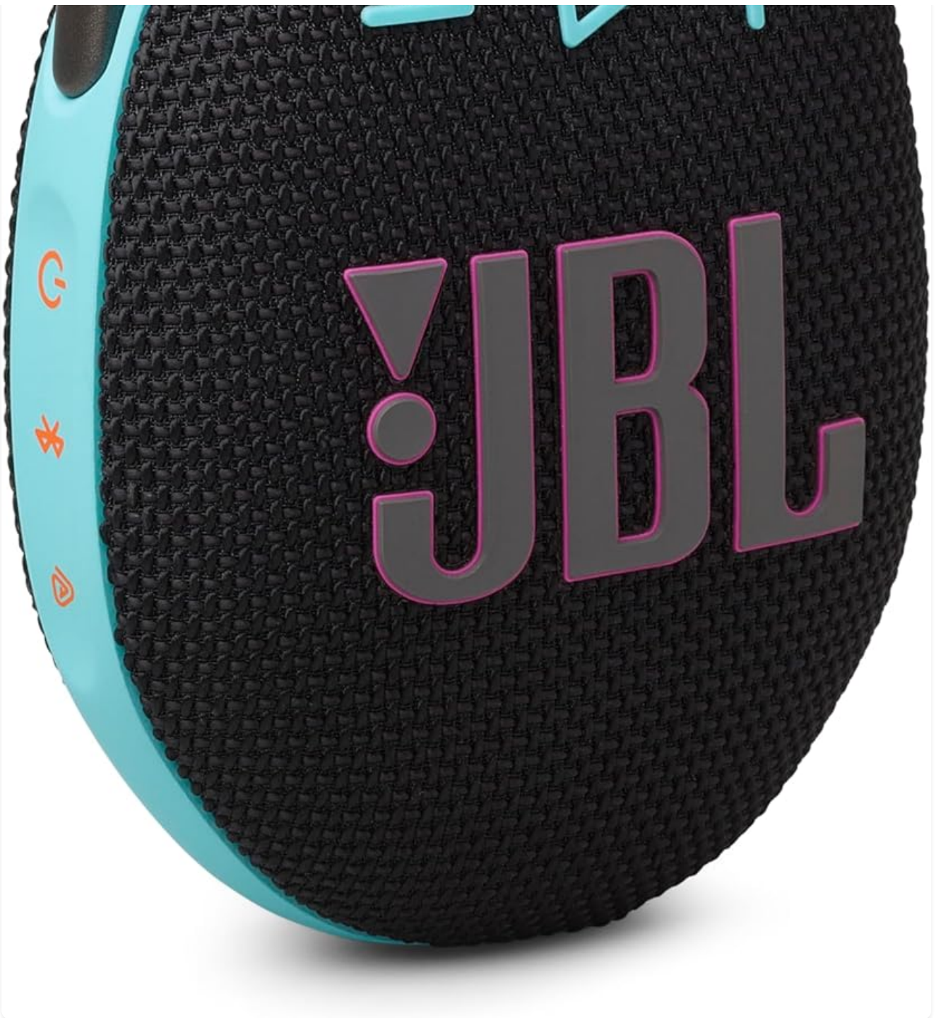
Front view of the JBL Clip 5 speaker, highlighting its compact design and integrated carabiner.