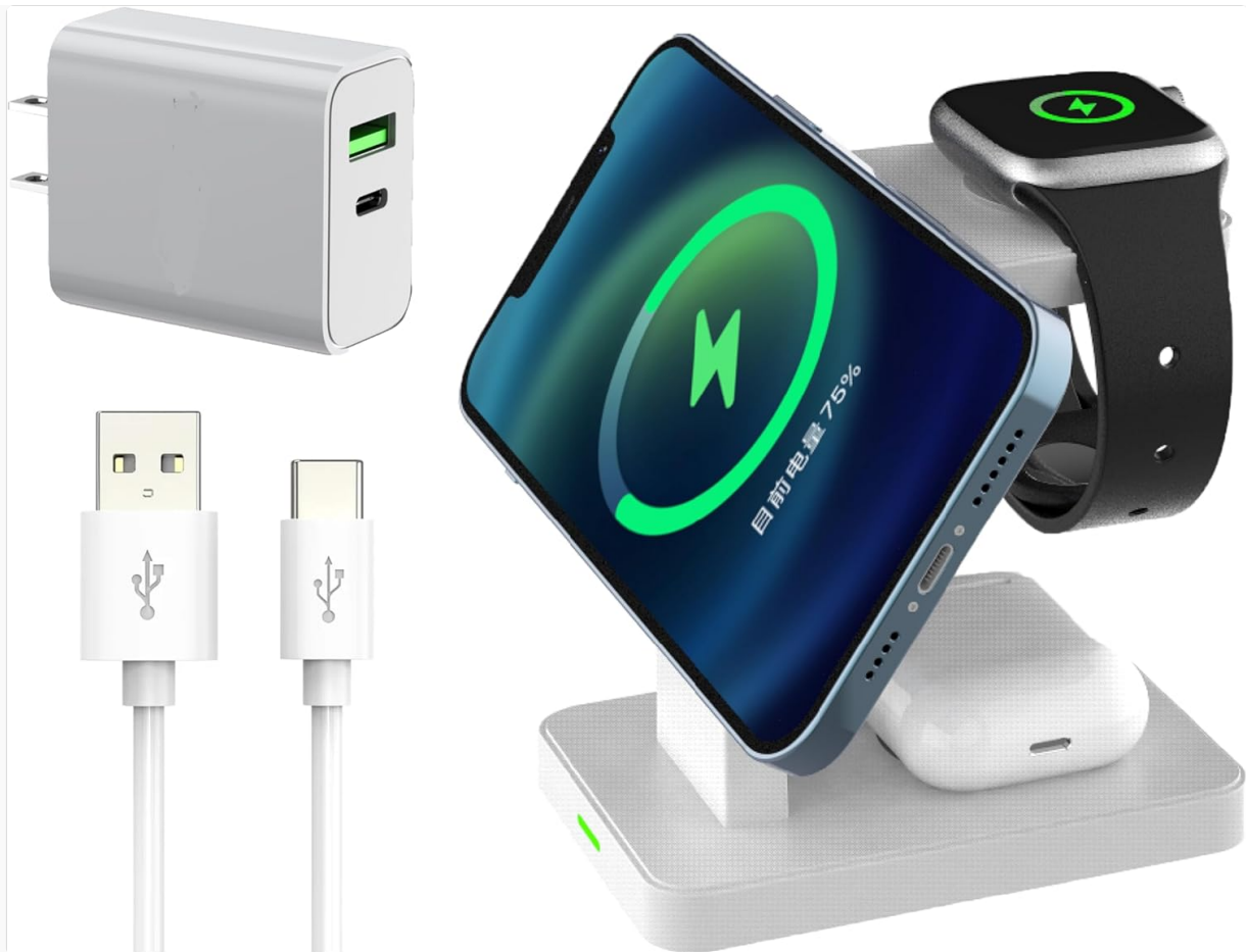
Image: The Brookstone 3-in-1 Wireless Charging Station shown with its included 18W wall charger and USB-C cable.