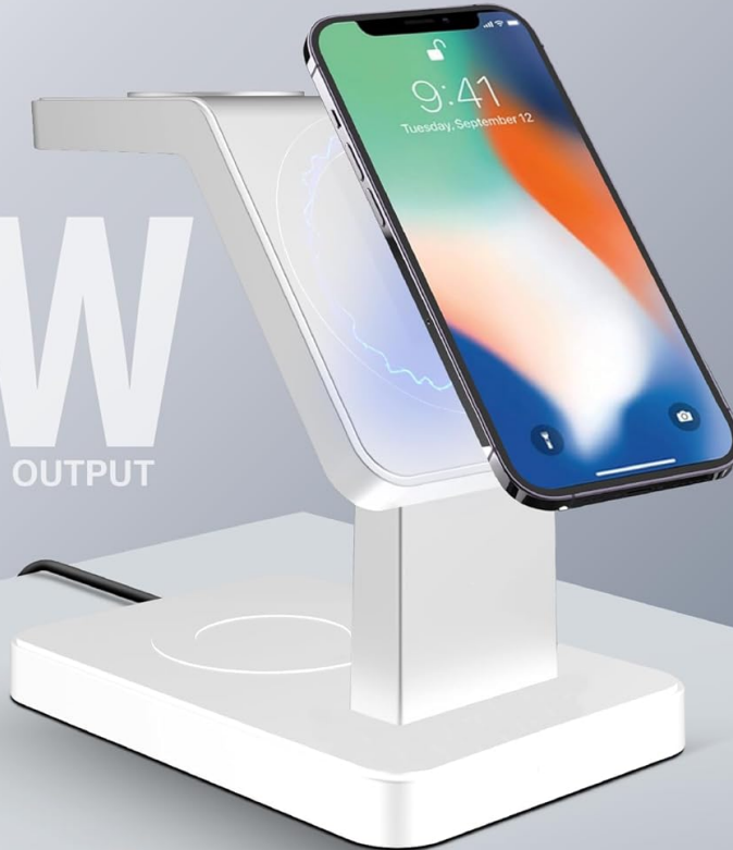
Image: The charging station in an upright position, magnetically holding an iPhone for charging.