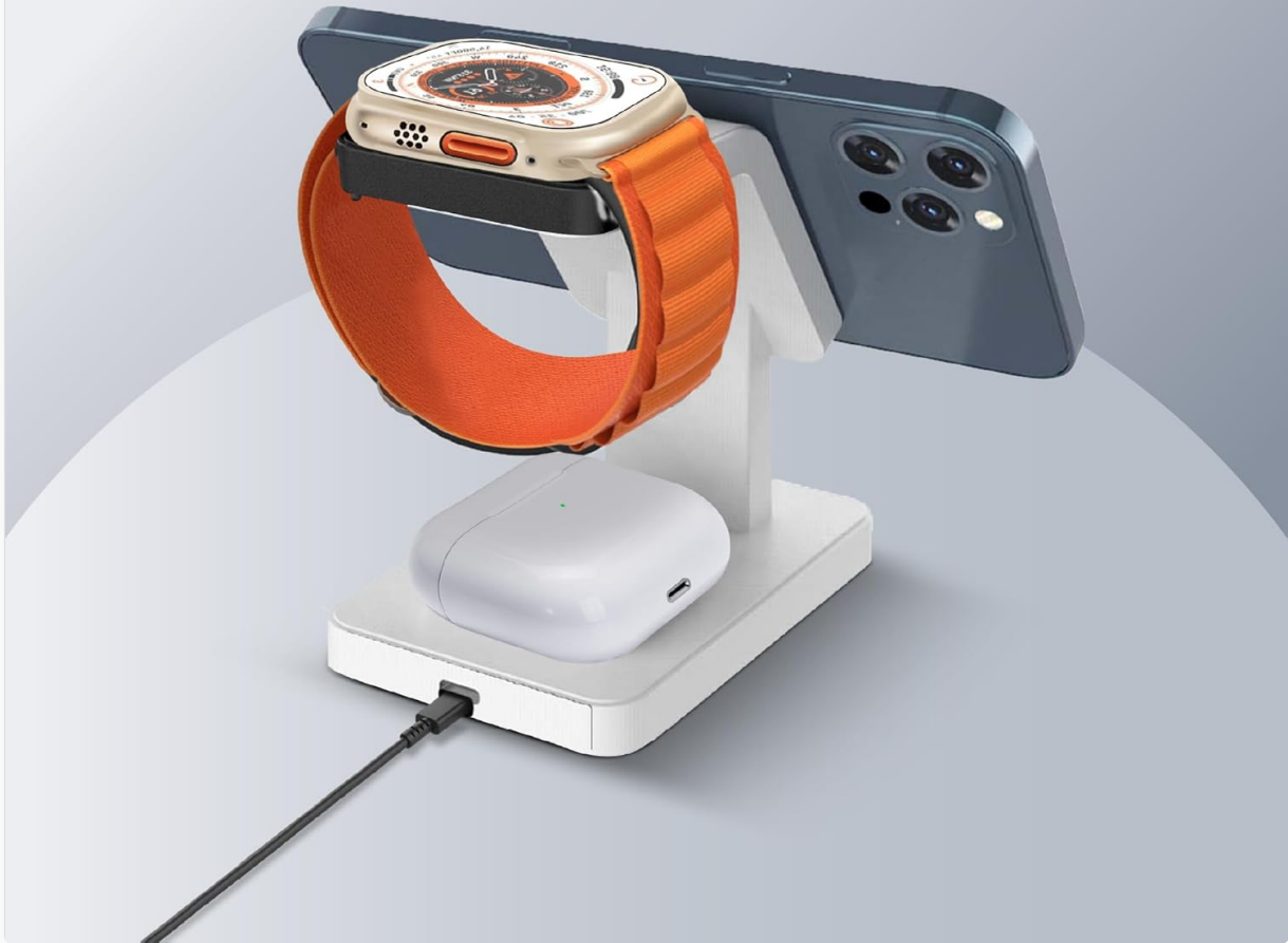
Image: The 3-in-1 charging station with an iPhone, Apple Watch, and AirPods simultaneously charging.

Brings your devices together in a symphony of charging