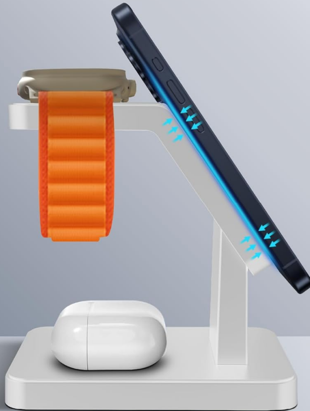
Image: A side view of the charging station demonstrating the secure magnetic attachment of an iPhone.

Strength without compromise! Our magnetic case guarantees a rock-solid connection, ensuring your phone and accessories stay securely attached.