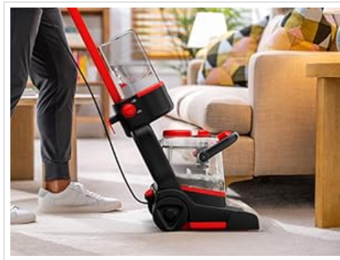
Image: The dual tank system, highlighting the clean and dirty water tanks.