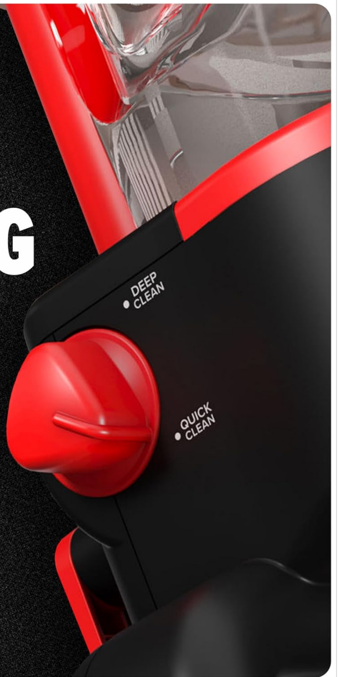
Image: The antimicrobial brush roll designed to loosen and lift stains.