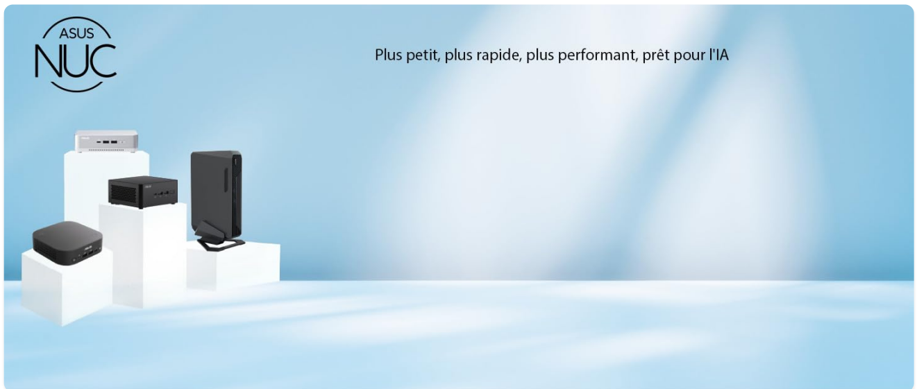
Image: The ASUS NUC 13 Pro mini PC, highlighting its compact design and suitability for business environments, powered by Intel Core processors.