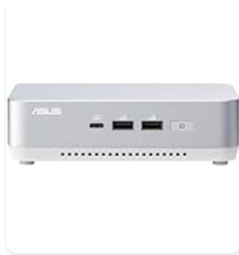
Image: ASUS NUC support features, including 24/7 comprehensive assistance and a 3-year warranty. Note: Product specifications state a 2-year warranty, please refer to official documentation for the most accurate information.

This ASUS NUC 13 Pro comes with a 2-year manufacturer's warranty . For detailed terms and conditions, please refer to the warranty card included with your product or visit the official ASUS support website.