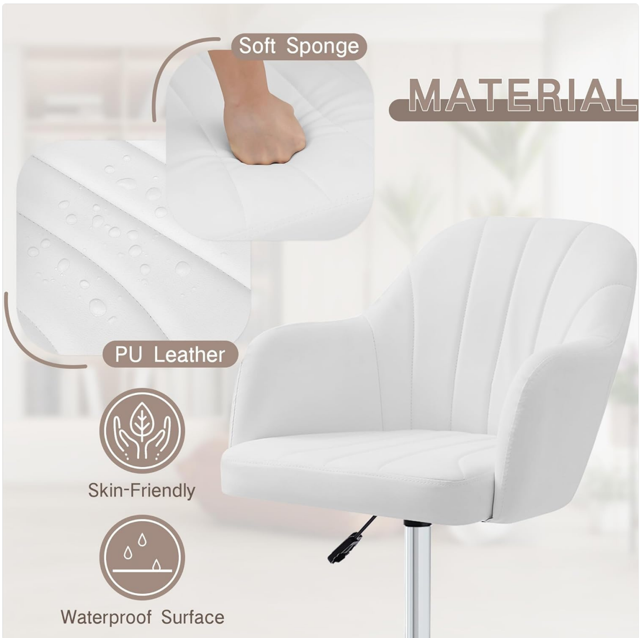
Image: PU Leather Material Details. This image shows the texture of the PU leather, highlighting its waterproof and easy-to-clean properties.