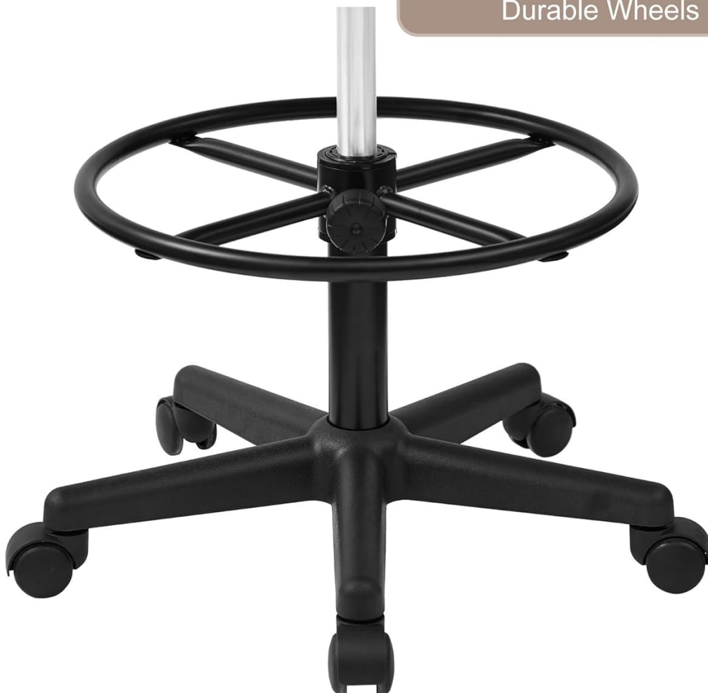
Image: Heavy Duty Chair Base with Casters. This image shows the robust five-star base with smooth-rolling casters and the footrest ring attached to the gas lift.