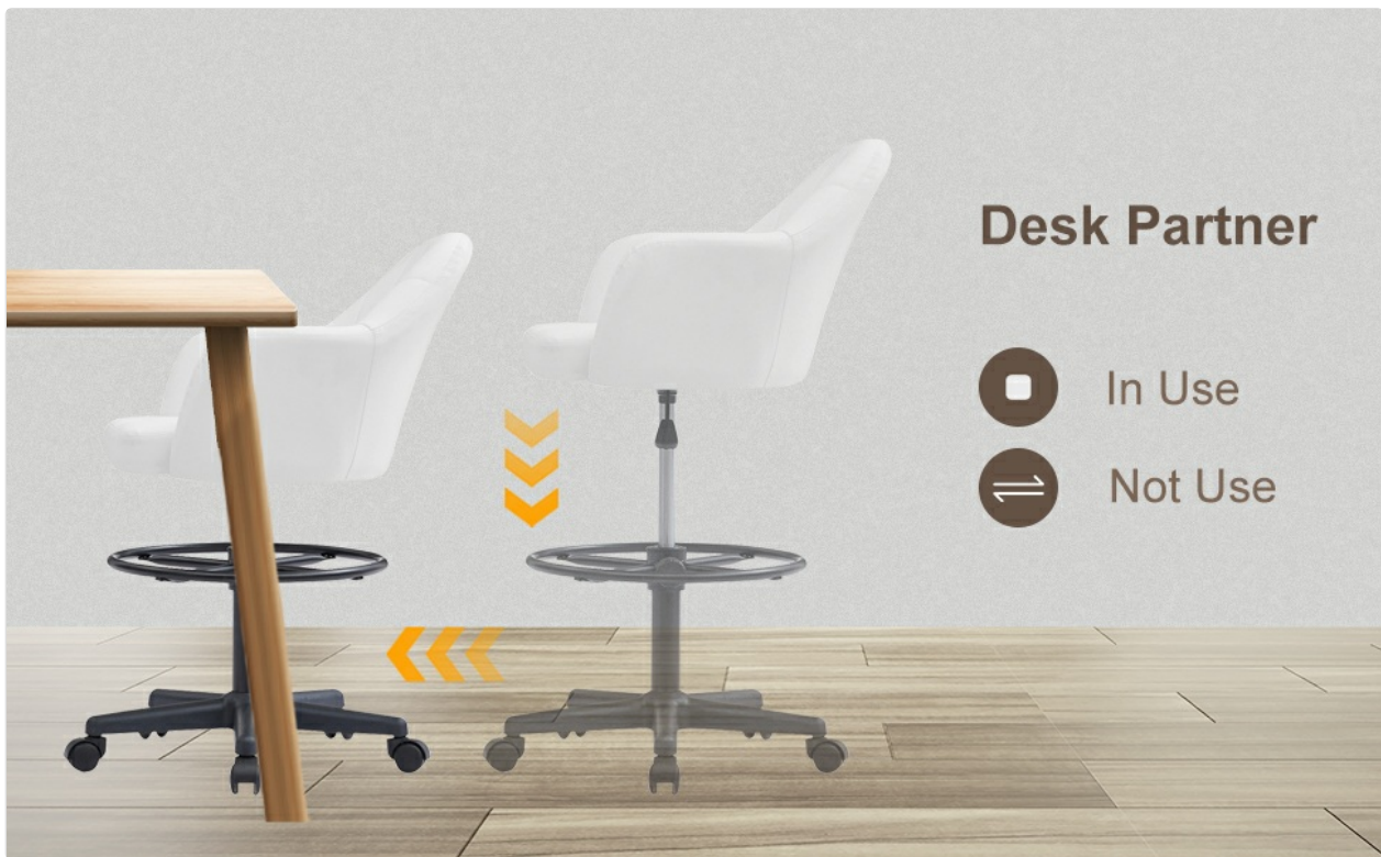
Image: Chair Movement under Desk. This image demonstrates the chair's mobility, showing it can be easily moved in and out from under a desk.