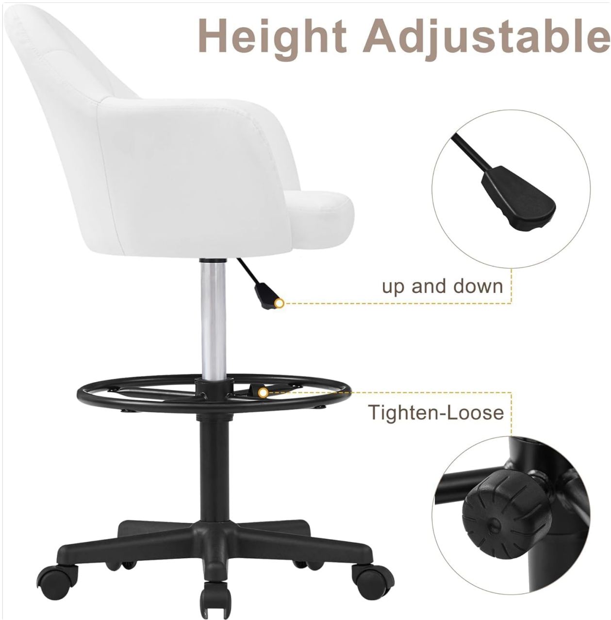
Image: Height Adjustment and Footrest Mechanism. This image illustrates the lever for seat height adjustment and the knob for footrest ring adjustment.