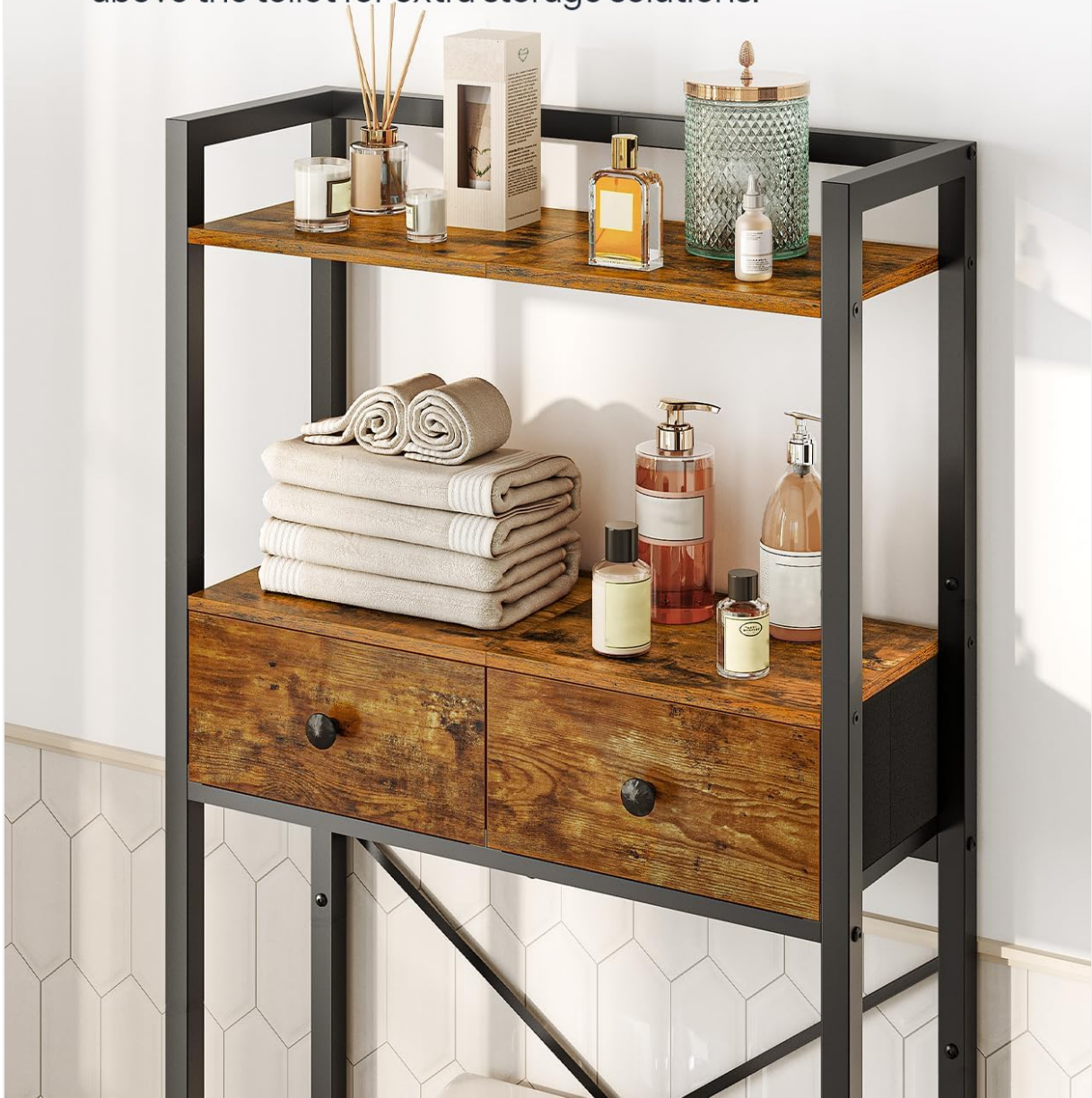
Figure 6: Organized Shelves. This image illustrates how to effectively organize various items on the shelves, demonstrating the rack's storage potential.

Maximizes the space above the toilet for extra storage solutions.