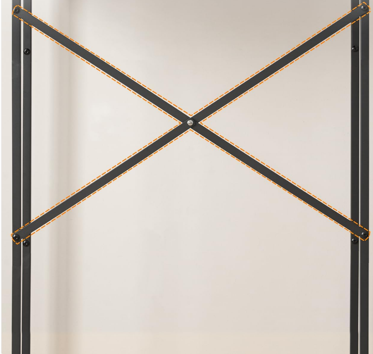
Figure 4: X-Shaped Support. This image demonstrates the X-shaped back support, which is crucial for the structural integrity and stability of the unit.

Enhance stability for a secure hold on all your items.