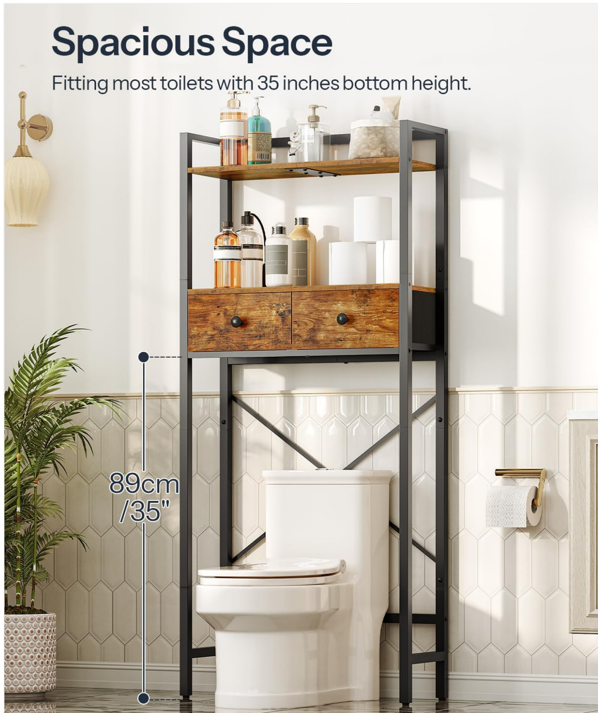
Figure 3: Product Dimensions. This diagram illustrates the overall dimensions of the storage rack and the individual drawer dimensions, including the 35-inch clearance for the toilet.