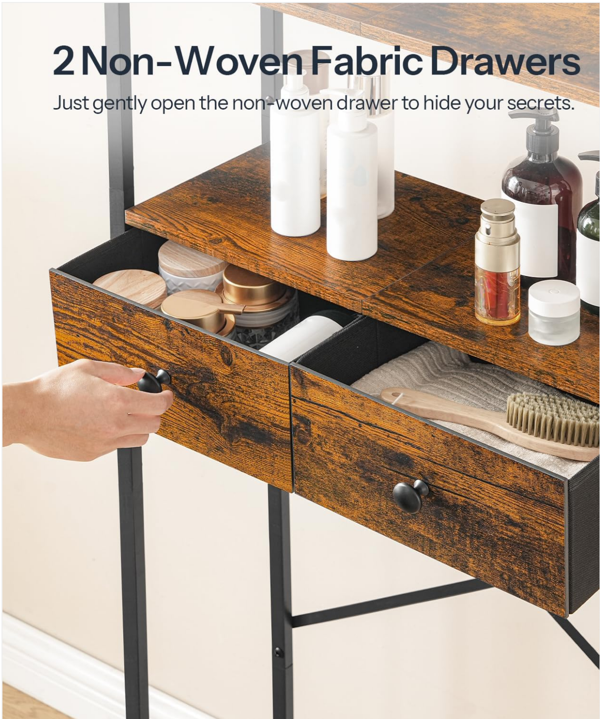
Figure 2: Non-Woven Fabric Drawers. This image shows the two pull-out drawers, ideal for concealing items and maintaining a tidy appearance.

Just gently open the non-woven drawer to hide your secrets.