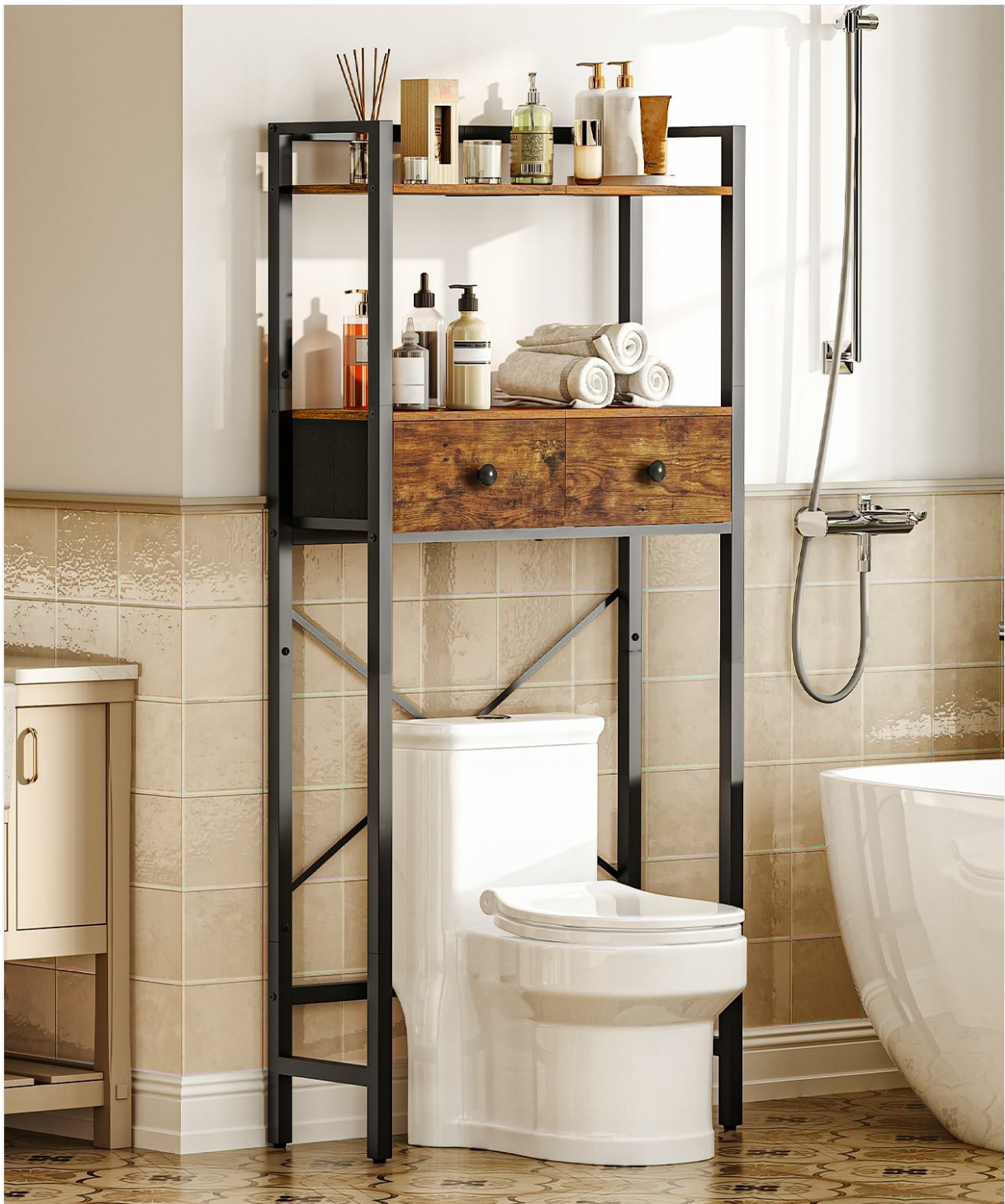
Figure 1: HOOBRO BF47TS01 Over-the-Toilet Storage Rack. This image displays the assembled storage unit in a bathroom, highlighting its design and capacity.