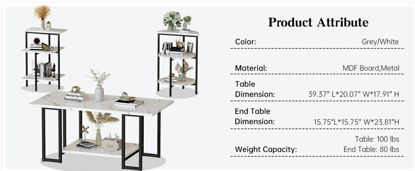
Image: Illustration of the easy-to-clean faux marble surface.

Weight Capacity: Table: 100 lbs End Table: 80 lbs