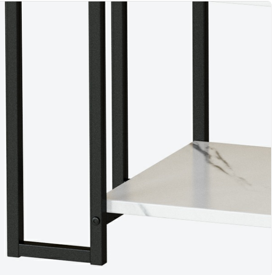
Image: Overview of the 3-piece table set, highlighting key features.

The metal foot joints also have reinforcement parts that make the table more reliable and can easily support 100 pounds of weight