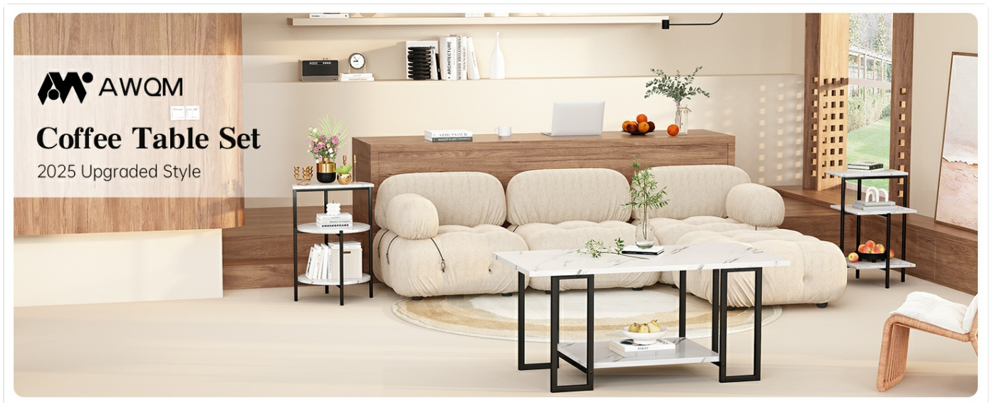
Image: Key product attributes and dimensions.