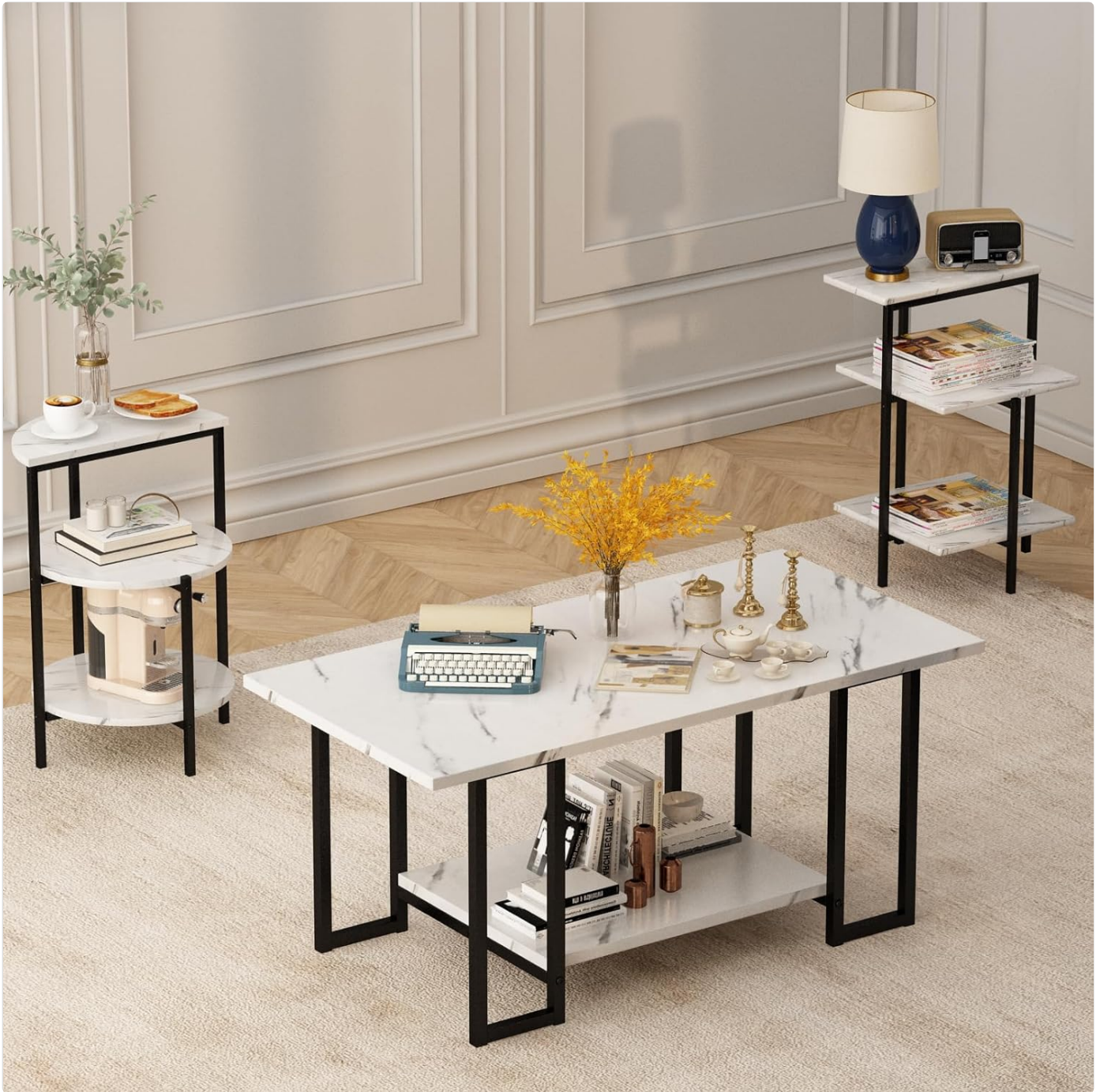
Image: The table set in a living room, demonstrating typical usage.