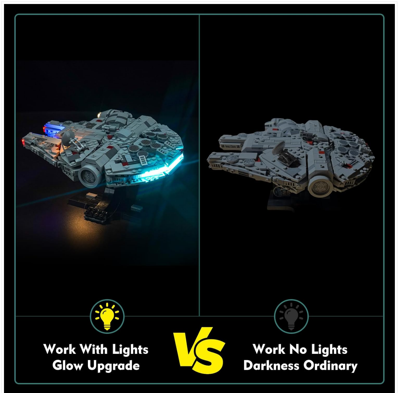
Image 4.2: A side-by-side comparison illustrating the visual enhancement provided by the LED light kit on the Millennium Falcon model.