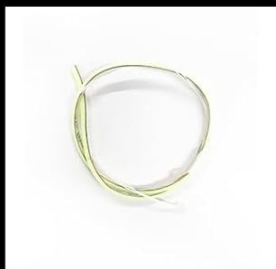
1 × Light Strip-Cyan-COB