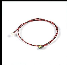
2 × Light-15CM Warm White