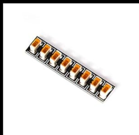
1 × 8 Expansion Board