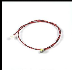
1 × High-Brightness light 15CM-Blue