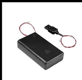
1 × Power Supply