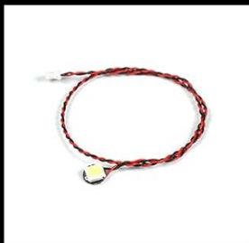
2 × High-Brightness light 15CM-Warm White