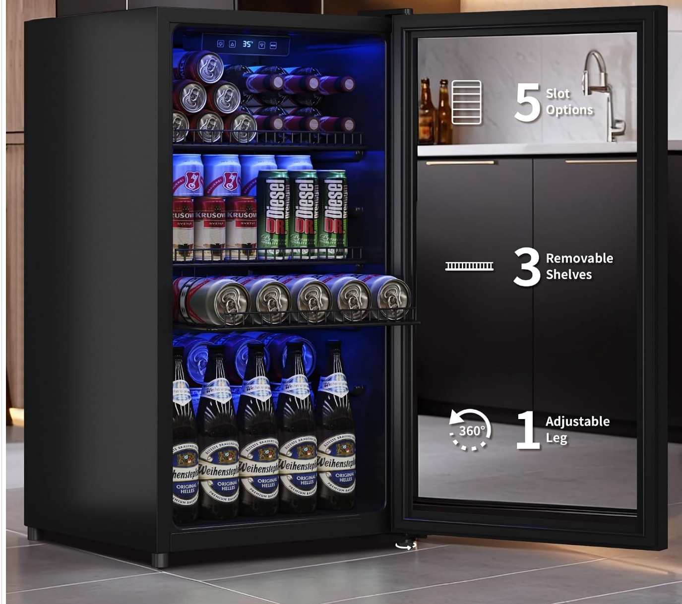
Image 3.2: Interior view of the fridge highlighting the adjustable shelves and the adjustable leveling leg at the bottom.