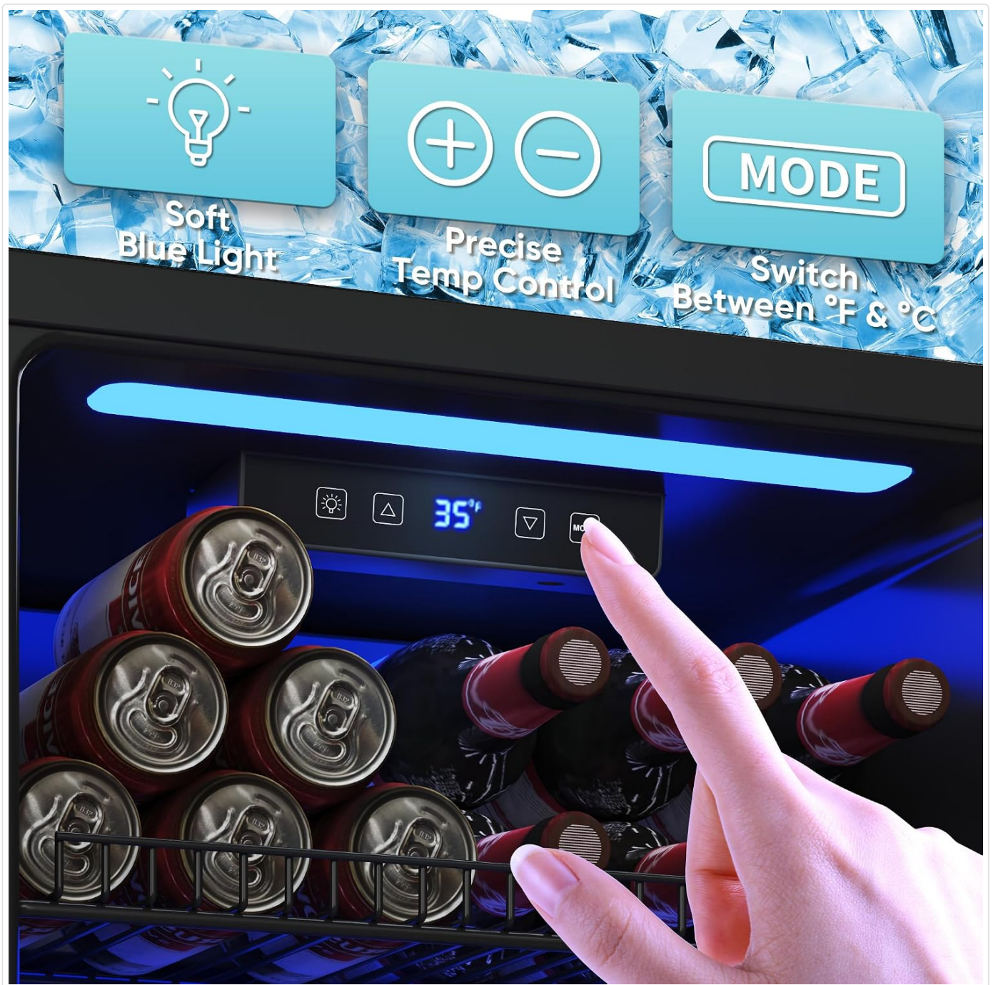
Image 4.1: Detailed view of the touch control panel, showing buttons for light, temperature adjustment, and mode selection.