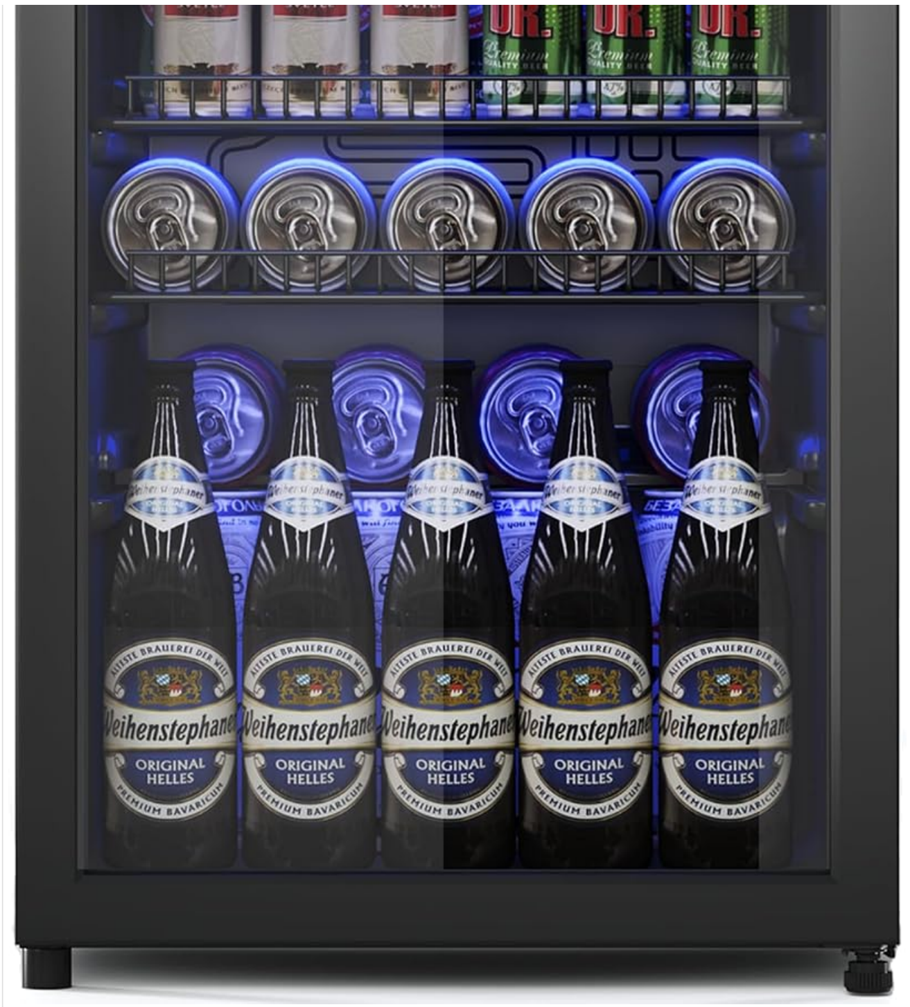
Image 1.1: Front view of the Tehanld 3.2 Cu.Ft Beverage Fridge, showcasing its capacity for various beverages.