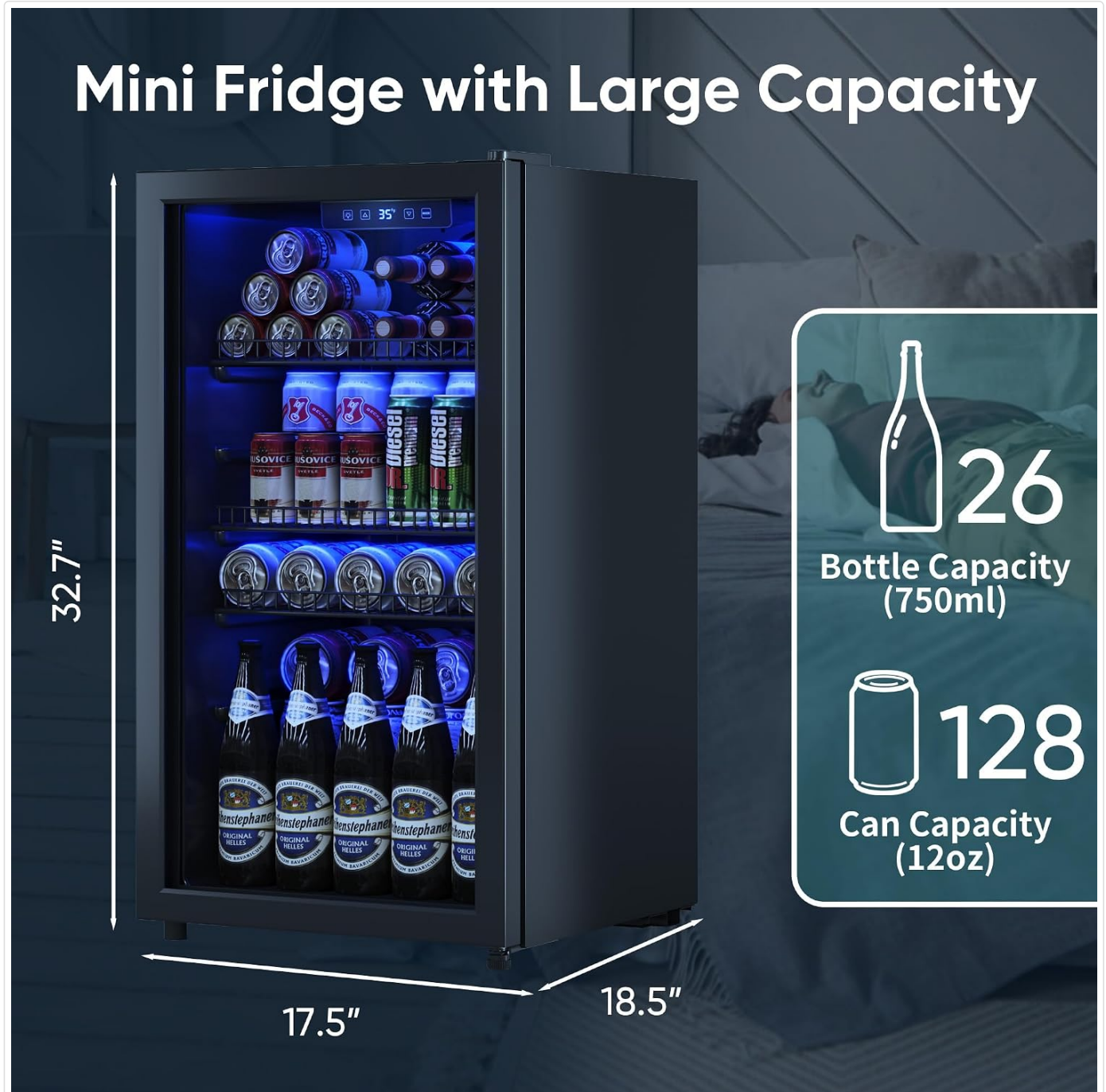
Image 3.1: Visual representation of the beverage fridge's dimensions and capacity, showing it can hold 26 bottles or 128 cans.

Place the appliance on a flat, stable surface away from direct sunlight and heat sources. Ensure adequate ventilation around the unit. The external dimensions are approximately 18.5"D x 17.5"W x 32.7"H.