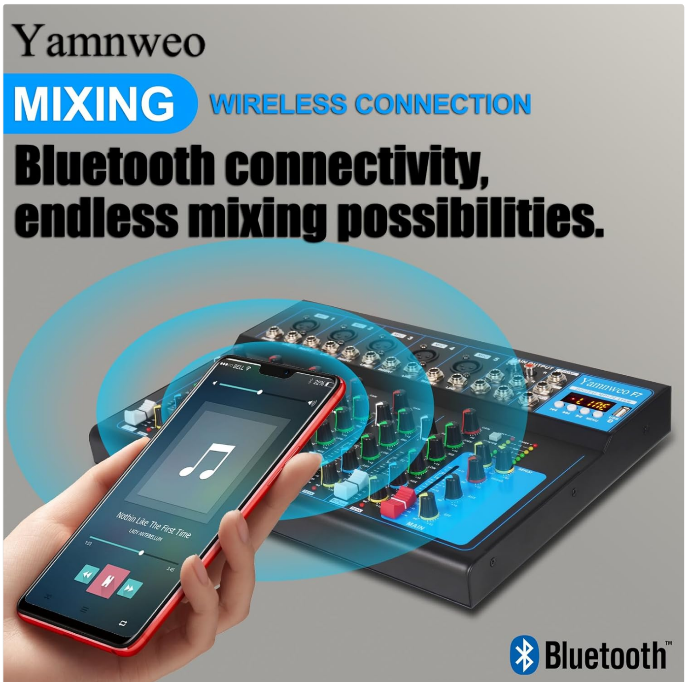
Figure 5: Illustrates Bluetooth connectivity with a smartphone.