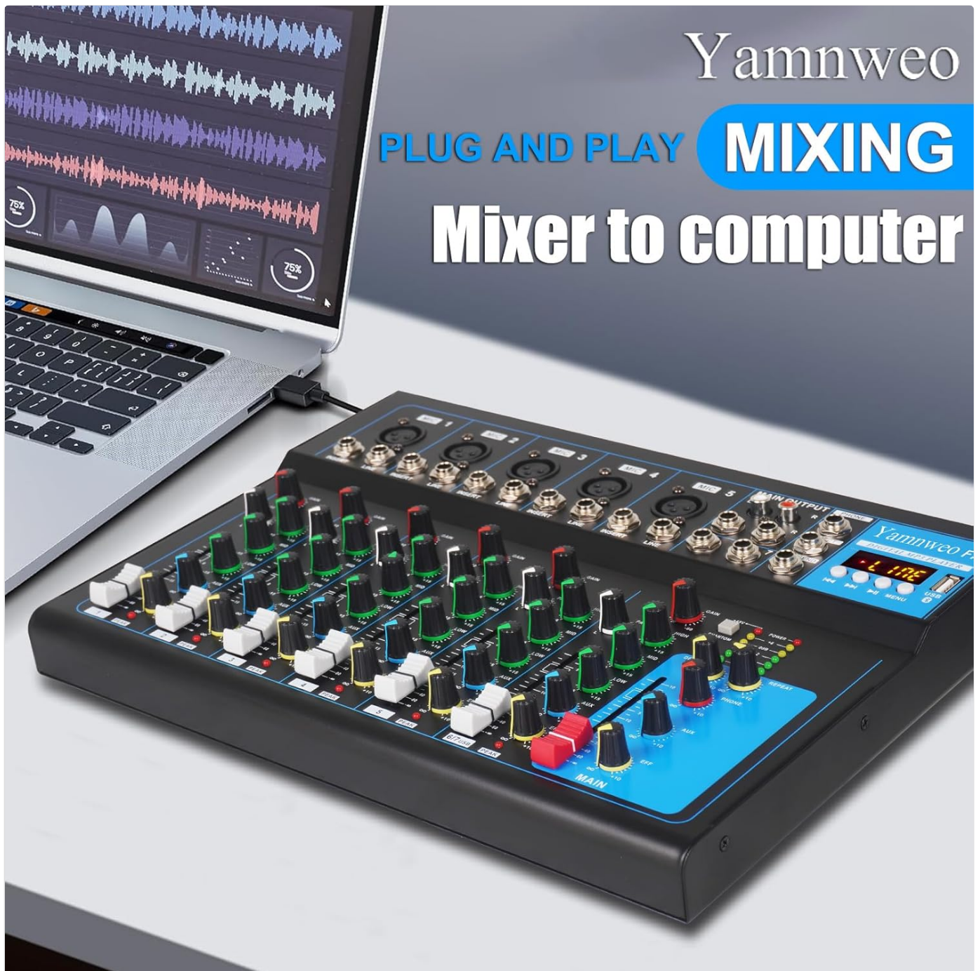
Figure 6: The GH7 mixer connected to a laptop for recording or playback.