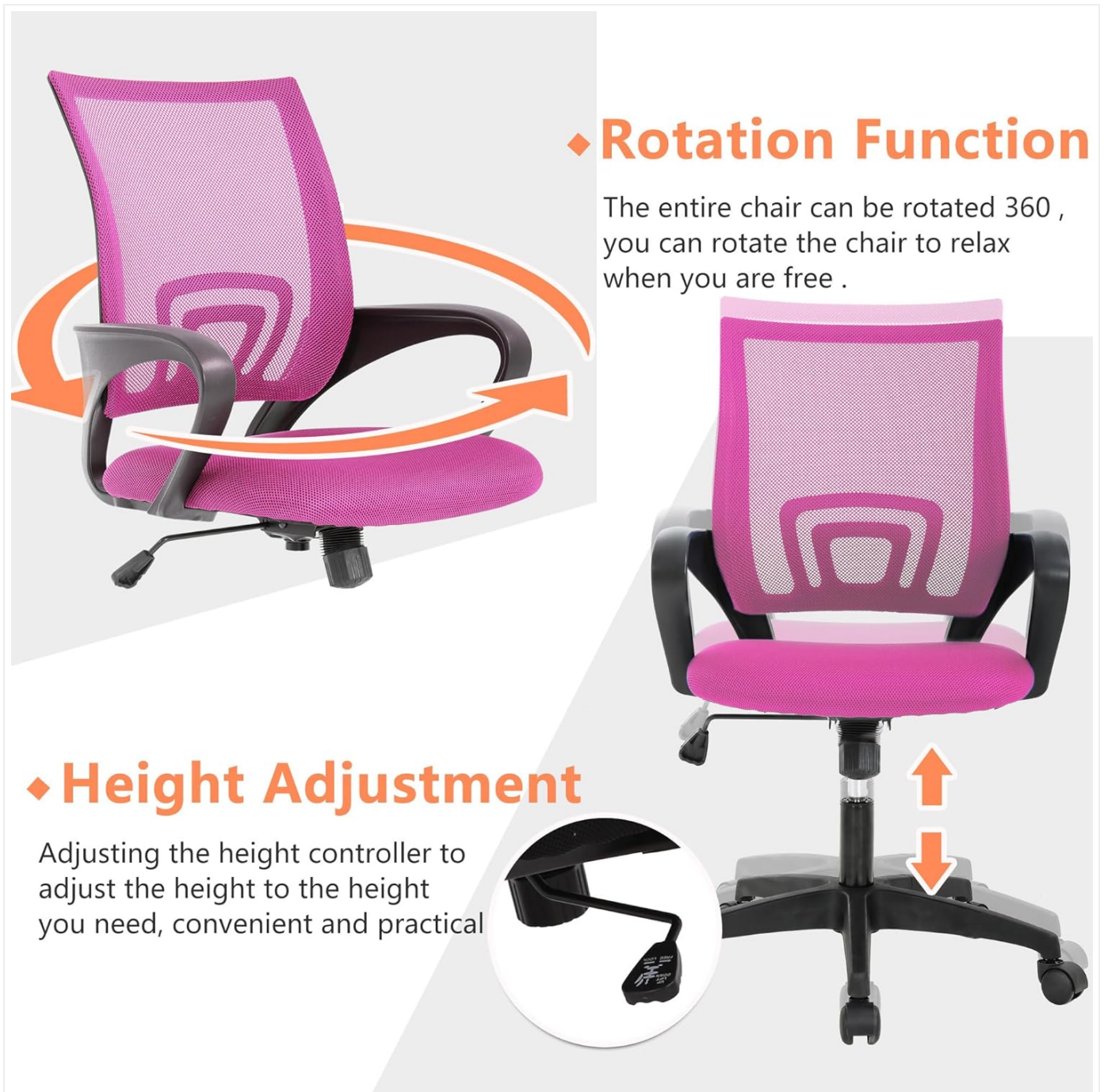
Figure 3: Illustration of the chair's 360-degree rotation and height adjustment mechanism.