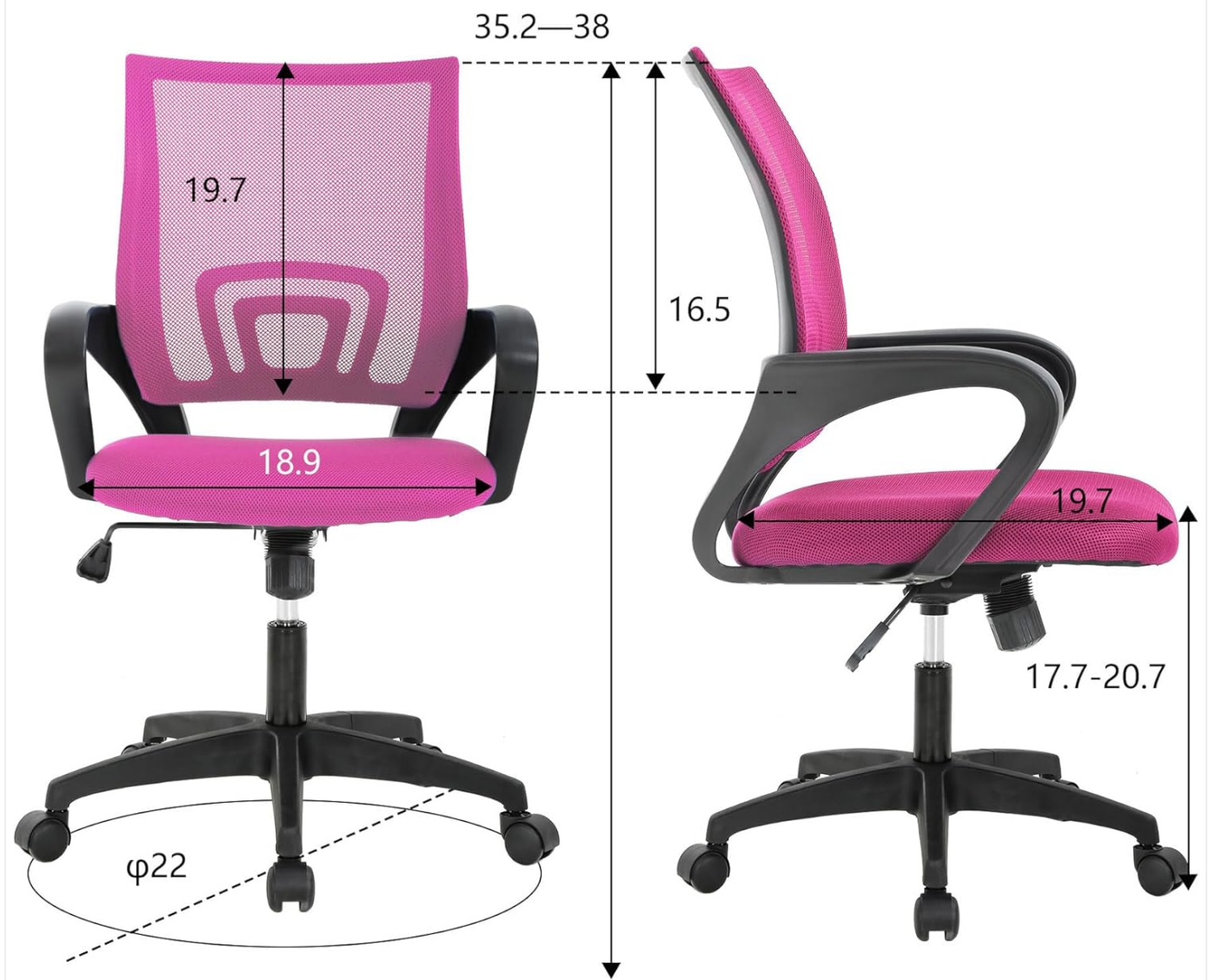
Figure 1: The PayLessHere Home Office Chair in a typical office environment.