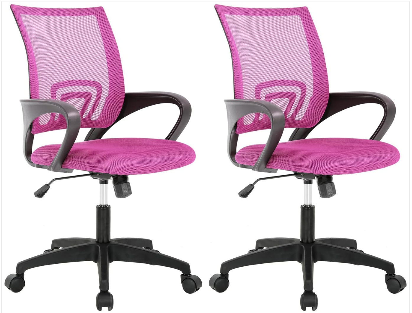
Figure 2: Two assembled PayLessHere Home Office Chairs, showcasing the design and color.