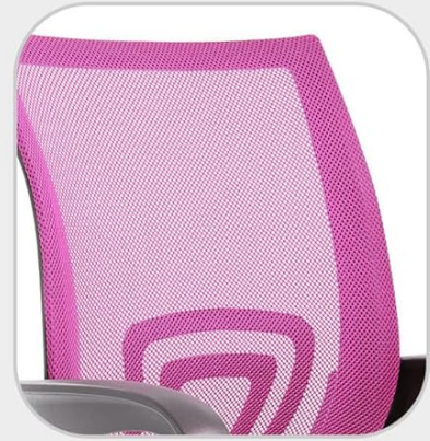
Good air permeability