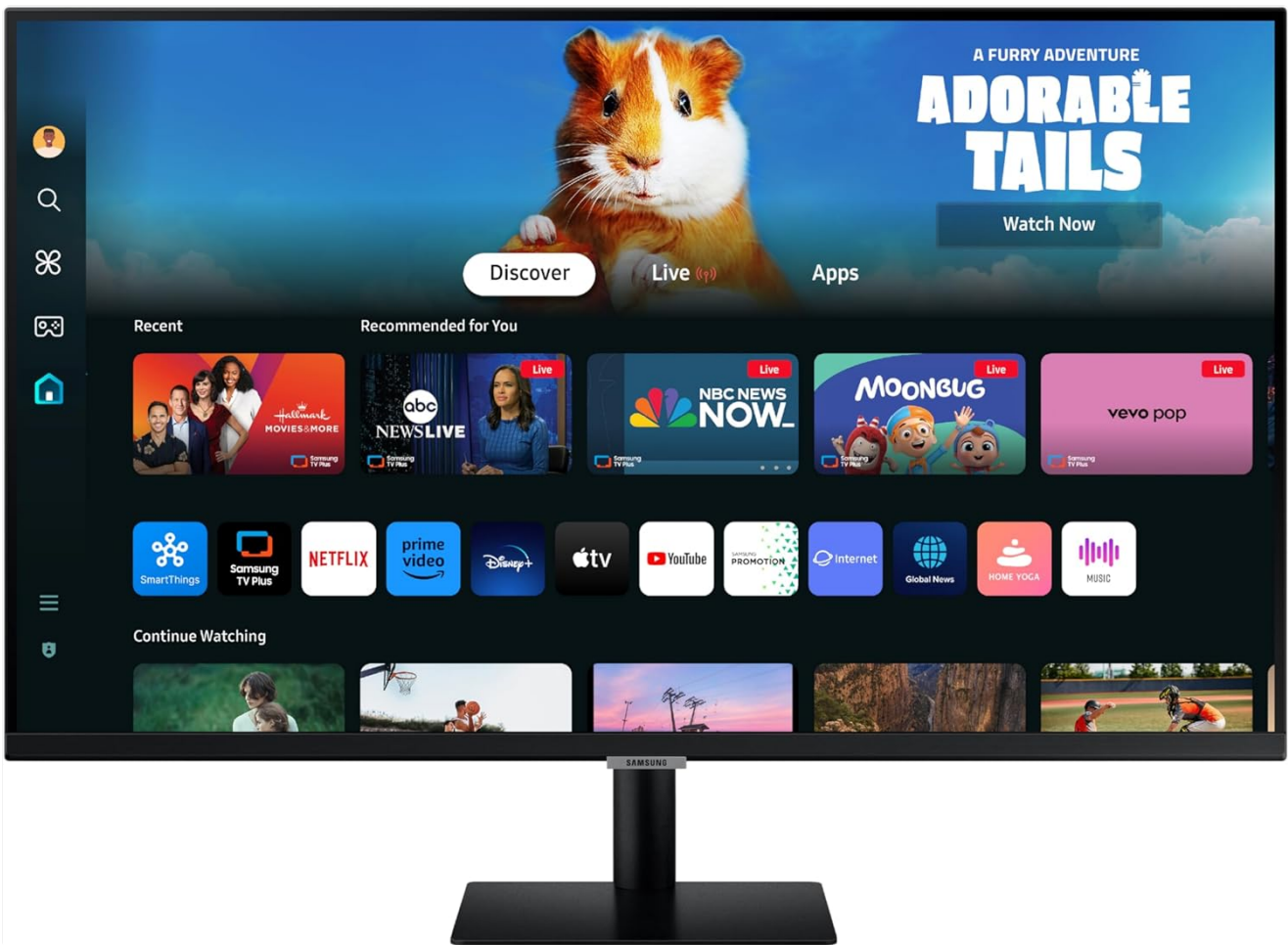
Figure 1: Front view of the Samsung 32-inch M5 Smart Monitor.