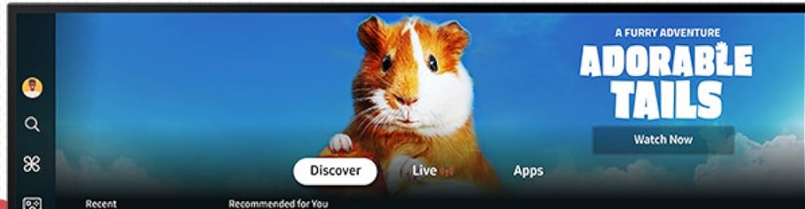
Figure 3: Monitor displaying the Smart Hub interface with streaming applications.