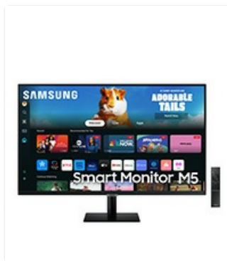
Figure 8: Examples of vision accessibility tools.

The Smart Monitor includes accessibility tools designed for low vision users. These features include screen magnification, color switching options, and audio descriptions for TV settings to improve usability.