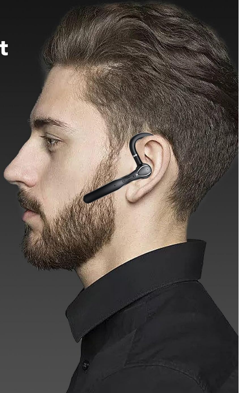
Image: A man wearing the FAMOO Bluetooth Headset, illustrating its adjustable design for a comfortable fit on either the left or right ear. The image highlights the ergonomic ear hook design.