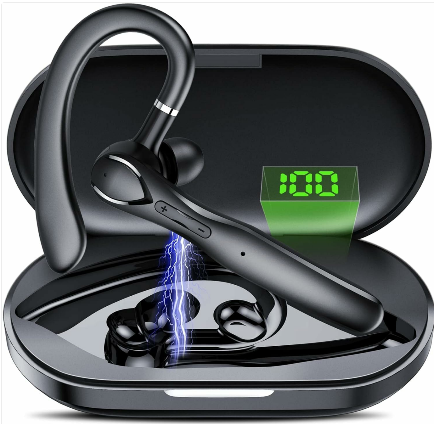
Image: The FAMOO Bluetooth Headset inside its charging case, illustrating battery life and charging duration. The charging case provides up to 100 hours of total play time, with the headset offering 20 hours of play time on a single charge. A full charge takes approximately 1.5 hours.