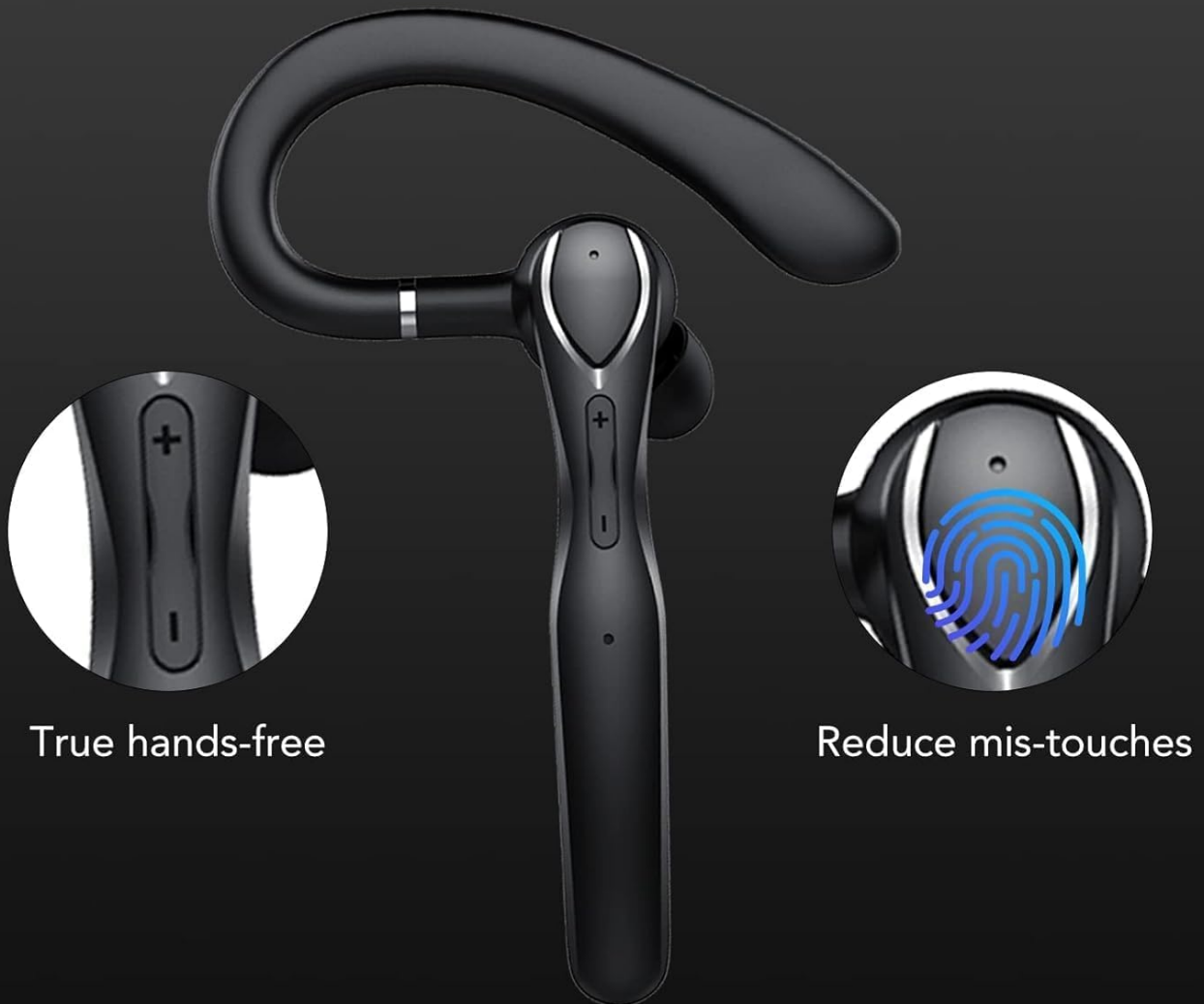
Image: A close-up of the FAMOO Bluetooth Headset highlighting the two physical control buttons (volume up/down) and the touch-sensitive area for other functions. This design aims to reduce accidental touches while providing easy access to controls.