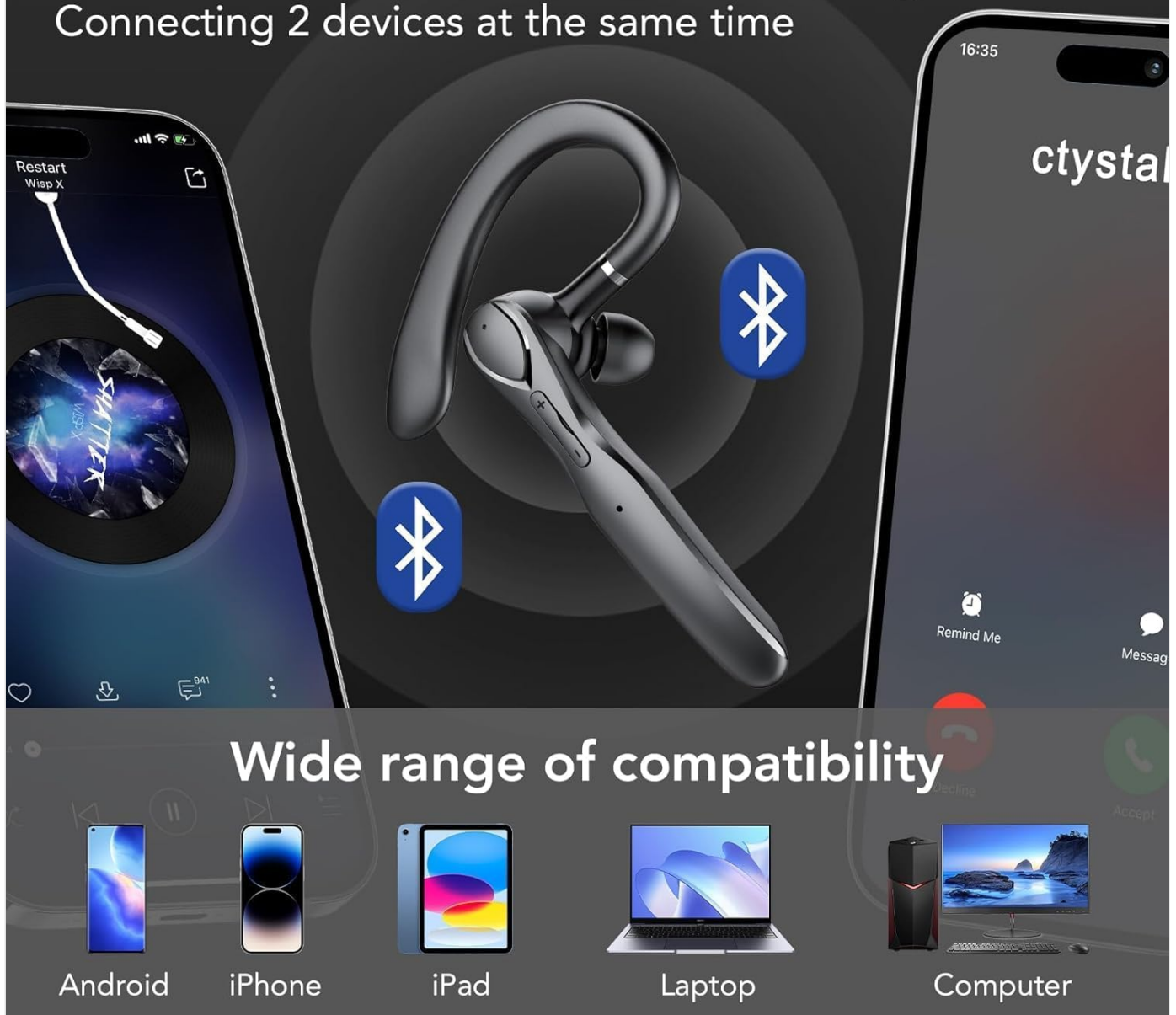
Image: The FAMOO Bluetooth Headset shown wirelessly connected to two different smartphones, demonstrating its dual device connectivity feature. This allows for seamless switching between devices like Android phones, iPhones, iPads, laptops, and desktop computers.