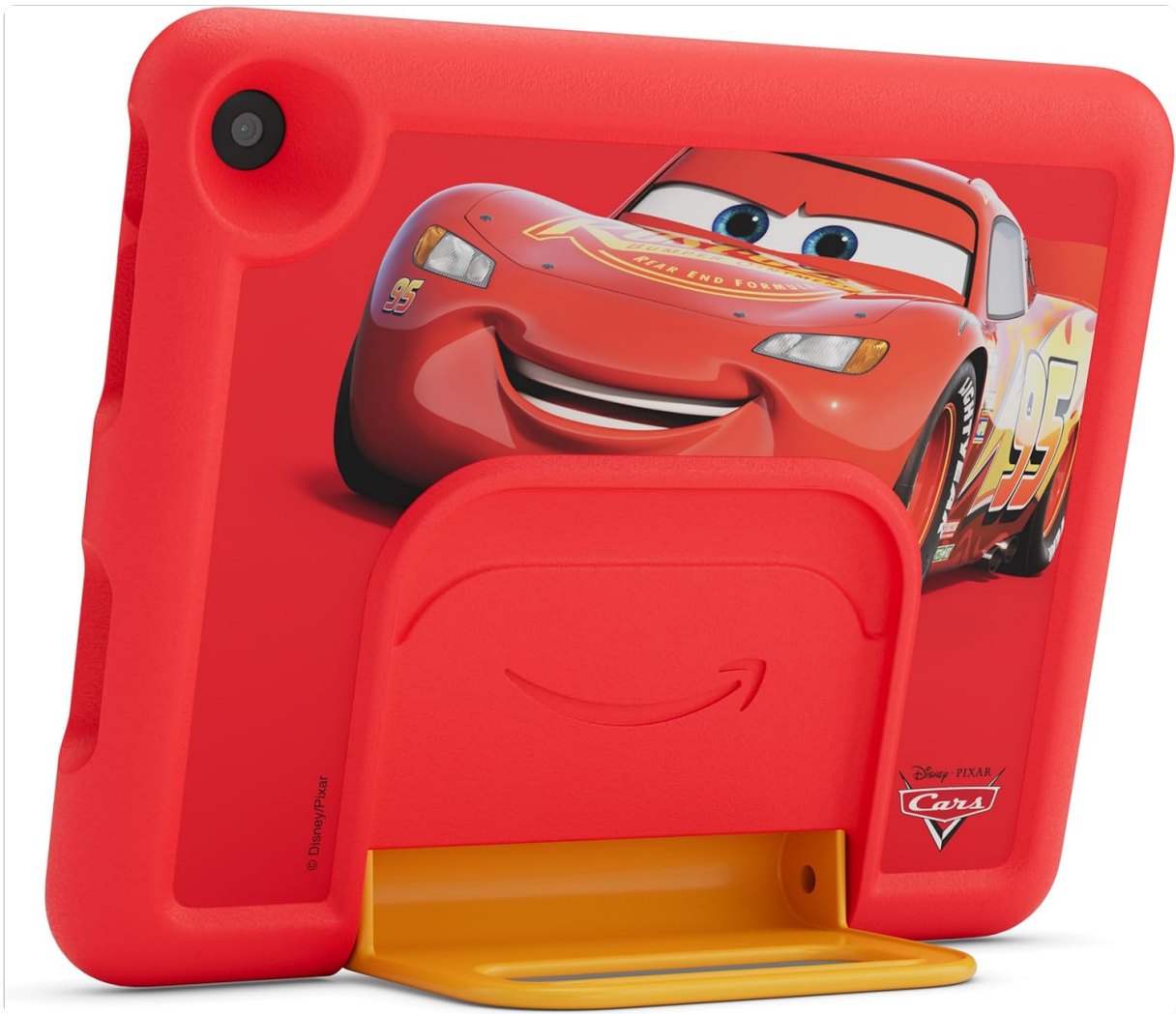
Rear view of the Amazon Fire HD 8 Kids tablet in its Disney Pixar Cars themed Kid-Proof Case, showing the integrated stand.