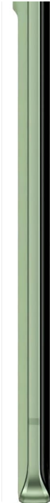
Figure 2.7: Left side of the Motorola Edge 40 5G, showing a clean, uninterrupted edge.