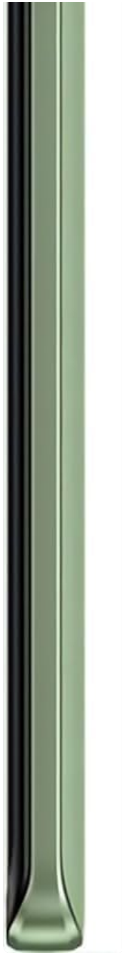
Figure 2.6: Right side of the Motorola Edge 40 5G, displaying the power button and volume rocker.