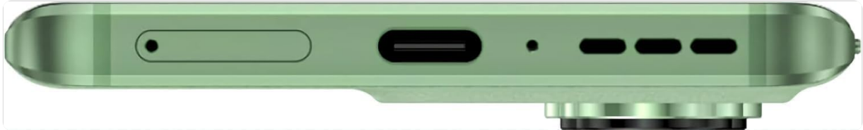
Figure 2.4: Bottom edge of the Motorola Edge 40 5G, featuring the USB-C charging port, speaker grille, and primary microphone.