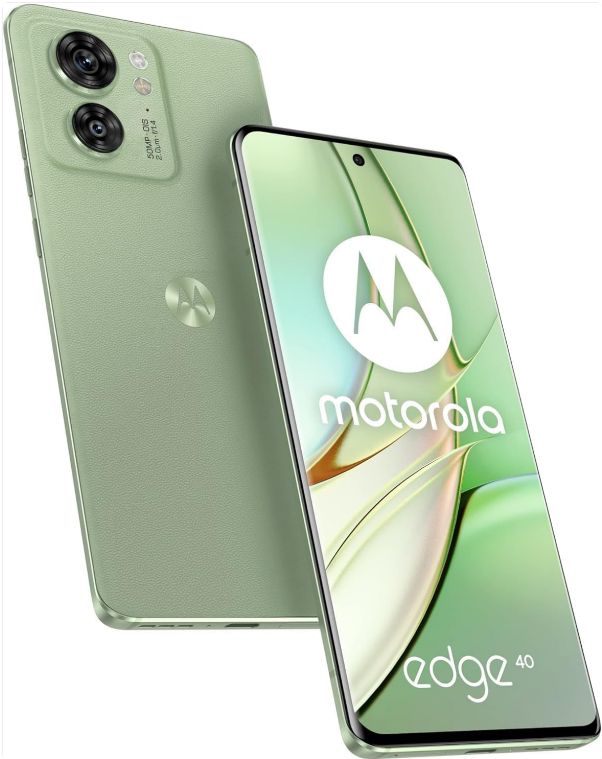
Figure 2.1: Front and back view of the Motorola Edge 40 5G smartphone, showcasing its olive green finish and camera module.