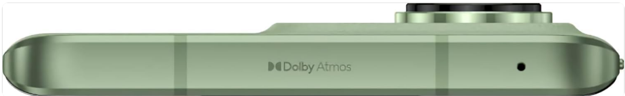
Figure 2.5: Top edge of the Motorola Edge 40 5G, showing the secondary microphone and Dolby Atmos branding.