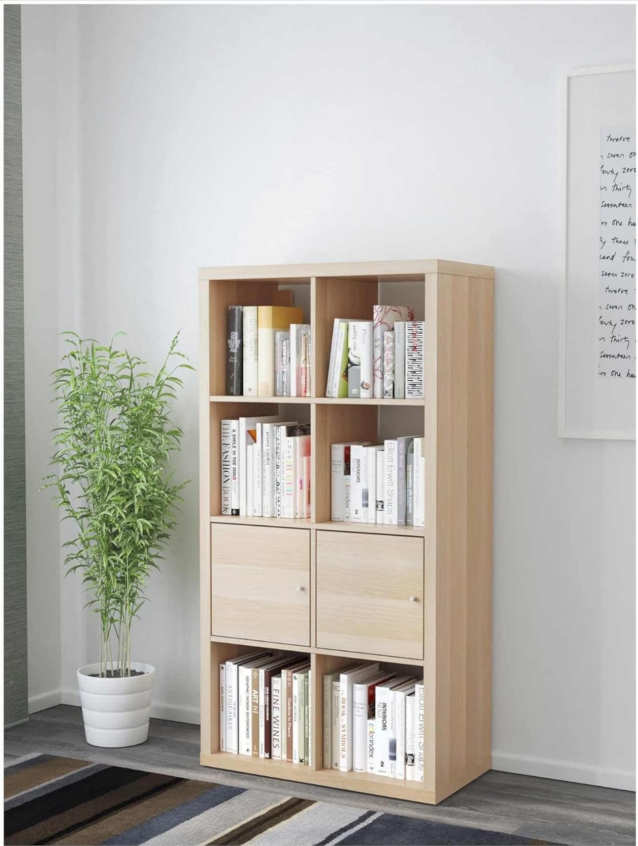
Figure 5.1: KALLAX unit in a typical home setting, showcasing its functional use.