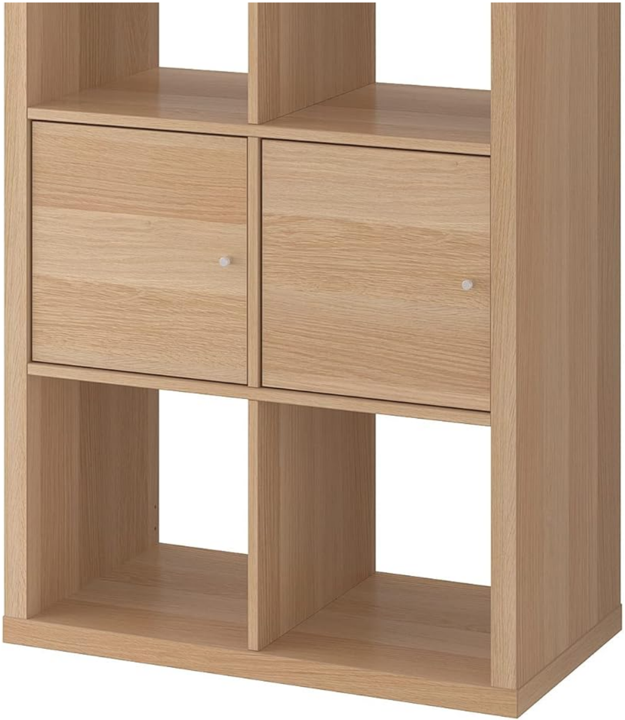
Figure 4.1: Assembled KALLAX shelving unit with doors.