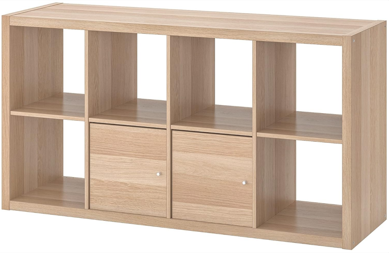
Figure 5.2: KALLAX unit configured horizontally, suitable for different room layouts.