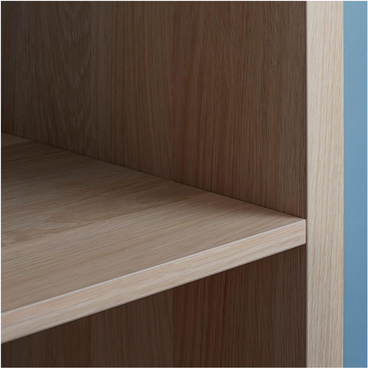
Figure 6.1: Detail of the shelf surface, highlighting the finish.