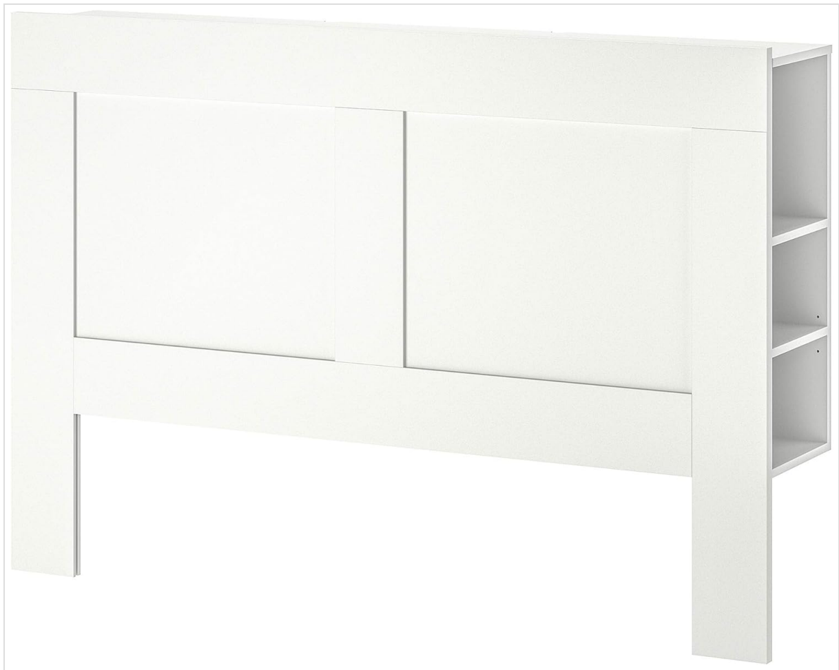
Image 2.1: Front view of the Generic BRIMNES Headboard with Storage in white.