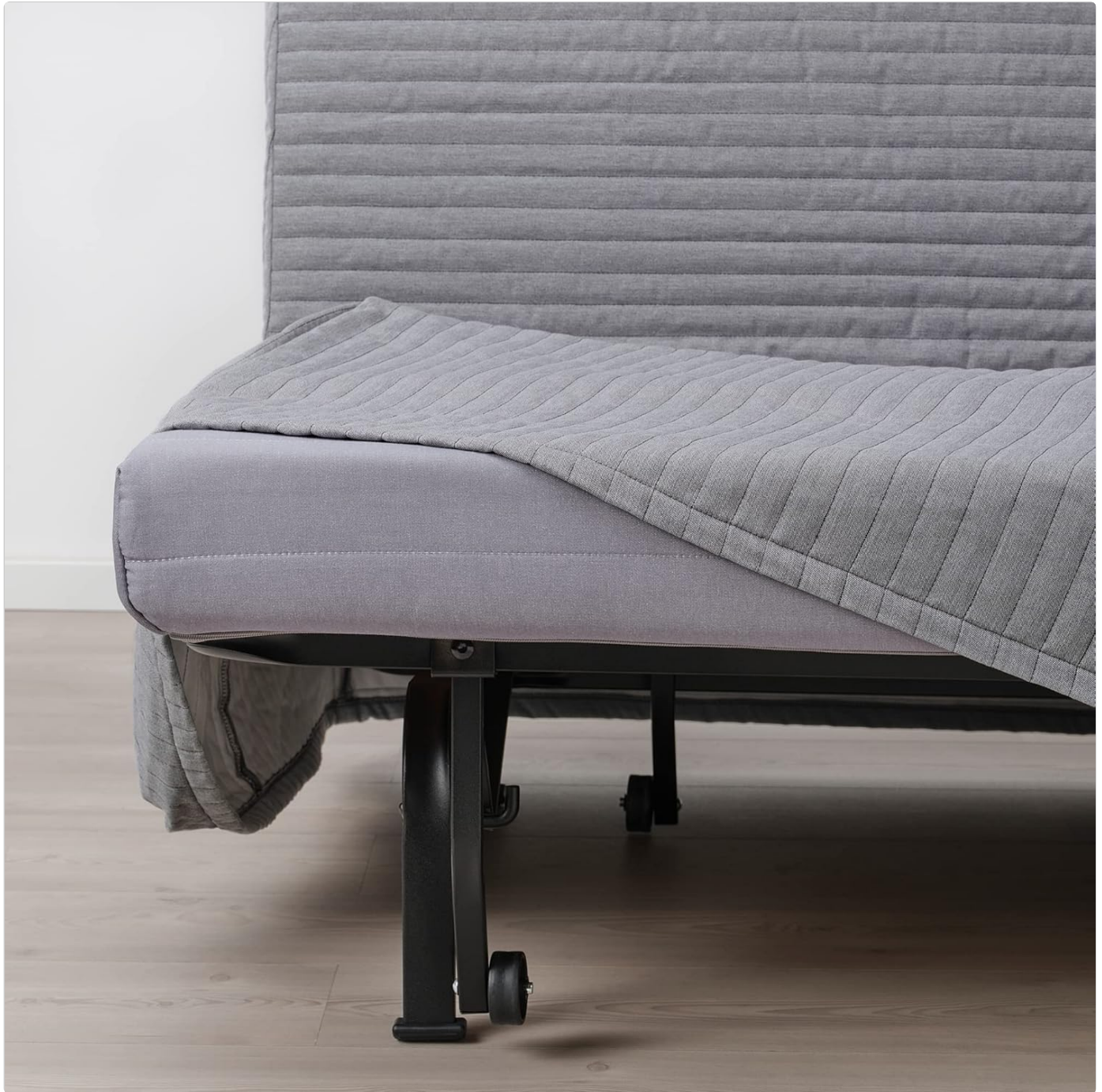
Image 2.1: Detail of the sofa-bed's internal metal frame and mattress support system, showing the wheels for conversion.