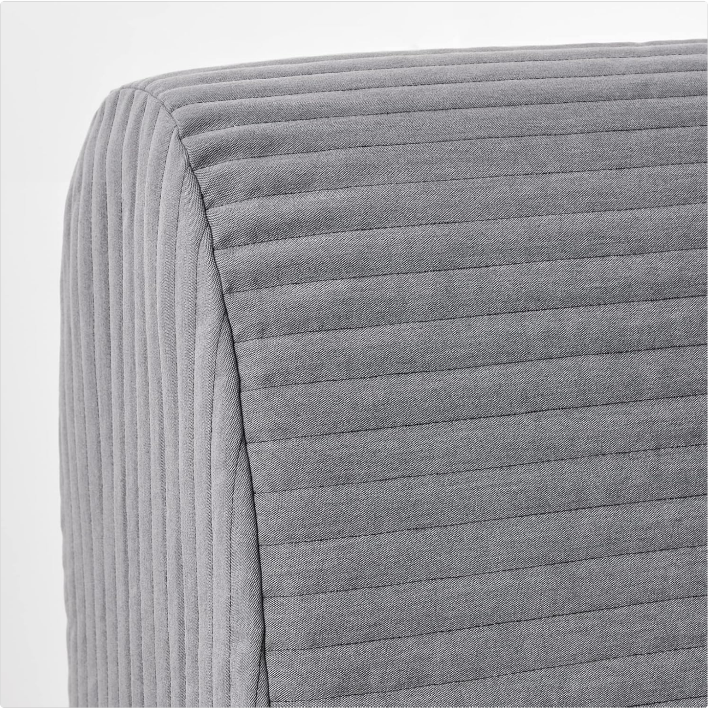
Image 4.1: A detailed view of the light grey quilted fabric, highlighting its texture and stitching.