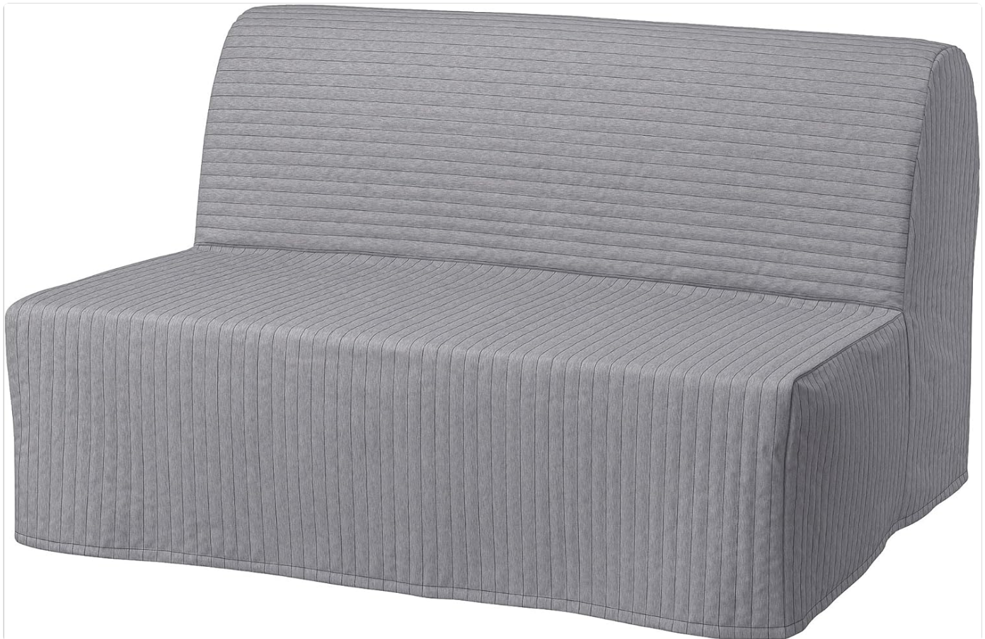
Image 1.1: The LYCKSELE MURBO sofa-bed in its standard sofa configuration, featuring a light grey fabric cover.

The LYCKSELE MURBO is a versatile 2-seat sofa that readily converts into a comfortable bed, designed for efficient use of space. Its robust construction and thoughtful design make it suitable for various living environments.