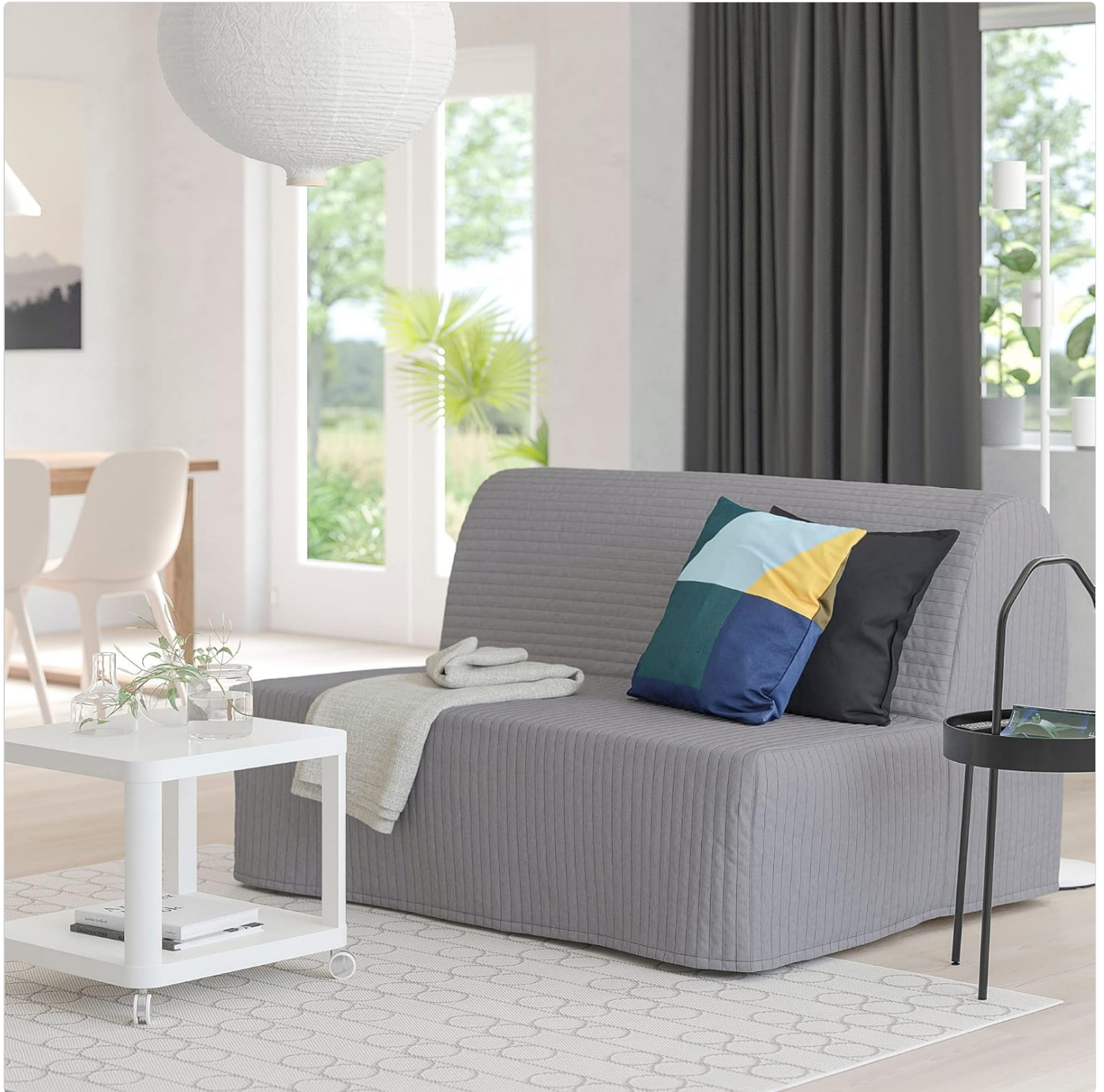
Image 3.1: The LYCKSELE MURBO sofa-bed integrated into a modern living room, showcasing its compact design.