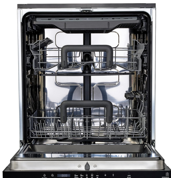
Figure 3.2: Detailed interior view of the dishwasher, showcasing the upper and lower racks, spray arms, and detergent dispenser.