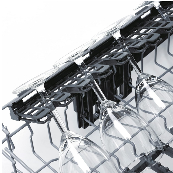
Figure 5.3: Specialized holders for wine glasses, ensuring delicate stemware is held securely during the wash cycle.