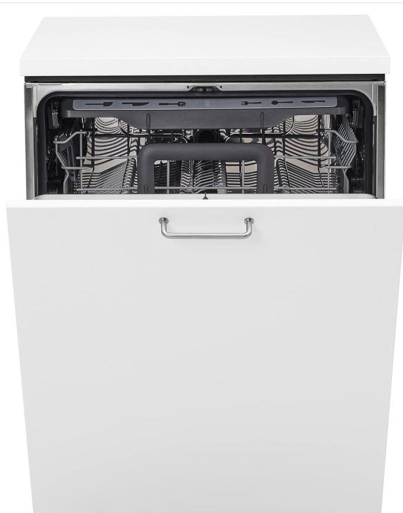
Figure 3.1: Front view of the HYGIENISK integrated dishwasher with the door slightly ajar, revealing the interior racks.