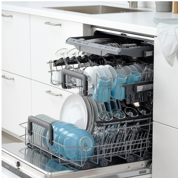
Figure 5.1: Example of a properly loaded dishwasher, showing plates, bowls, and glasses arranged for effective cleaning.