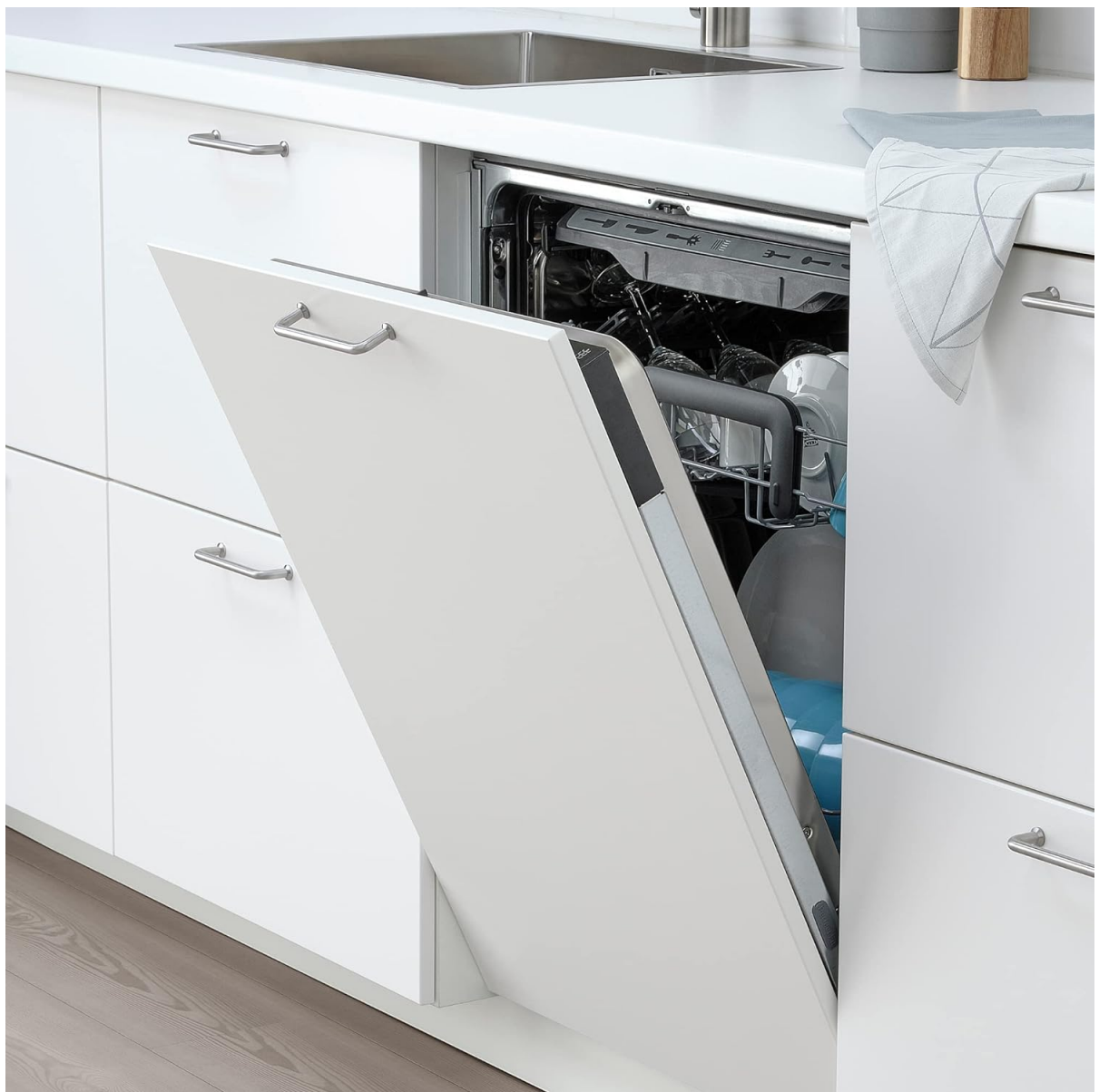
Figure 4.1: The HYGIENISK dishwasher seamlessly integrated into a standard kitchen cabinet, demonstrating its flush fit and design.

Ensure adequate space and access to water supply, drainage, and electrical outlets.