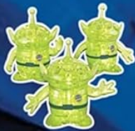
TOY STORY ALIENS