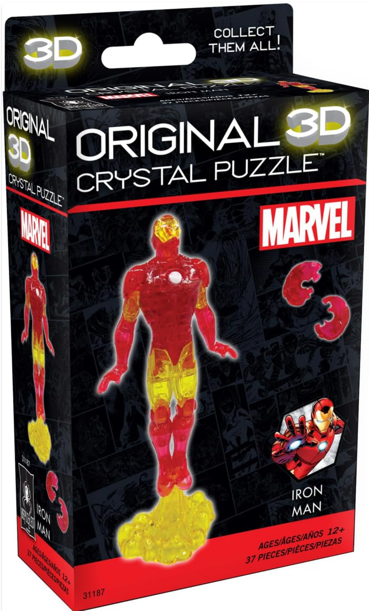
Image: The front of the BePuzzled Marvel Iron Man 3D Crystal Puzzle box, showing the Iron Man figure and piece count.