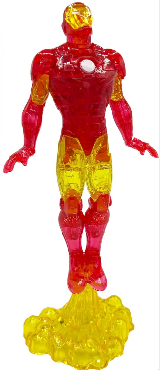
Image: The product box alongside the fully assembled translucent red and yellow Iron Man 3D crystal puzzle.