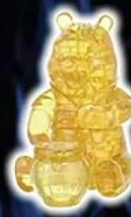
WINNIE THE POOH