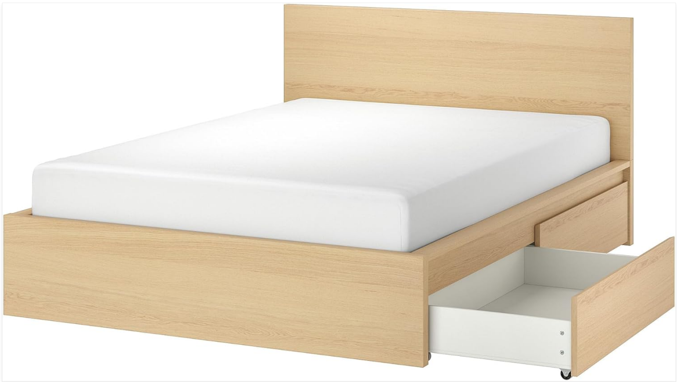
Figure 1.2: The MALM bed frame highlighting the integrated storage drawer.