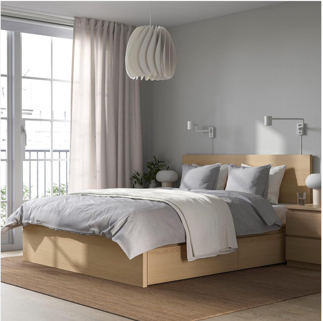
Figure 1.1: The MALM bed frame with storage, shown in a complete bedroom setup.