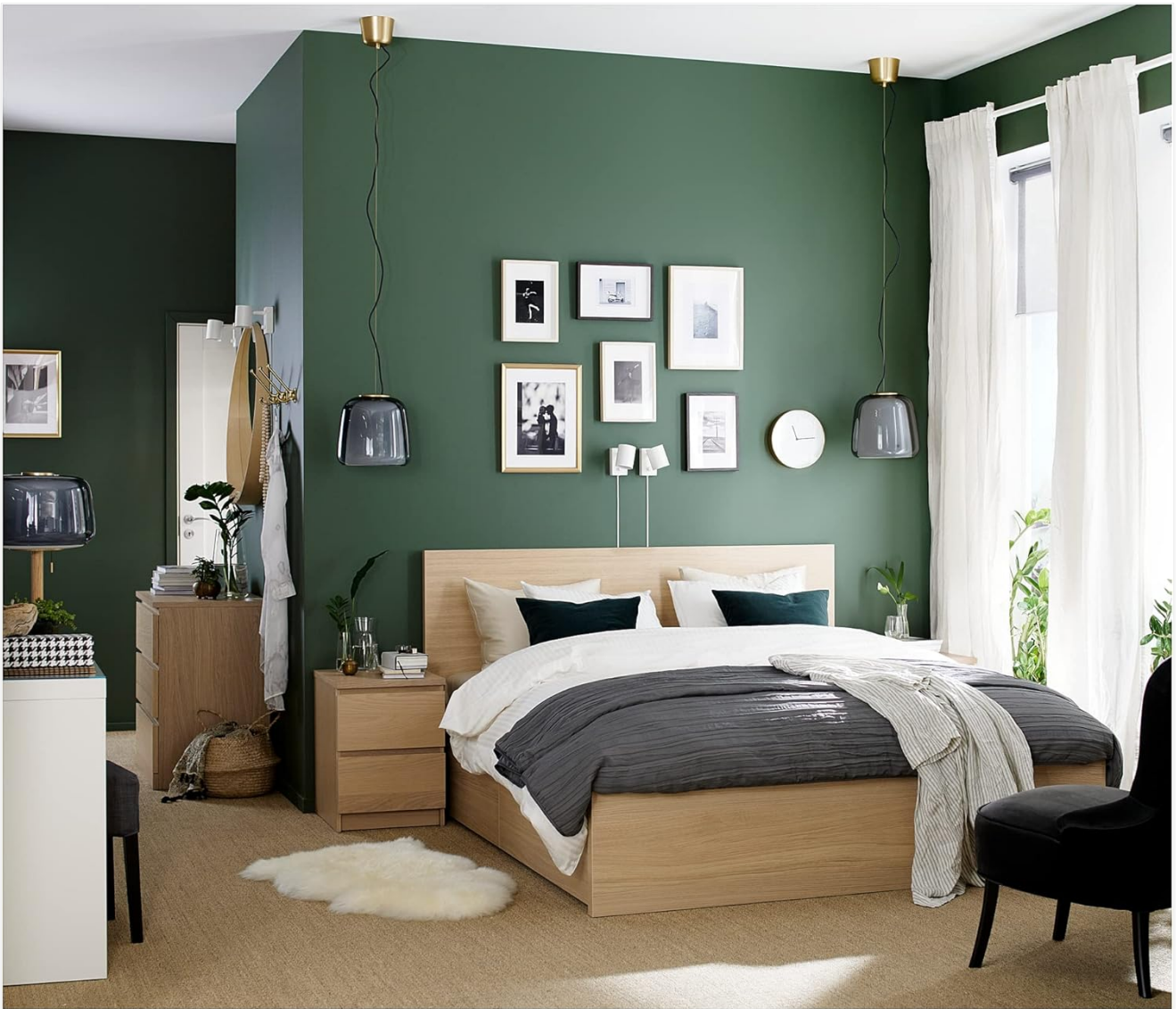
Figure 4.1: The assembled MALM bed frame, ready for use.