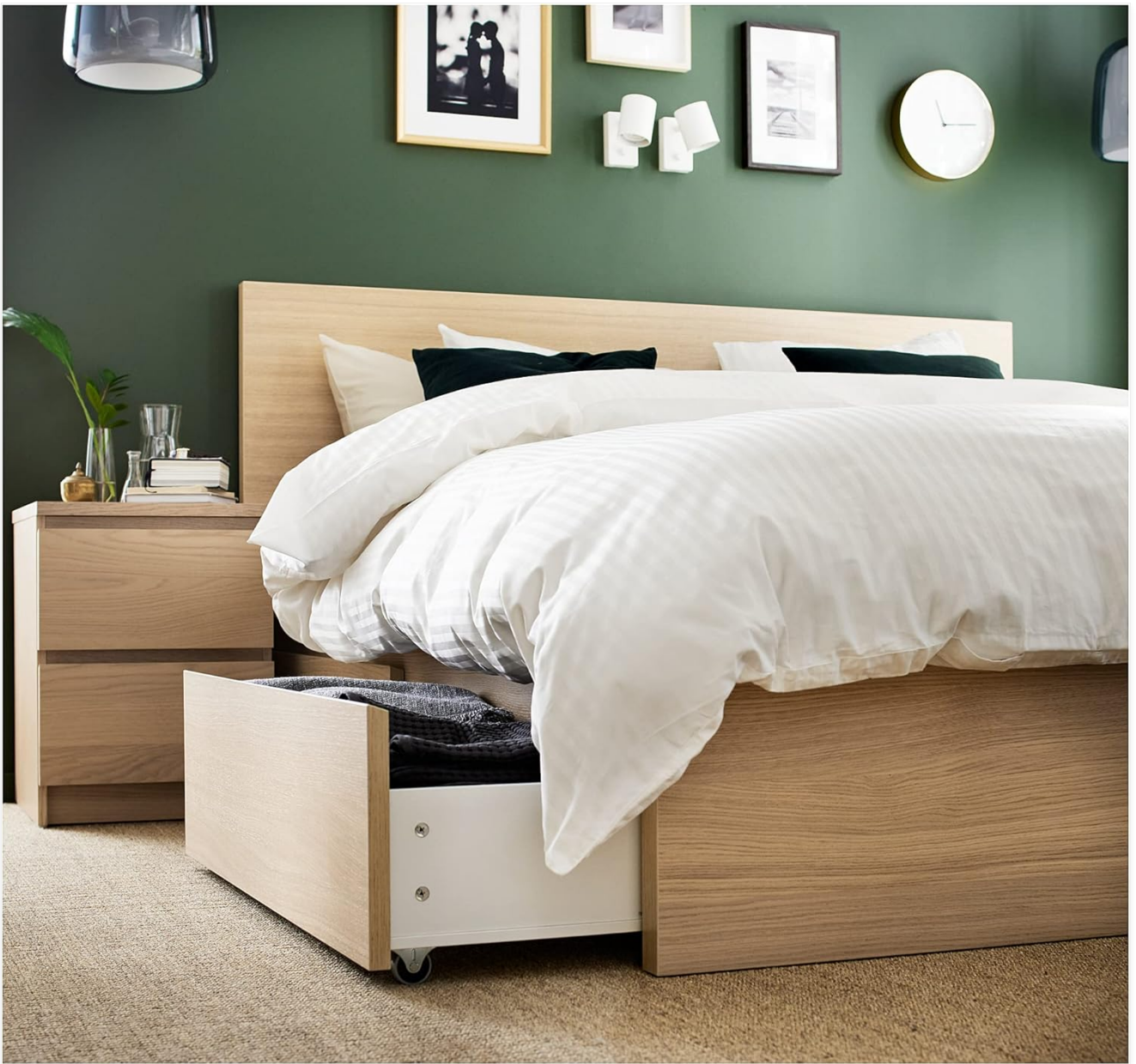
Figure 5.1: An open storage drawer, demonstrating its capacity for bedding or clothing.