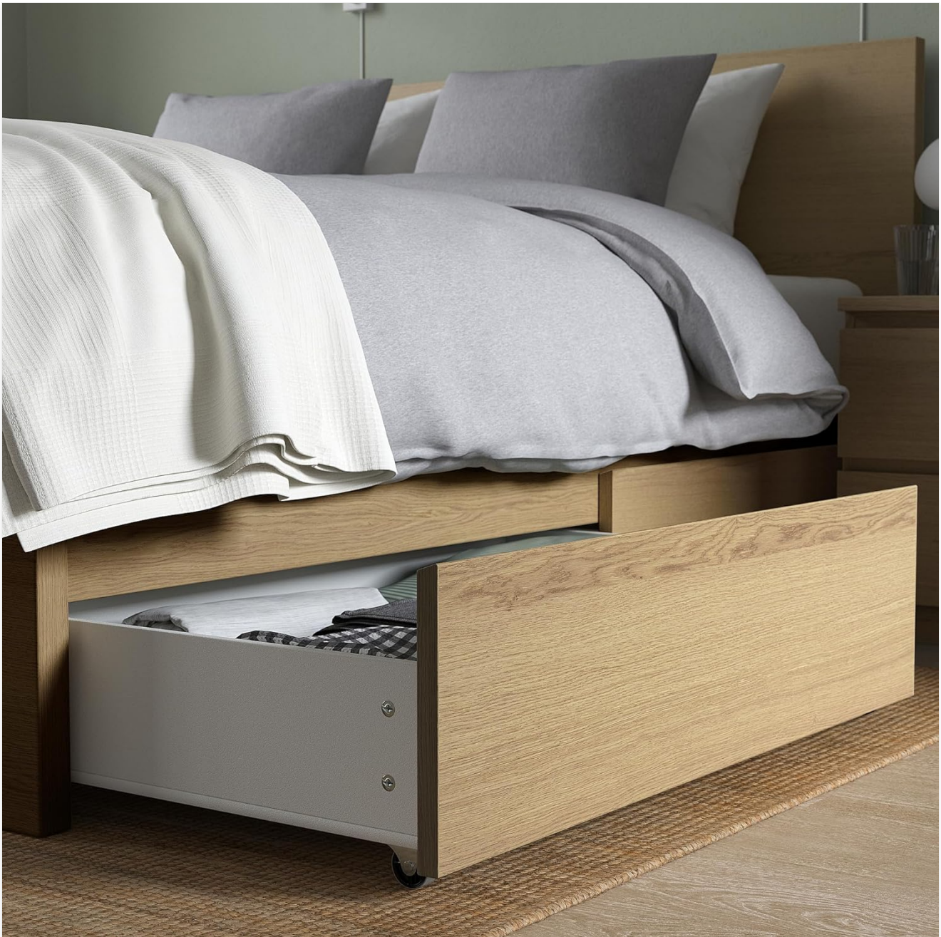
Figure 5.2: A detailed view of the storage drawer, highlighting its functionality.