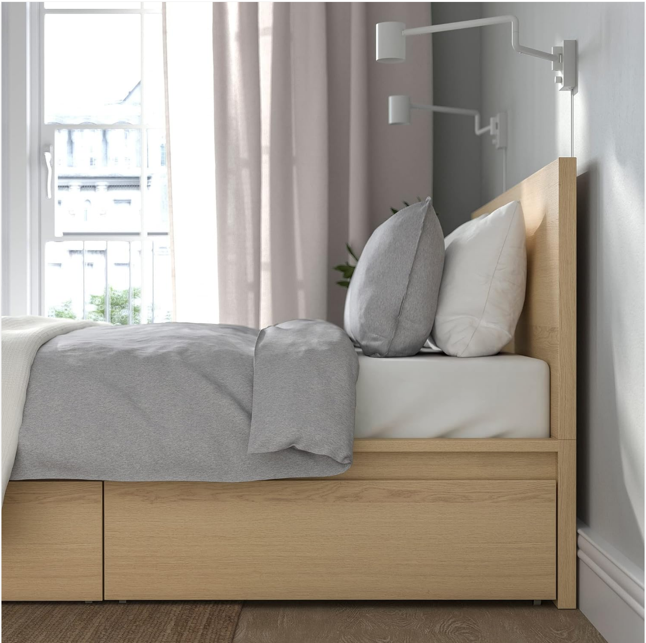
Figure 8.1: Side profile of the MALM bed frame, illustrating its dimensions.