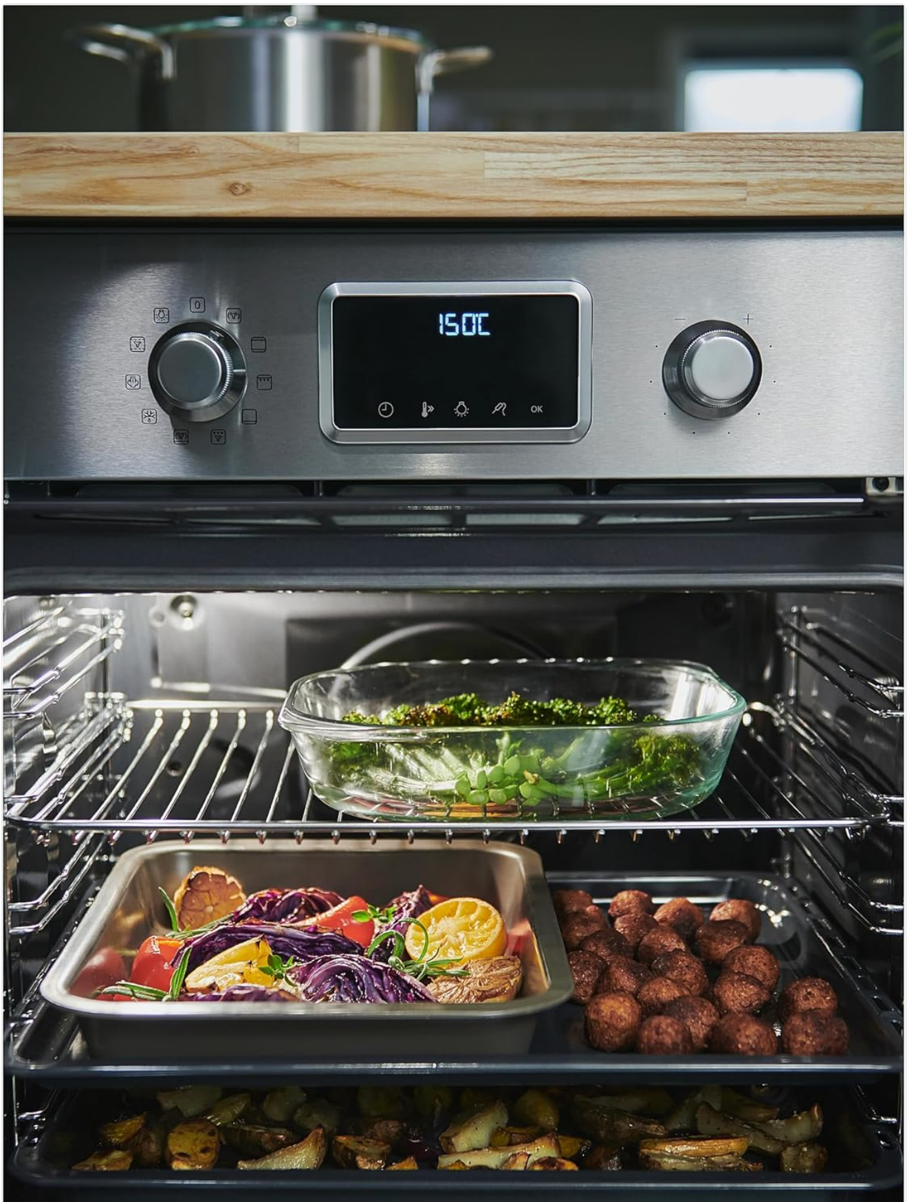
The spacious interior of the FORNEBY oven, showing multiple dishes cooking simultaneously on different racks.