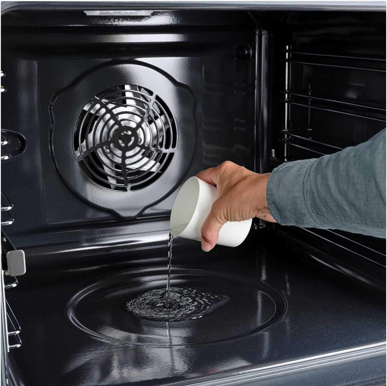
A close-up view of the oven interior, showing the fan and the base, ready for cleaning or water addition.