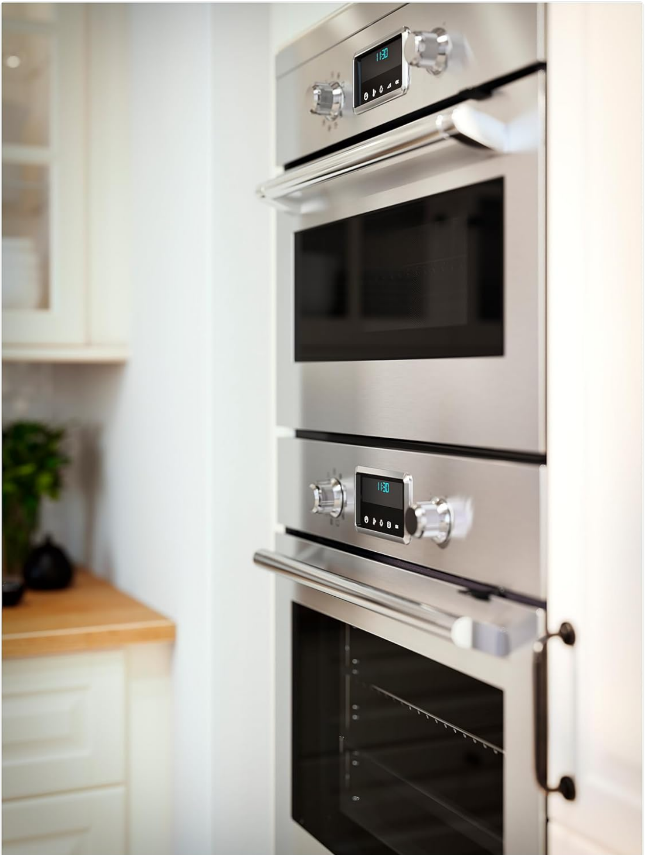
The FORNEBY oven seamlessly integrated into a modern kitchen cabinet, demonstrating its built-in design.