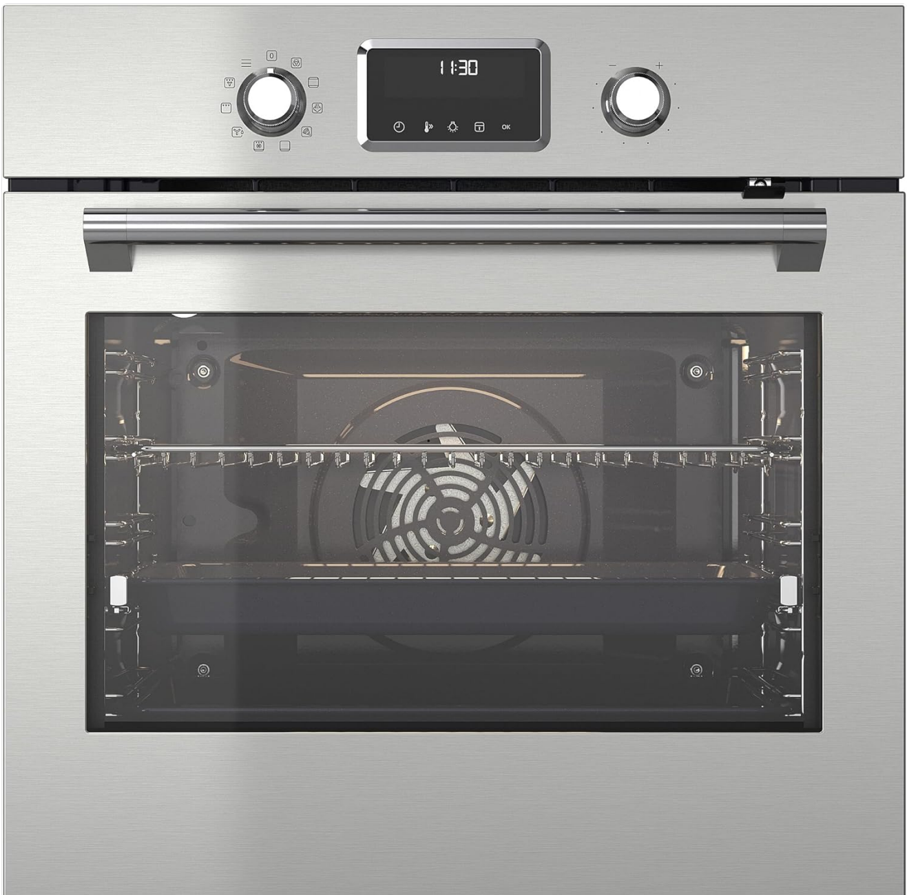
Front view of the FORNEBY Forced Air Oven, showcasing its stainless steel finish and digital display.