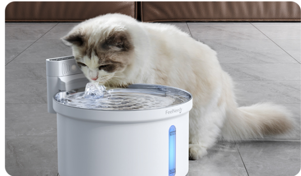
Fountain water flow

Image: Step-by-step visual guide for assembling the FEELNEEDY Wireless Cat Water Fountain.