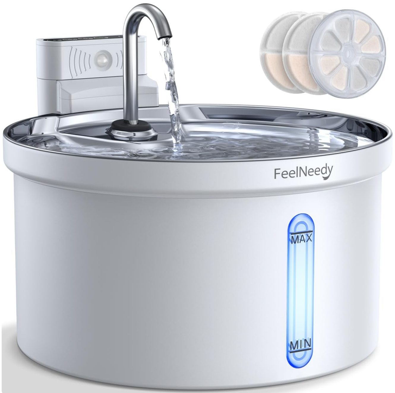
Image: The FEELNEEDY Wireless Cat Water Fountain, showcasing its sleek design and included filters.