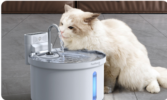
Faucet water flow