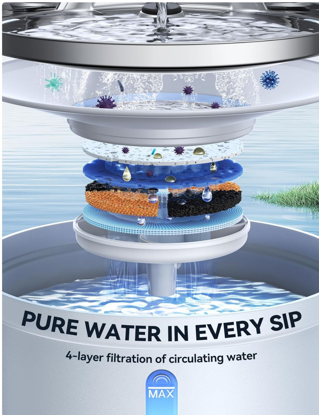
Image: Detailed view of the 4-layer filtration system, illustrating how water is purified for your pet.