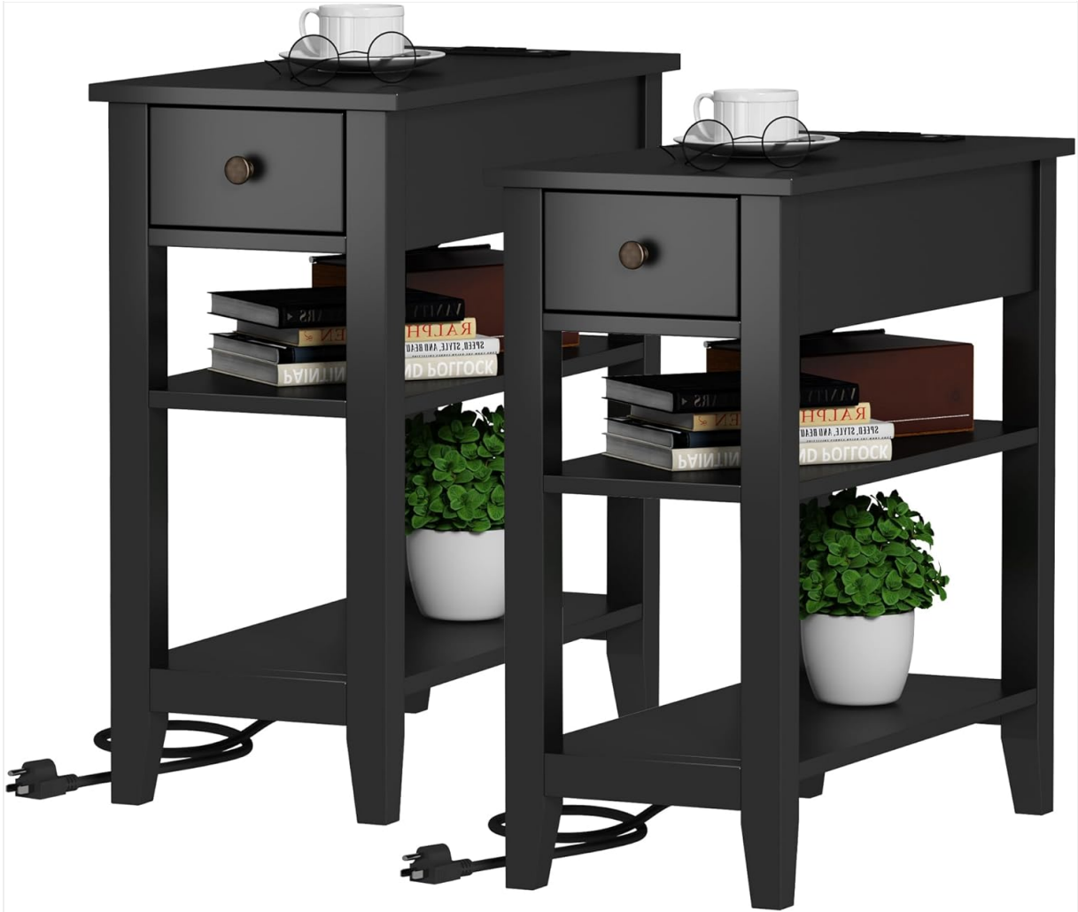
Image: Two ChooChoo Black End Tables, fully assembled and ready for use.