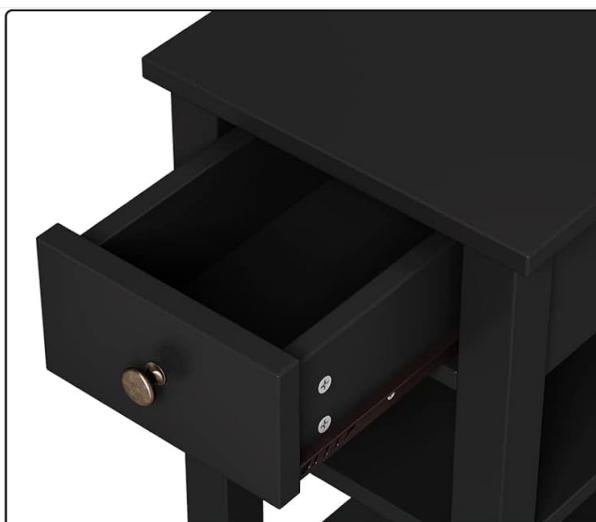
Storage Space Drawer