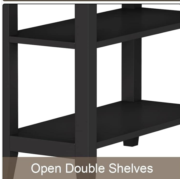
Open Double Shelves