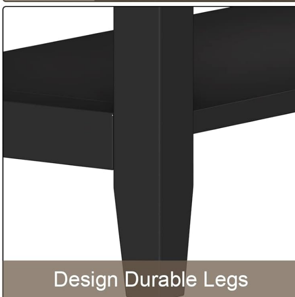
Design Durable Legs

Image: Detailed view of the end table's features, including the charging station, drawer, and shelves.