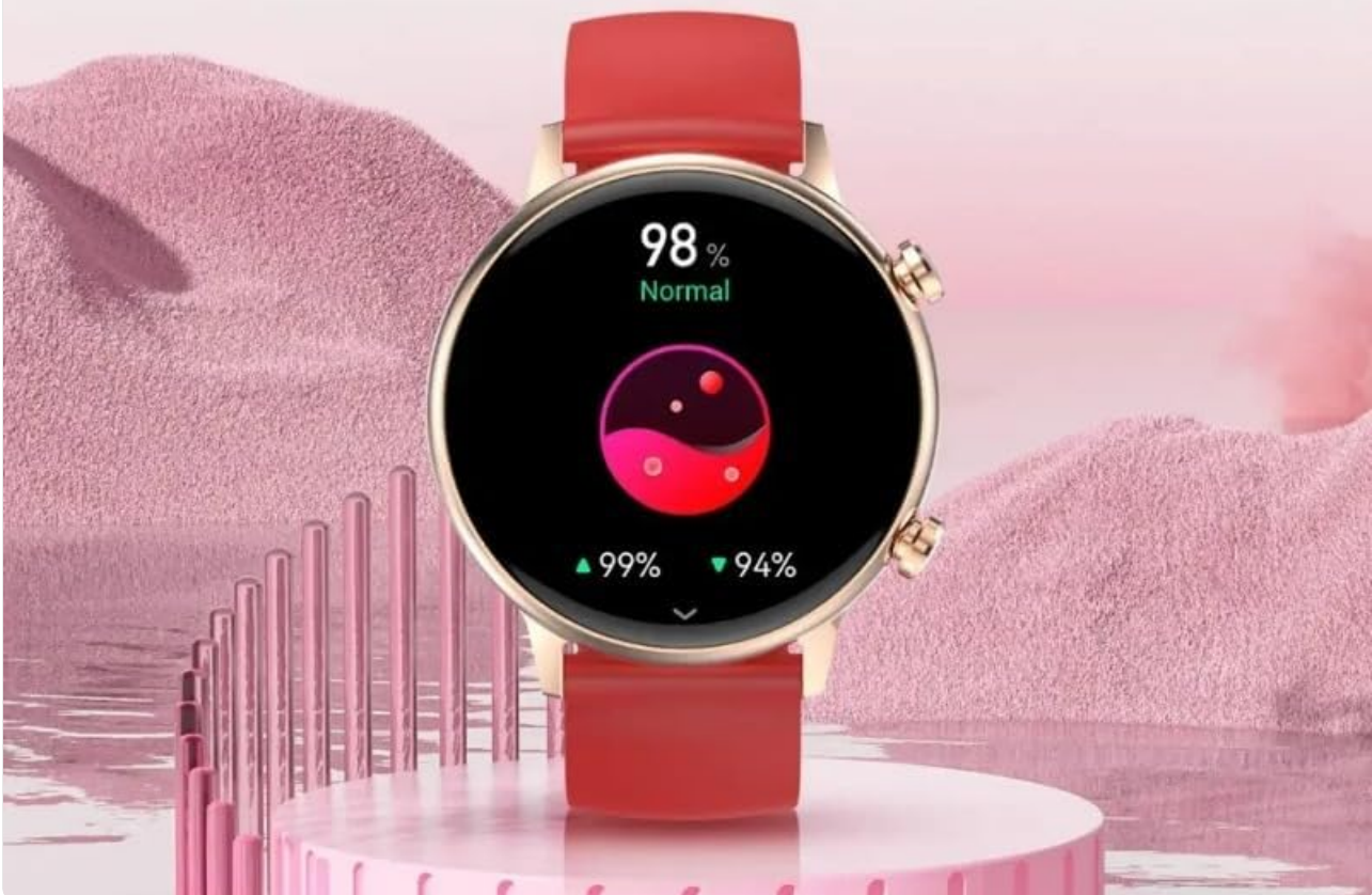
Figure 5.1: Blood oxygen saturation (SpO 2 ) monitoring feature on the smartwatch.

Blood oxygen Saturation (SpO 2 ), the Smart watch automatically provides 24-hour blood oxygen level testing, whether at work, exercise or sleep. Protect your health 24/7.