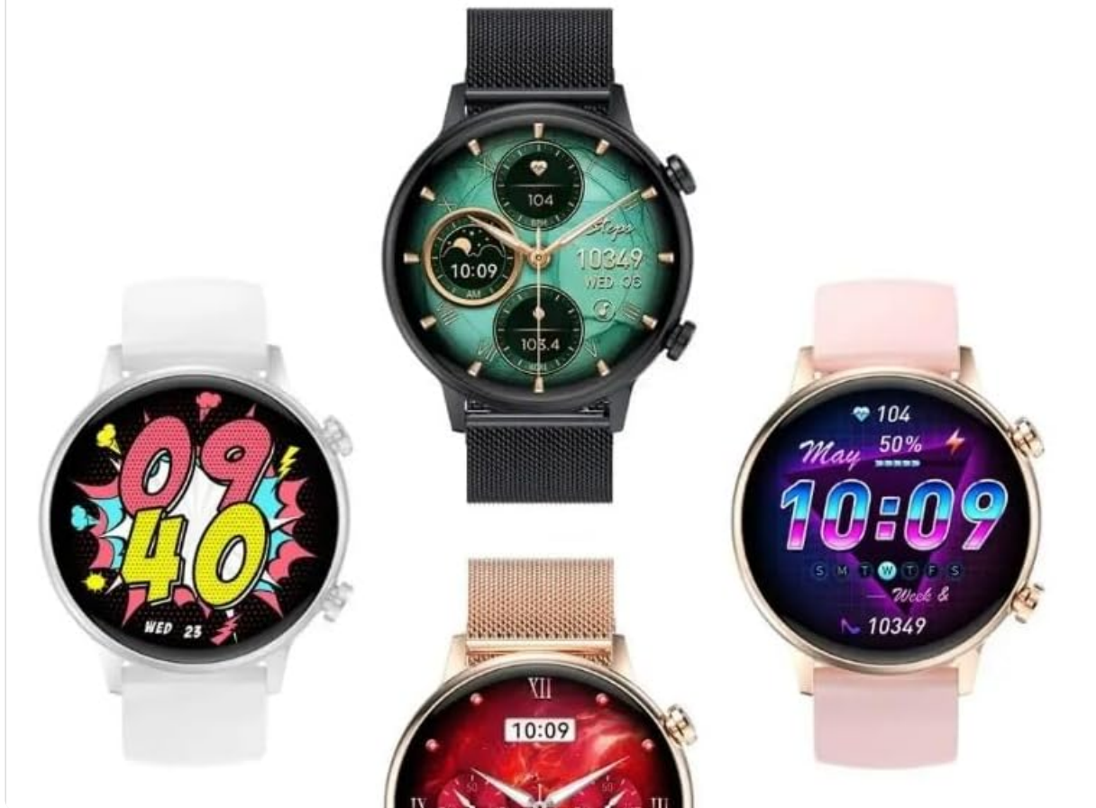
Figure 4.1: Examples of customizable watch faces available for the HK39 Smartwatch.

Built-in digital dial and other different styles of dial, you can switch freely. In addition, the dial market there are 100+ exquisite dial, a variety of options to meet your varied style