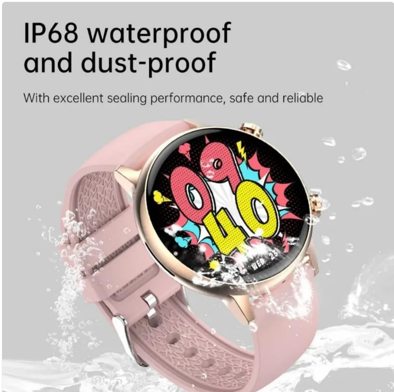
Figure 7.1: The smartwatch demonstrating its IP68 waterproof and dust-proof capabilities.

The HK39 Smartwatch is rated IP68 waterproof and dust-proof . This means it is resistant to dust ingress and can withstand immersion in water up to 1.5 meters for 30 minutes. It is suitable for daily use, such as hand washing, rain, and shallow swimming. However, it is not recommended for hot showers, saunas, or diving, as steam and high water pressure may compromise the seal.