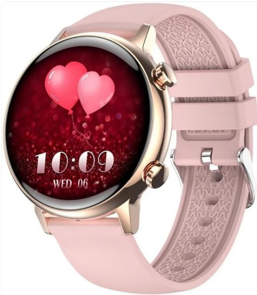
Figure 2.1: HK39 AMOLED Smartwatch, showcasing its elegant design and vibrant display.