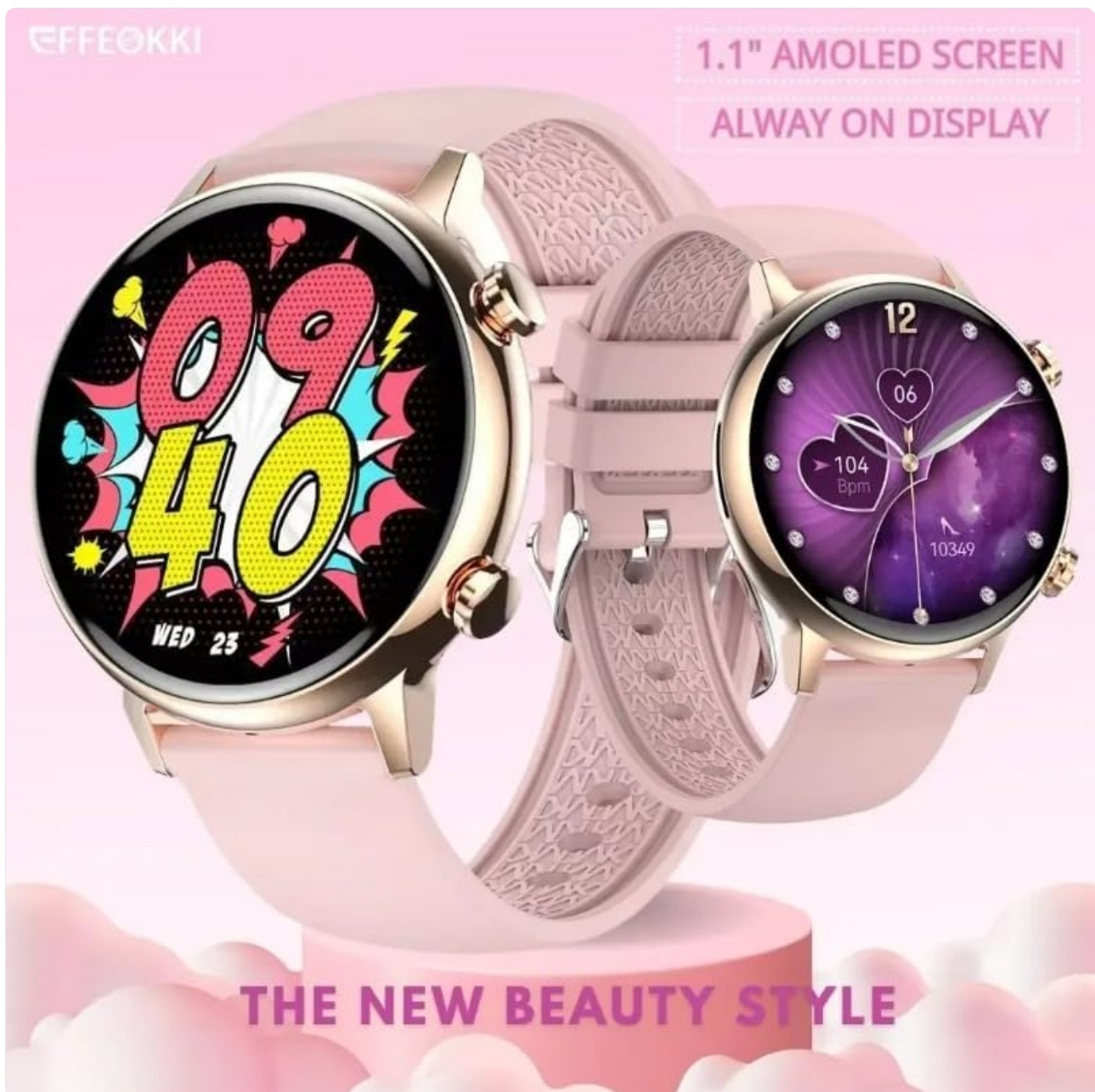
Figure 2.2: Close-up view of the 1.1-inch AMOLED screen, emphasizing its clarity and always-on display capability.