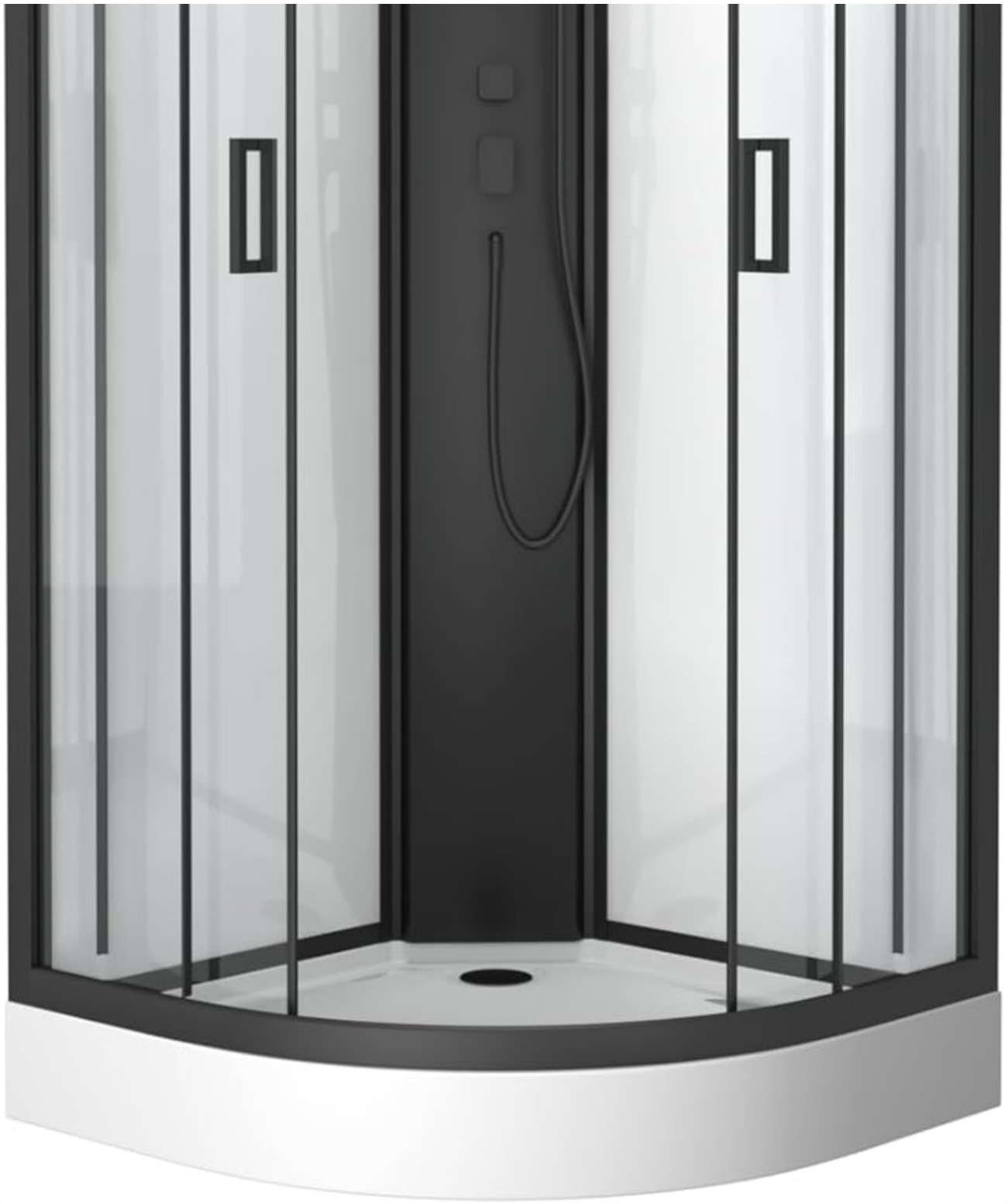
Figure 1: Front view of the Aurlane LIFT UP 3 shower cabin, showcasing its quarter-circle design, black profiles, and white base.