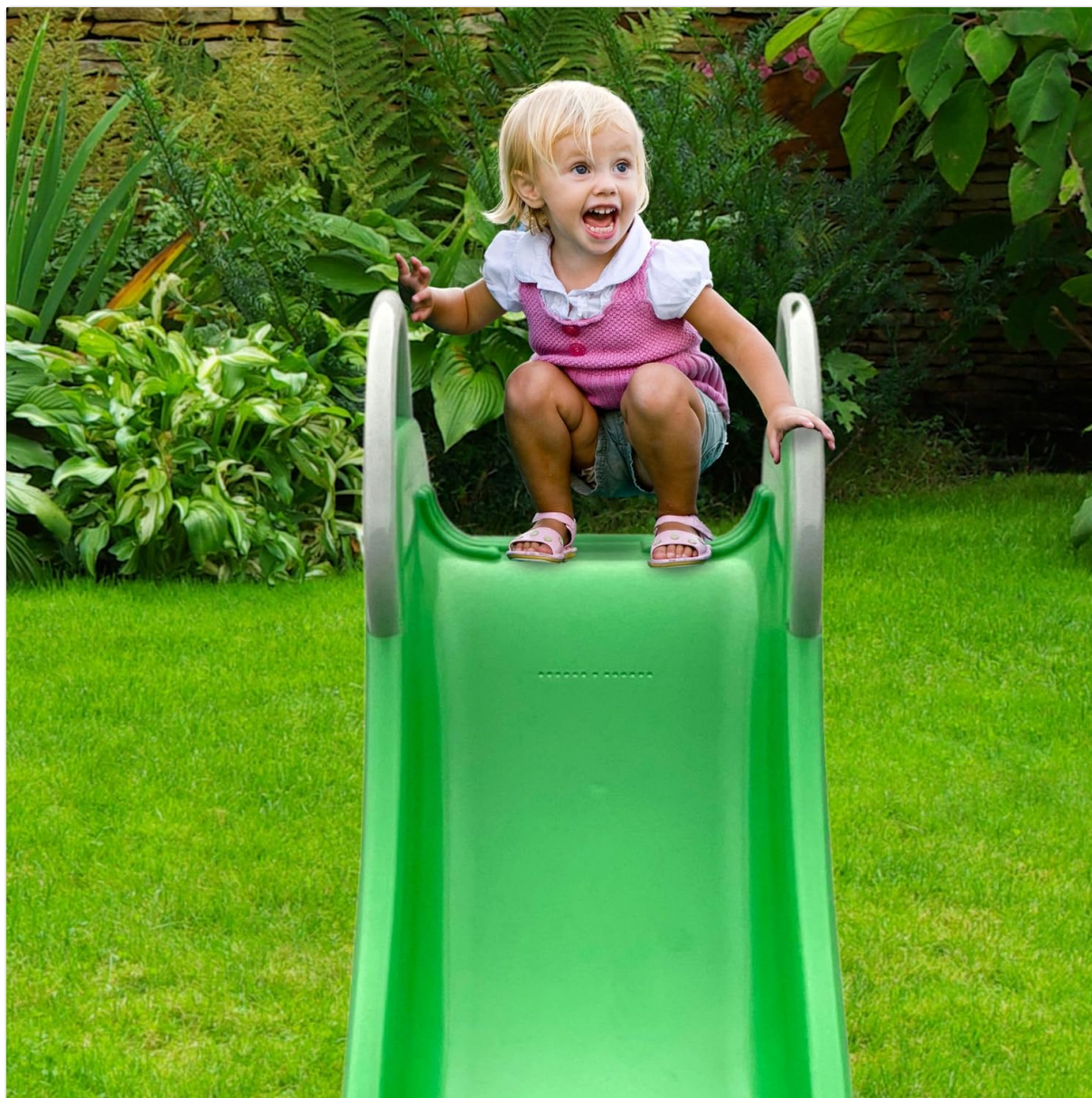
Figure 4: Child demonstrating proper use of the slide.