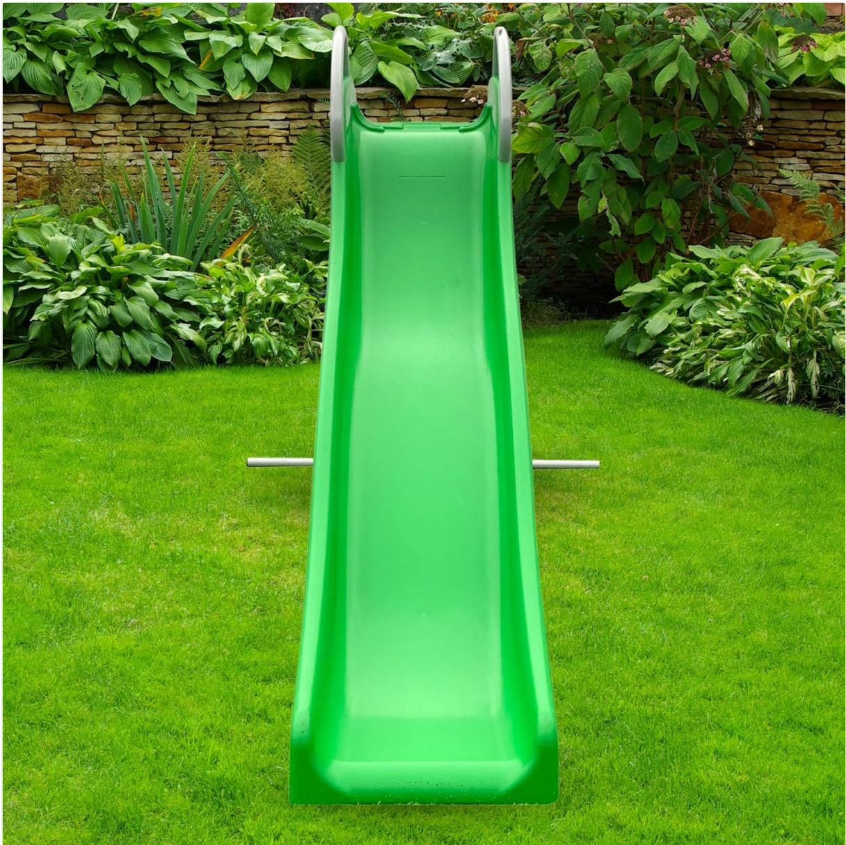
Figure 5: The slide positioned in a garden, ready for use.