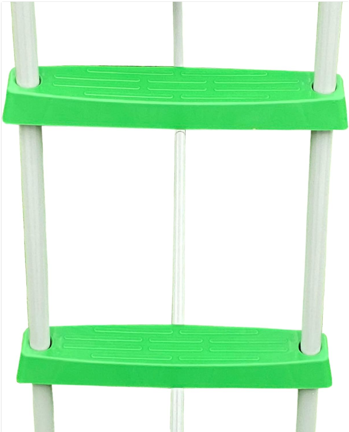
Figure 3: Detail of the ladder steps, designed for safe climbing.