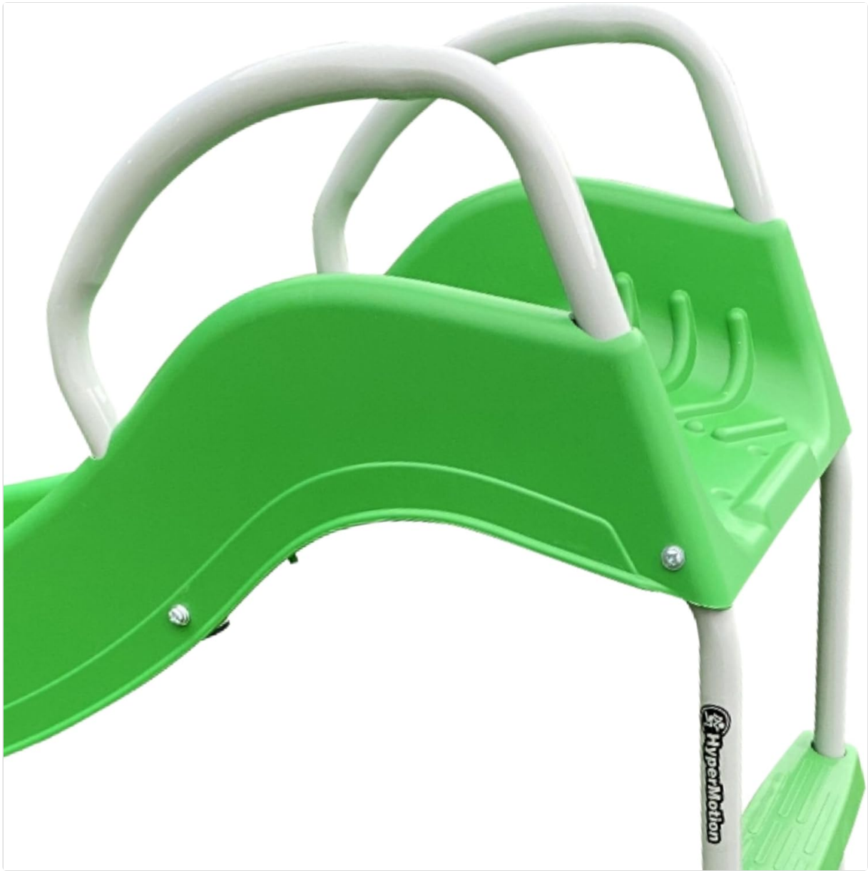
Figure 2: Detail of the slide's top section with secure handrails.