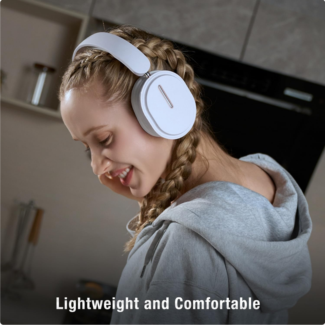
Figure 7: Lightweight and Comfortable Design.

The foldable design enhances portability, making them easy to store and carry.