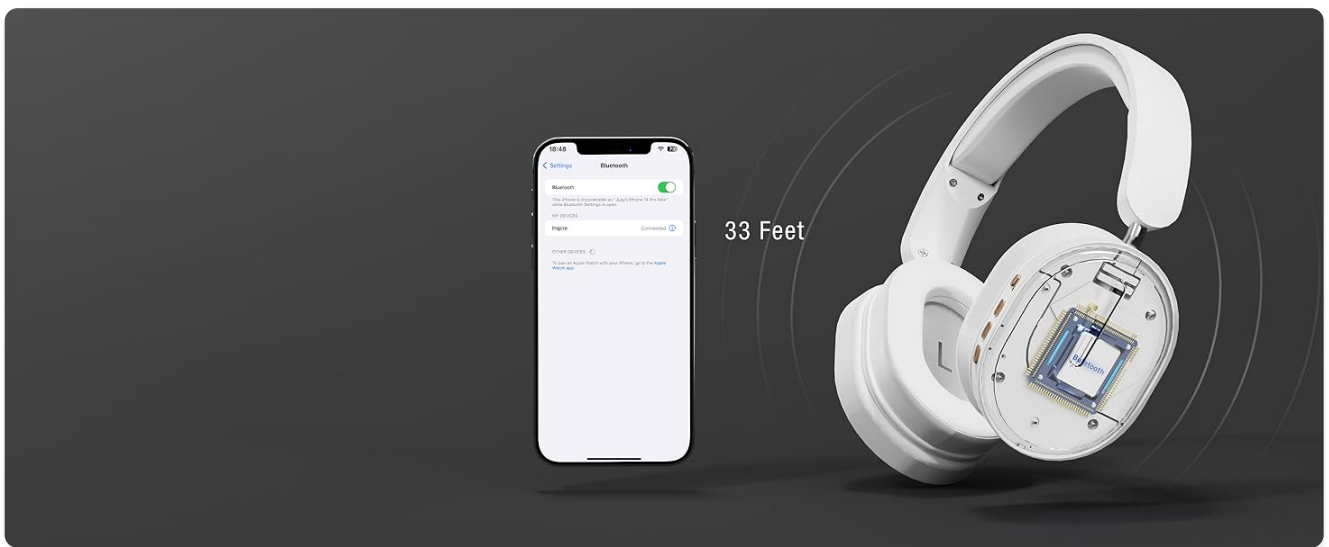
Figure 3: Bluetooth Pairing Process.

The headphones offer a reliable Bluetooth connection up to 33 feet, allowing freedom of movement while enjoying your audio.