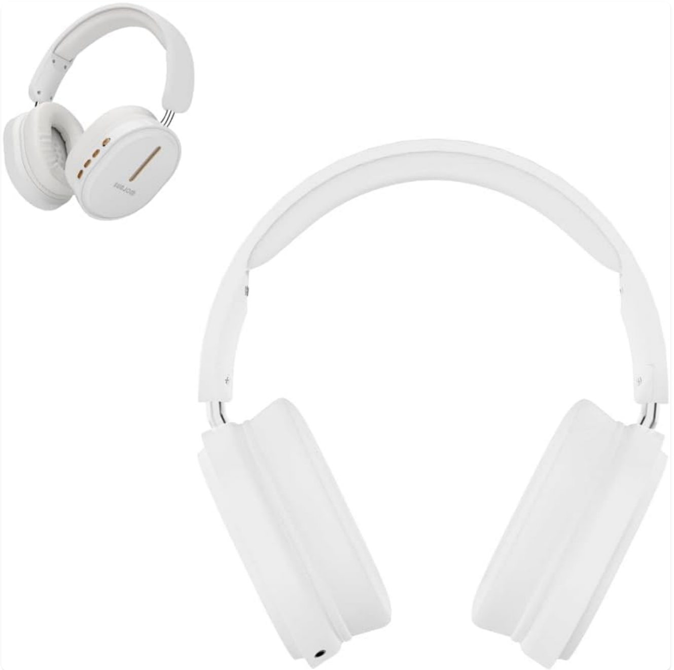
Figure 4: Wired Connection via 3.5mm AUX.

The 3.5mm audio cable provides a reliable wired connection, ensuring uninterrupted listening regardless of battery life.