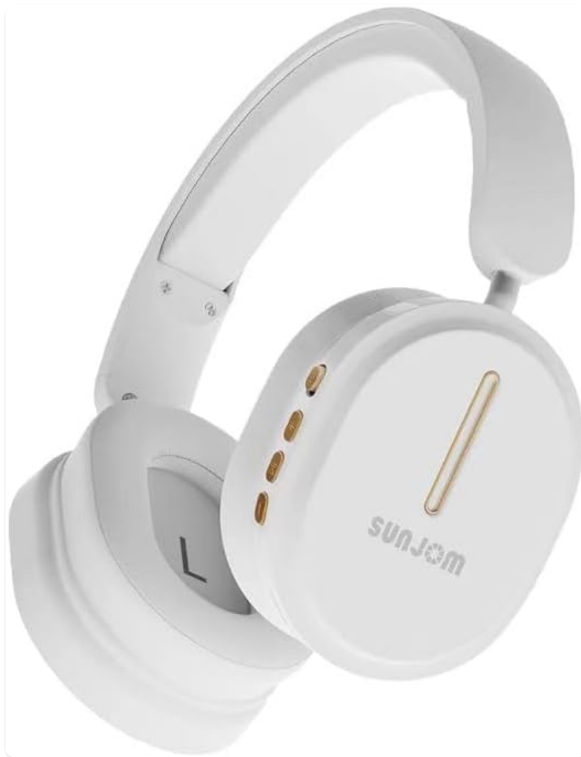
Figure 2: Charging the SUNJOM Inspire Headphones.

The headphones are equipped with a USB-C port for convenient charging. Ensure the cable is securely connected to both the headphones and a power source.