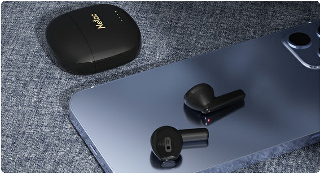
Image: Netac LK35 earbuds and their charging case placed next to a smartphone, illustrating the ease of Bluetooth connection.