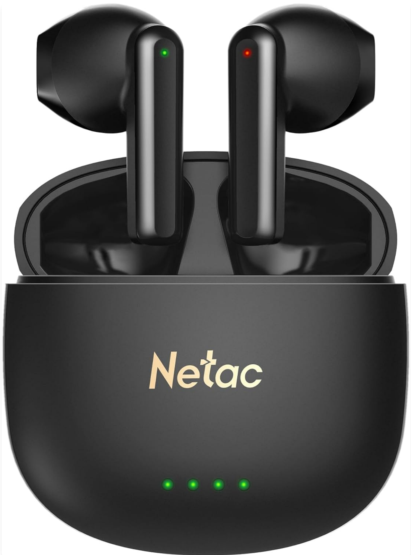
Image: Netac LK35 Wireless Bluetooth Headphones in their charging case, showcasing the sleek black design.