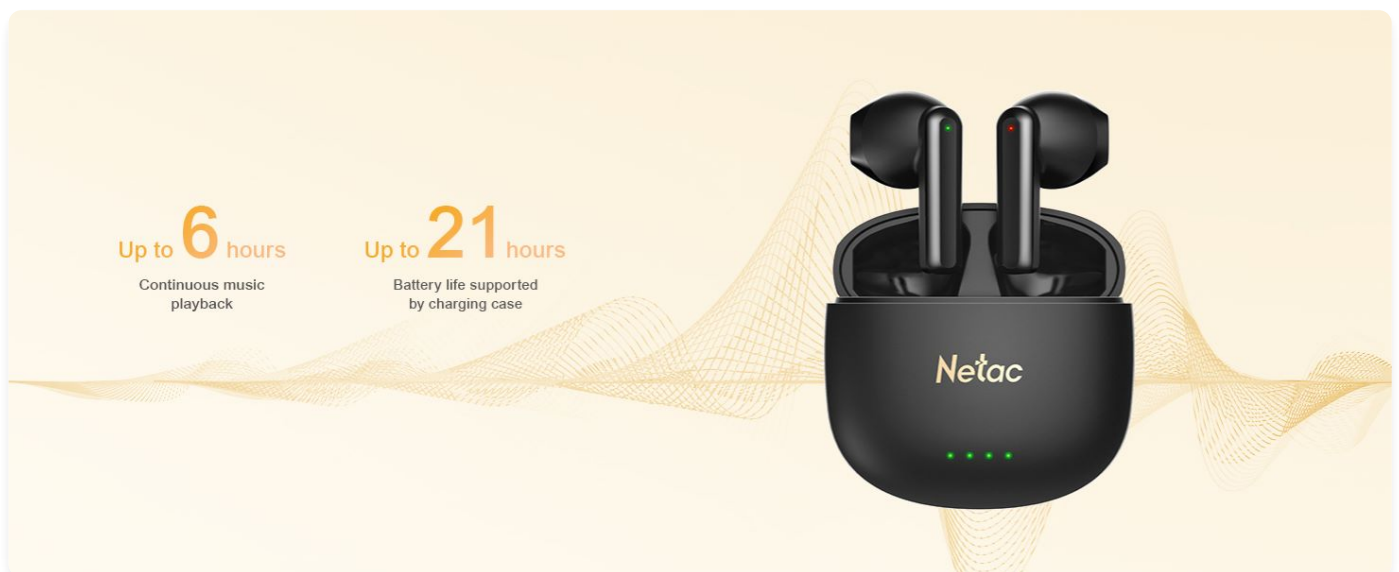
Image: Netac LK35 headphones in their charging case, illustrating the long battery life of up to 6 hours continuous music playback and 21 hours with the charging case.