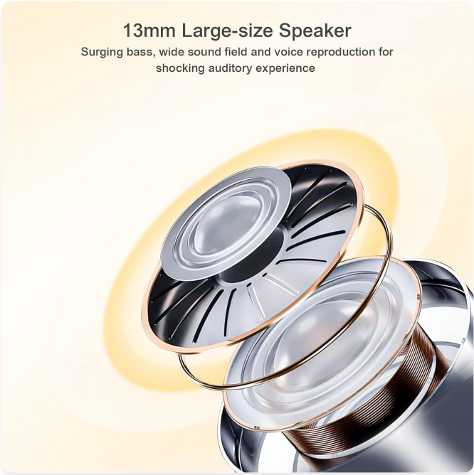
Image: Cross-section diagram of the 13mm large-size speaker, indicating its design for powerful bass and wide sound.