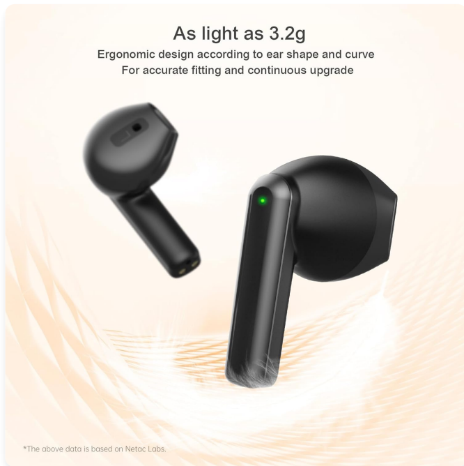
Image: Close-up of Netac LK35 earbuds, highlighting their lightweight and ergonomic design for comfortable fit.