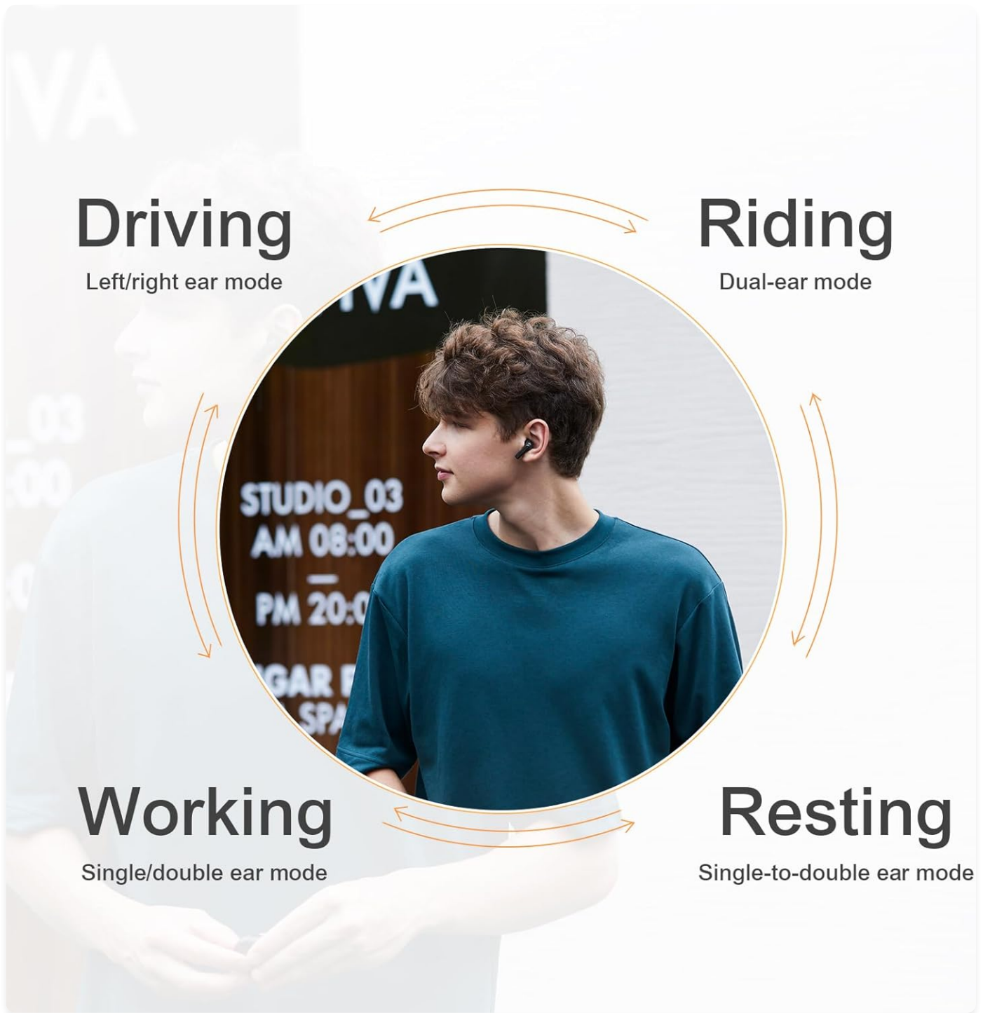
Image: Illustration of various usage scenarios for Netac LK35 headphones, including driving (left/right ear mode), riding (dual-ear mode), working (single/double ear mode), and resting (single-to-double ear mode).