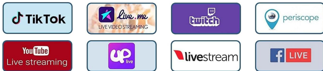
Figure 5: Wide compatibility with various devices and platforms.

Support various recording software & livestreaming platforms