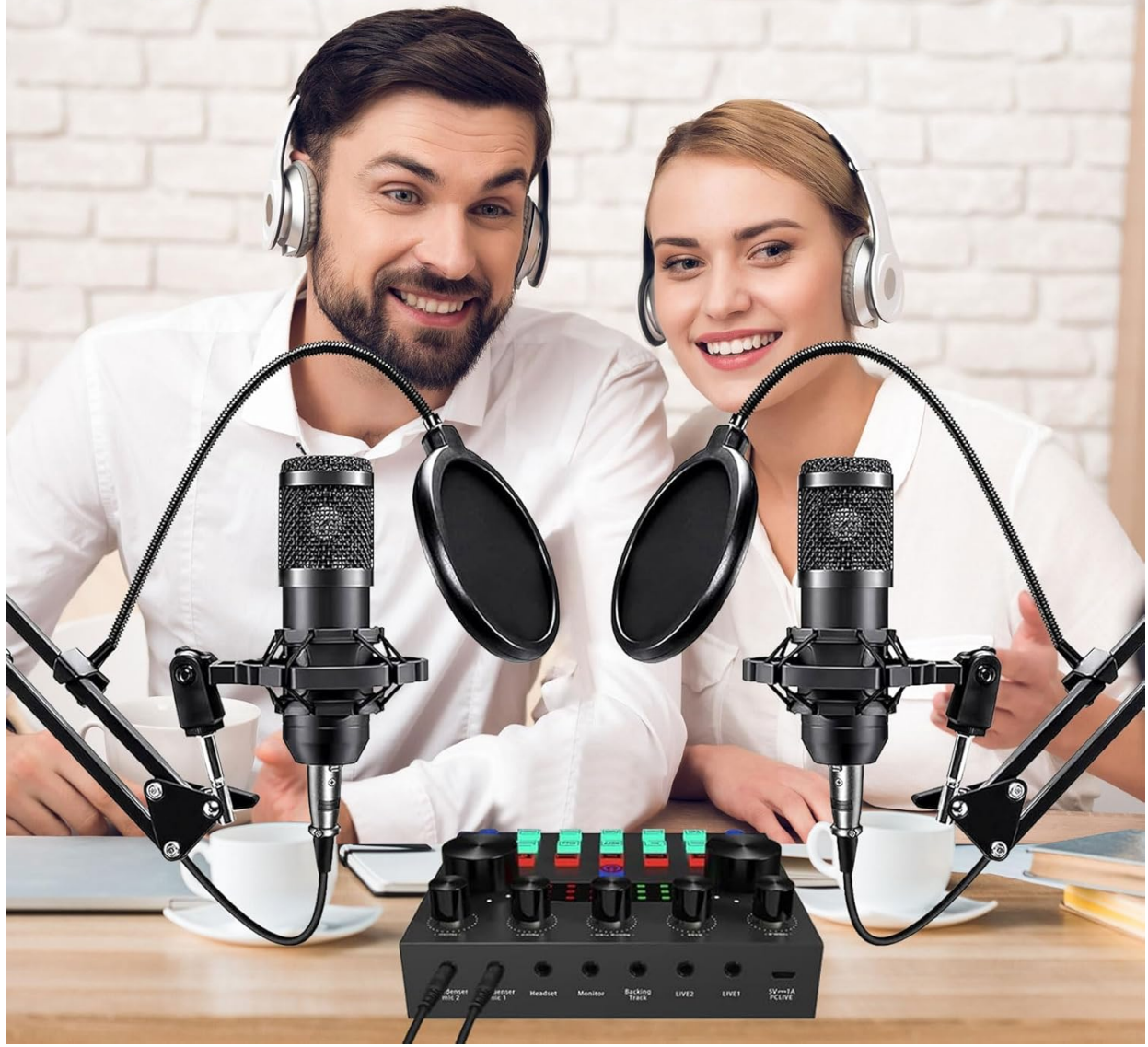
Figure 3: Example setup for a double live broadcast.