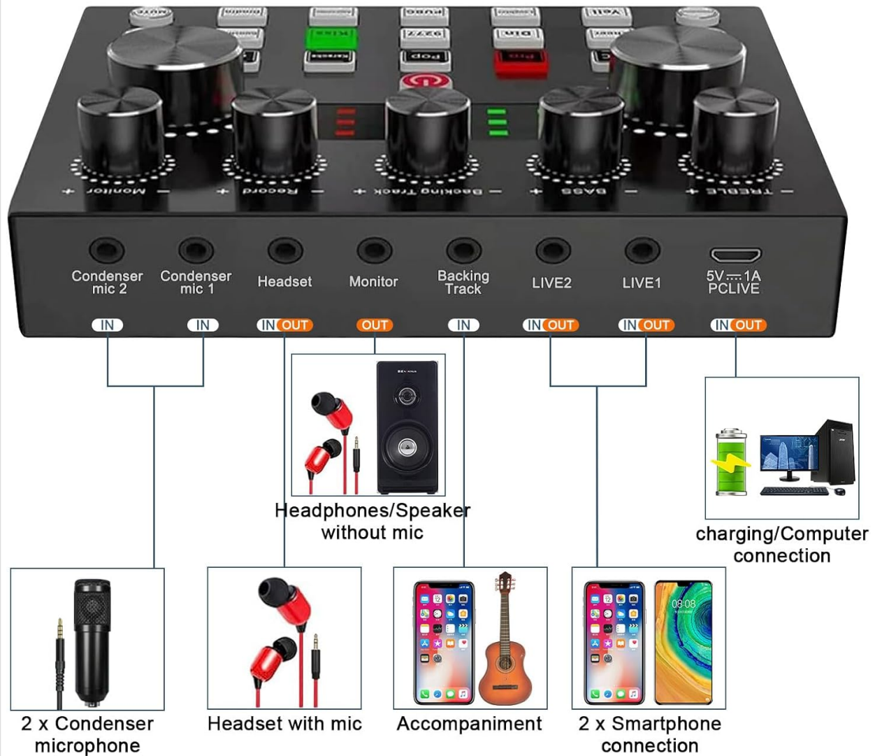
Figure 2: Connection diagram for the Live Sound Card.