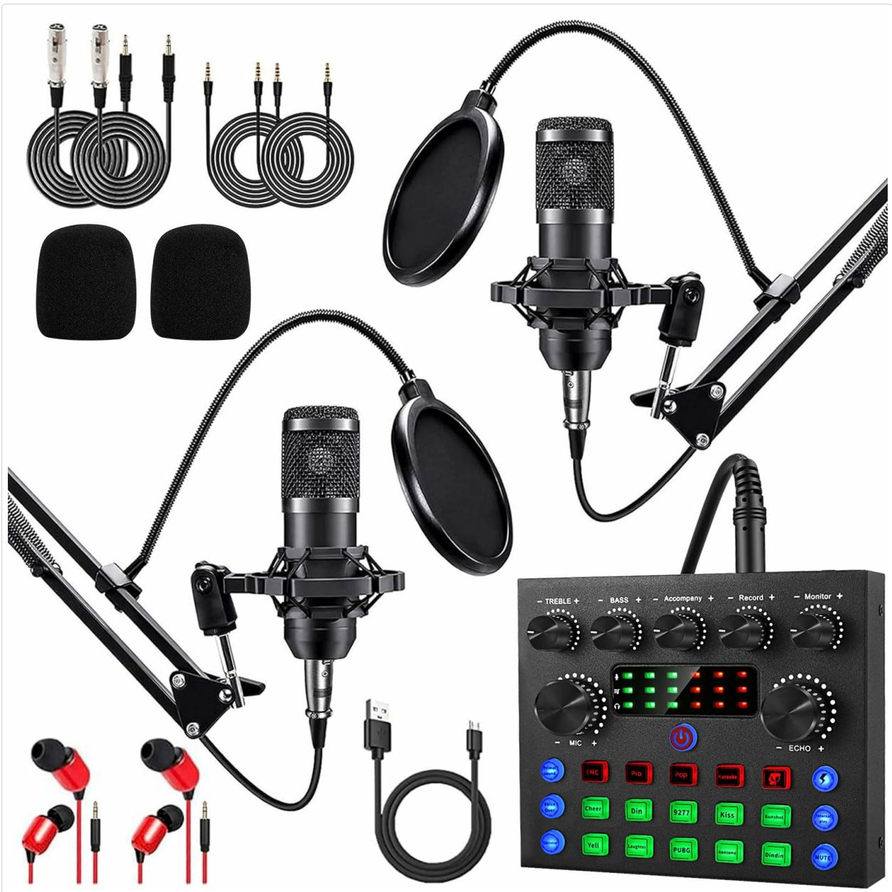
Figure 1: All components included in the ALPOWL Podcast Equipment Bundle.