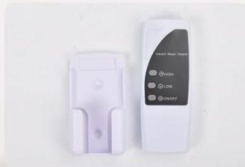
SMART REMOTE CONTROL