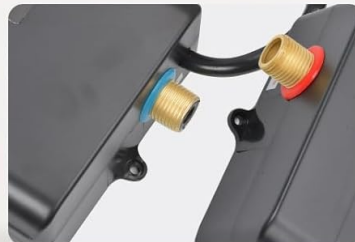
COLD/HOT WATER INLET