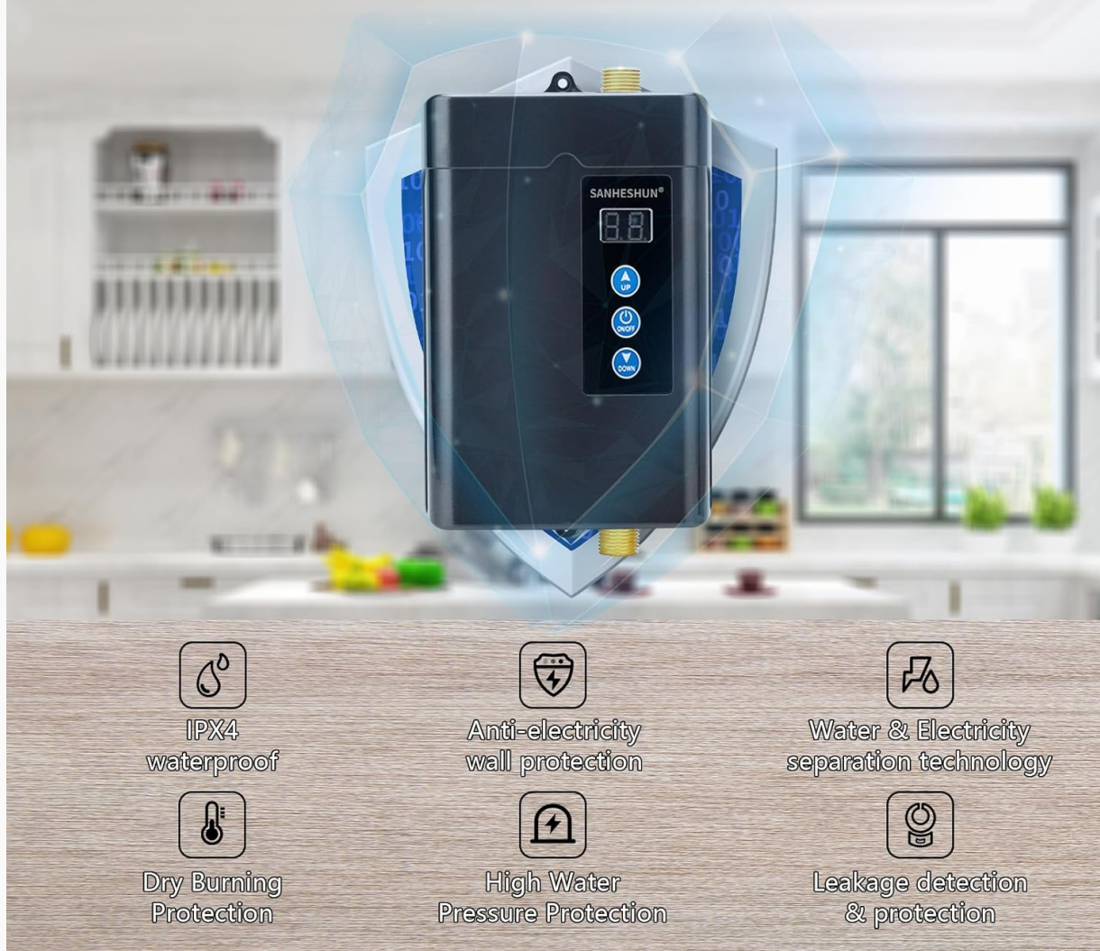
Figure 2.1: Overview of the 6 main protection functions: IPX4 waterproof, anti-electricity wall protection, water & electricity separation technology, dry burning protection, high water pressure protection, and leakage detection & protection.