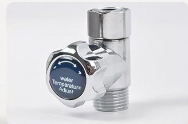
ADJUST WATER FLOW PRESSURE