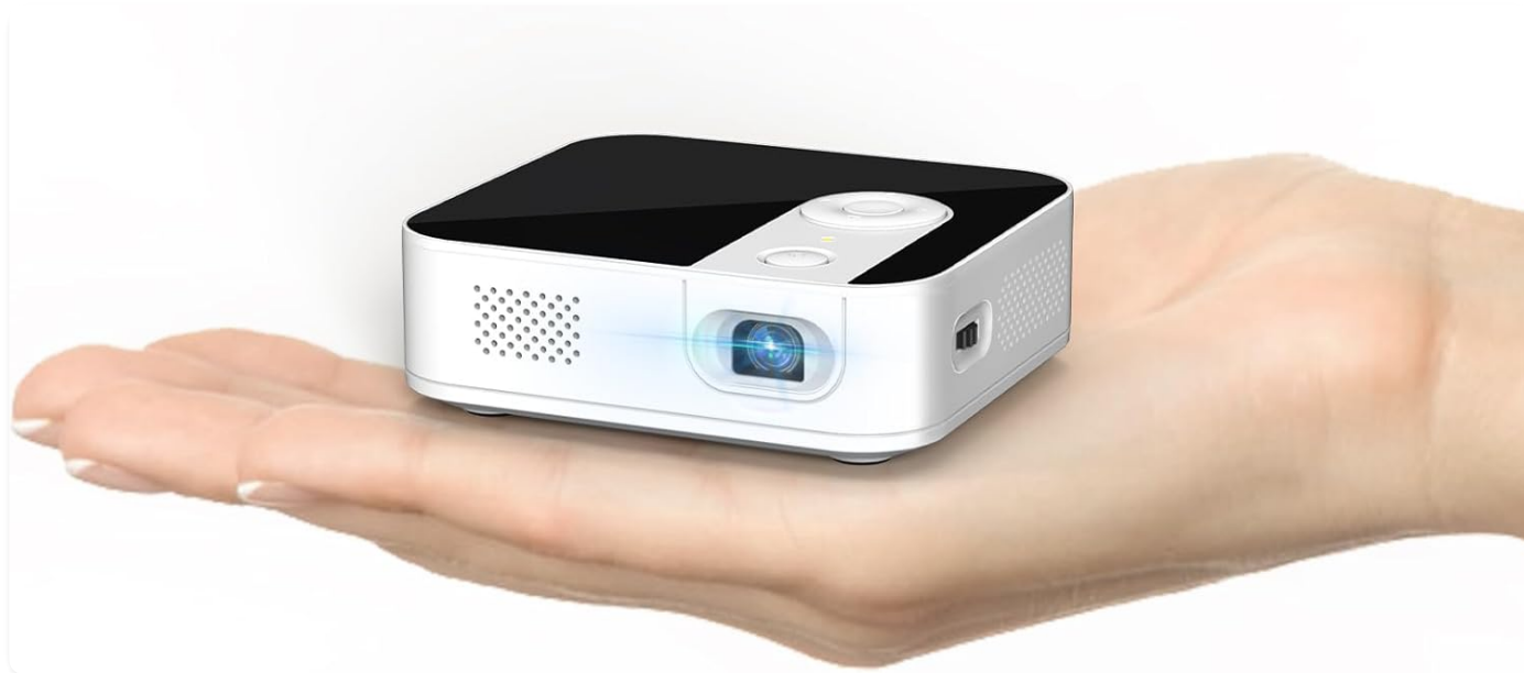
Figure 1.1: The TMY V98 Ultra Mini Projector, demonstrating its ultra-compact design and portability.

The TMY V98 Ultra Mini Projector is a compact and versatile device designed for portable entertainment and presentations. Featuring DLP projection technology, it delivers clear images and supports various connectivity options including WiFi and Bluetooth. Its built-in battery provides extended playback, making it ideal for both indoor and outdoor use.