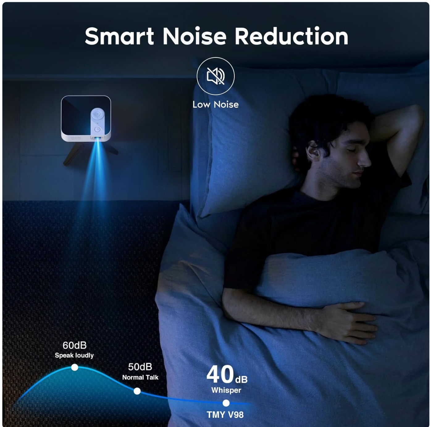
Figure 8.2: The projector's smart noise reduction technology ensures a quiet operation, ideal for undisturbed viewing.