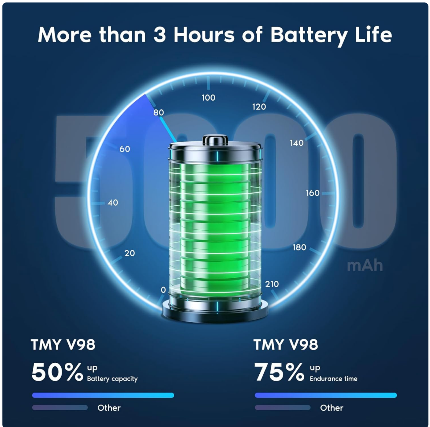
Figure 5.1: The TMY V98's extended playback capability with its 5000mAh battery.

The projector features a built-in 5000mAh rechargeable battery, providing approximately 3.5 hours of continuous playback. A low battery warning will appear when the charge drops below 5%.