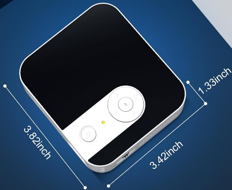
Figure 1.2: Physical dimensions of the TMY V98 projector, highlighting its small footprint.