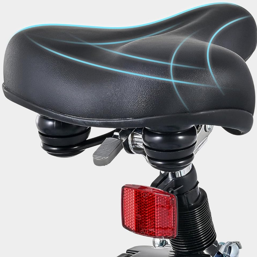
Figure 2: Adjustable Cushioned Saddle for enhanced comfort.