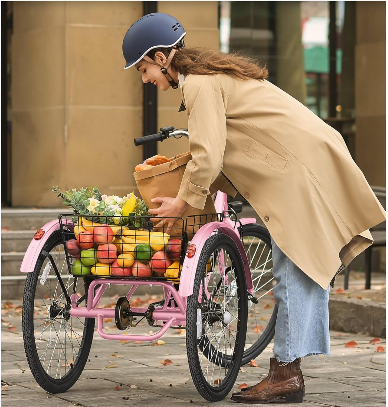
Figure 6: Large Rear Basket for storage.

Store Groceries or Carry Your Pets with Ease