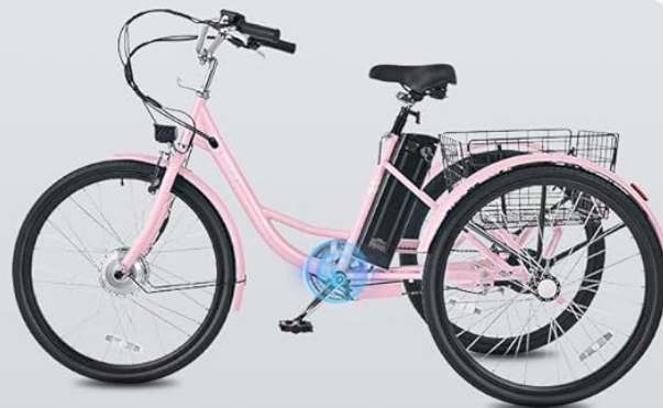
Figure 4: Three Ways to Ride your Viribus Electric Tricycle.