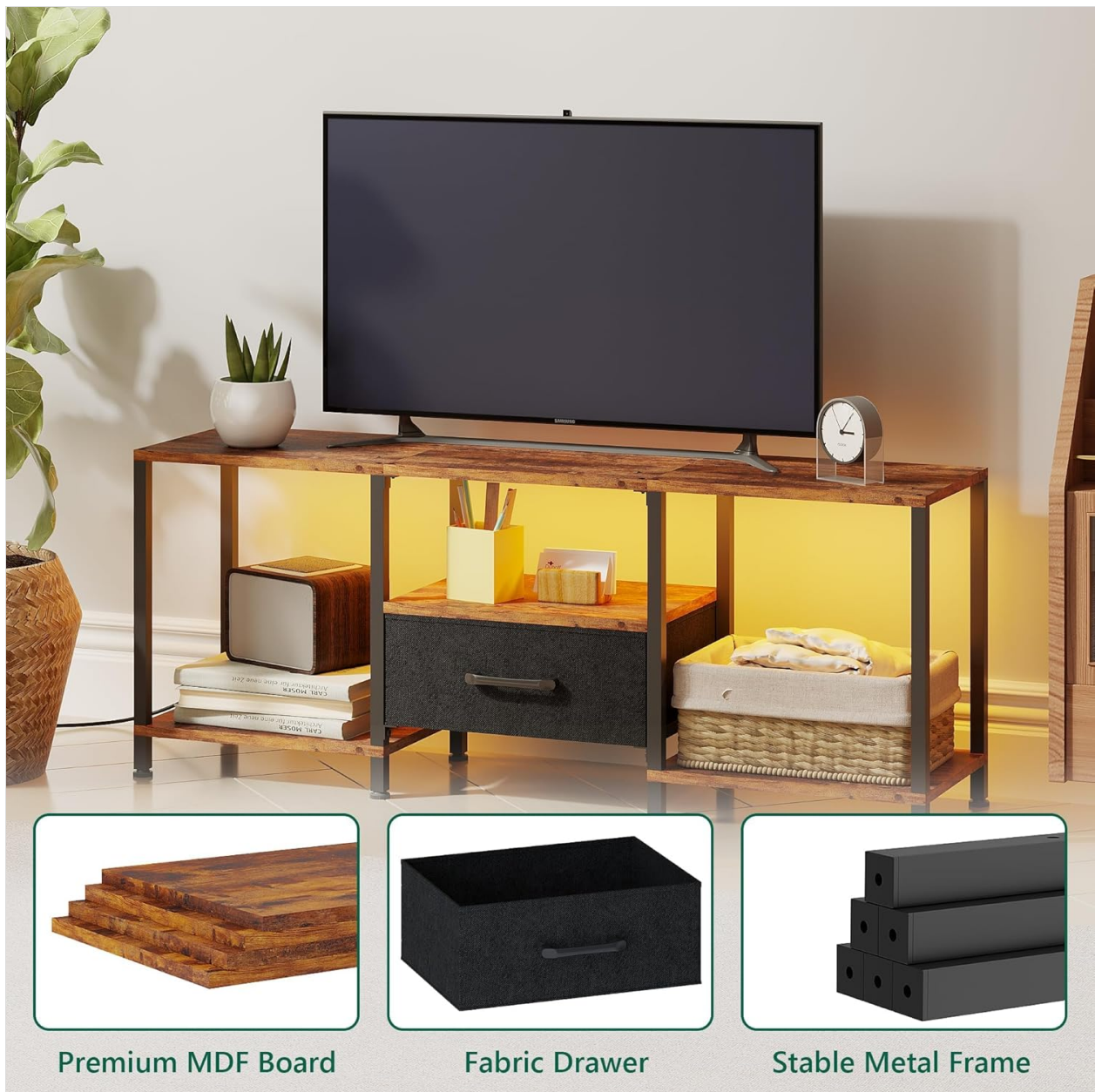
Image 3: TV Size Compatibility. This visual demonstrates that the TV stand is designed to accommodate televisions up to 55 inches.