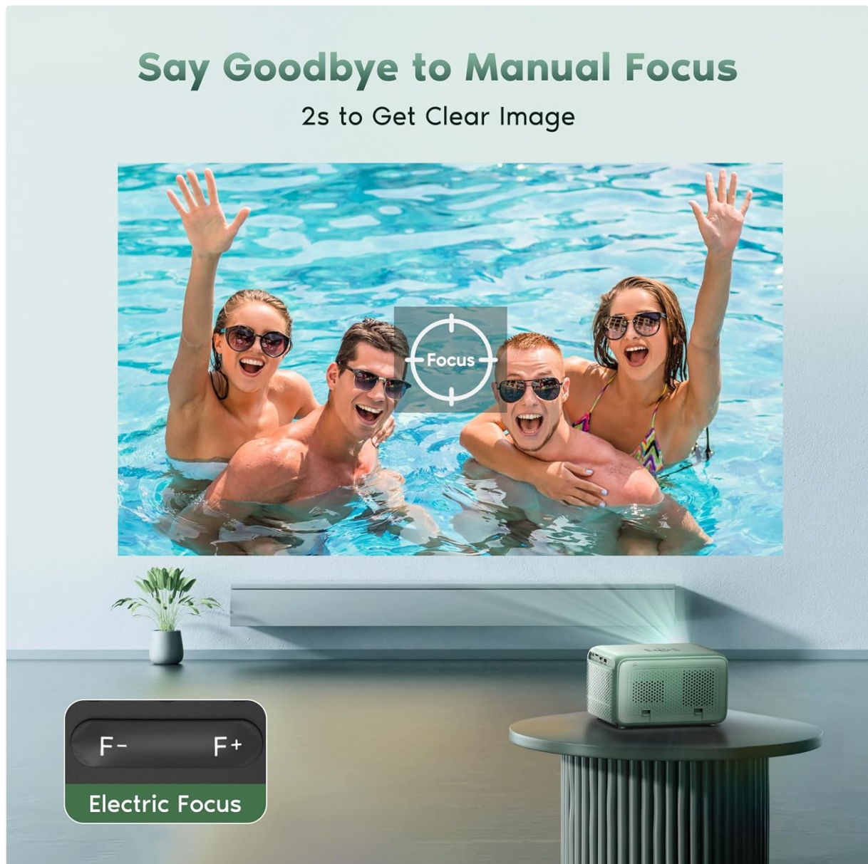
Figure 3: Adjusting Focus with Electric Focus Function

The TMY projector features quick electronic focus. Use the remote control to effortlessly fine-tune the image focus. Press the 'F+' or 'F-' buttons on the remote to achieve a clear and sharp image within 2 seconds.