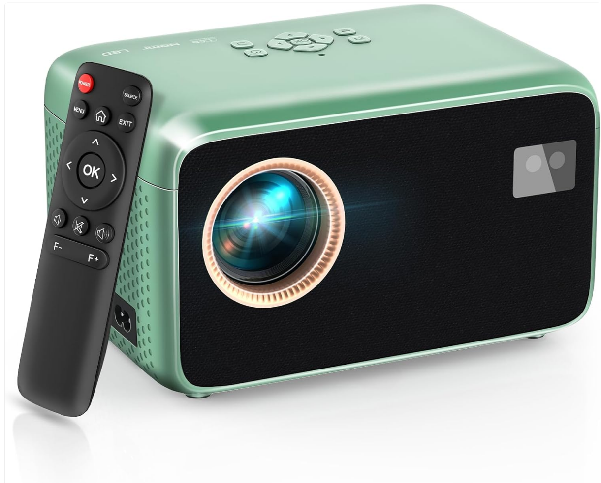
Figure 1: TMY Electric Focus 4K Projector and Remote Control

The TMY Electric Focus 4K Projector is designed to deliver a stunning visual experience with its advanced features. It supports 4K video input with a native 1080P display resolution and 180 ANSI brightness, ensuring vibrant and clear images. Its unique design, resembling a retro Bluetooth speaker, makes it a stylish addition to any room. Key features include quick electronic focus, 5G WiFi 6 for stable screen mirroring, and dual Bluetooth connectivity, allowing it to function as both a projector and a standalone Bluetooth speaker. The projector also includes a convenient timer shutdown feature for automated operation.