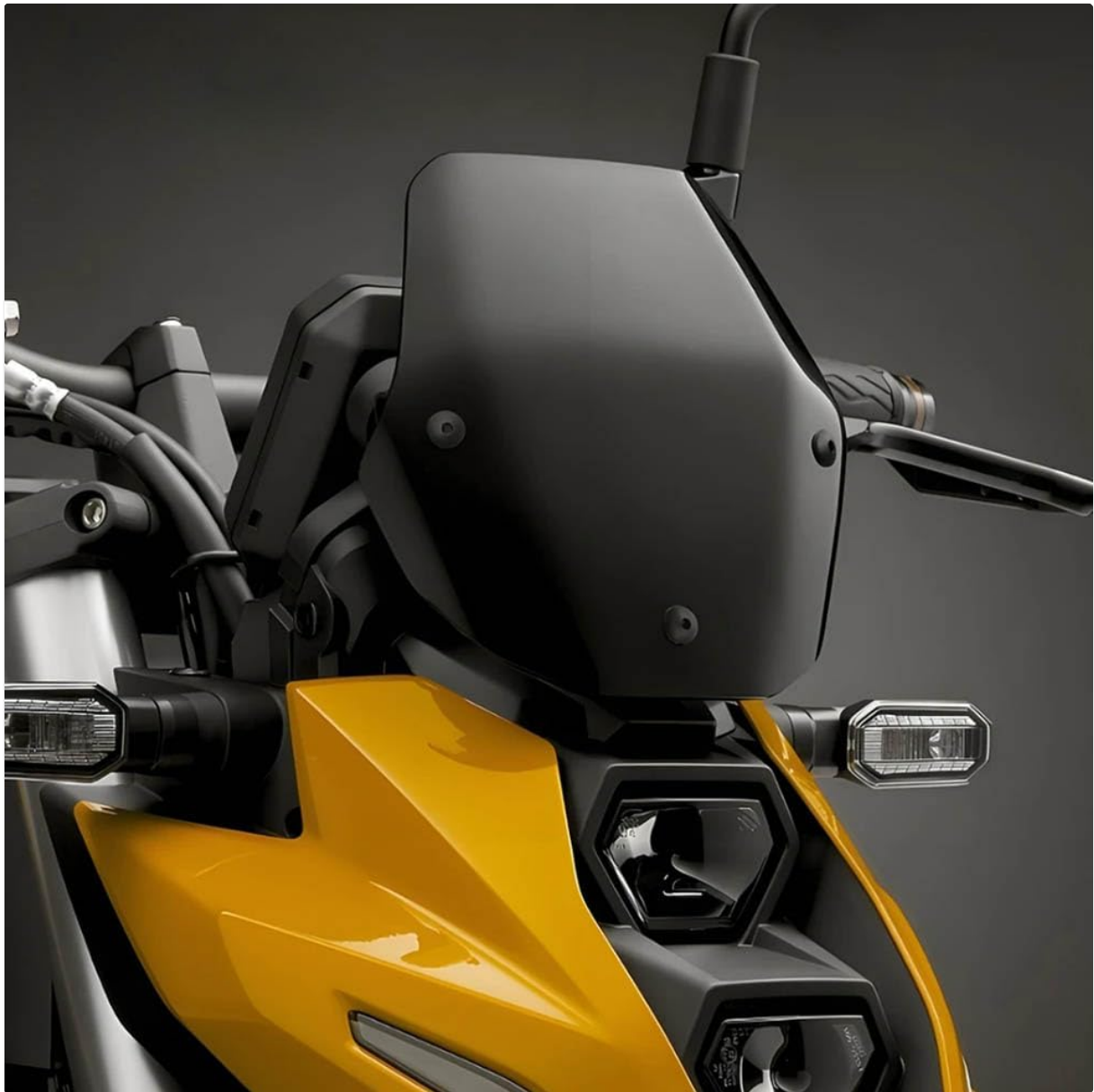
Figure 1.1: ZYTIGHTER Motorcycle Windshield on a Suzuki GSX-8S.