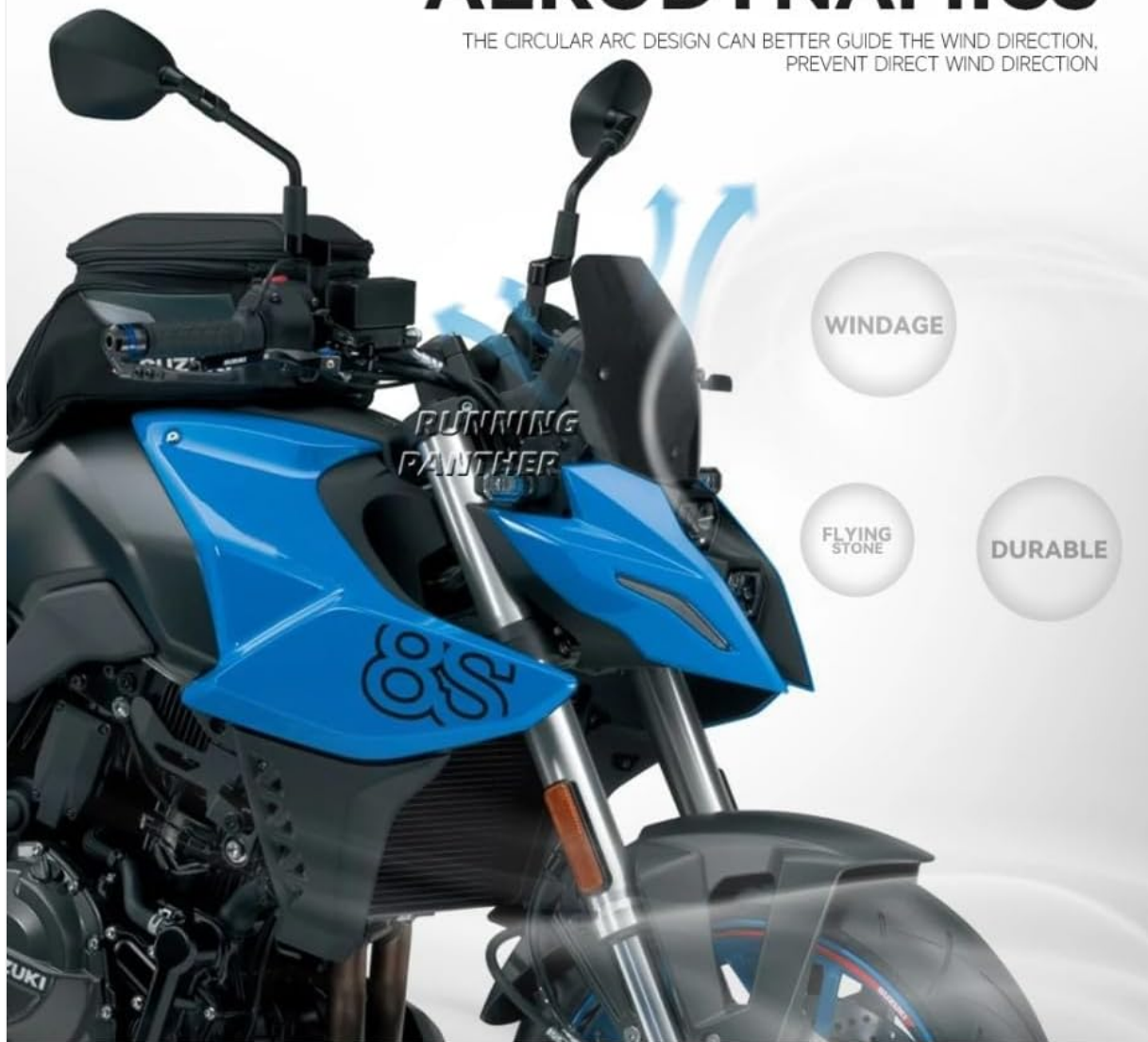
Figure 5.1: Illustration of aerodynamic benefits, showing wind deflection.

THE CIRCULAR ARC DESIGN CAN BETTER GUIDE THE WIND DIRECTION, PREVENT DIRECT WIND DIRECTION