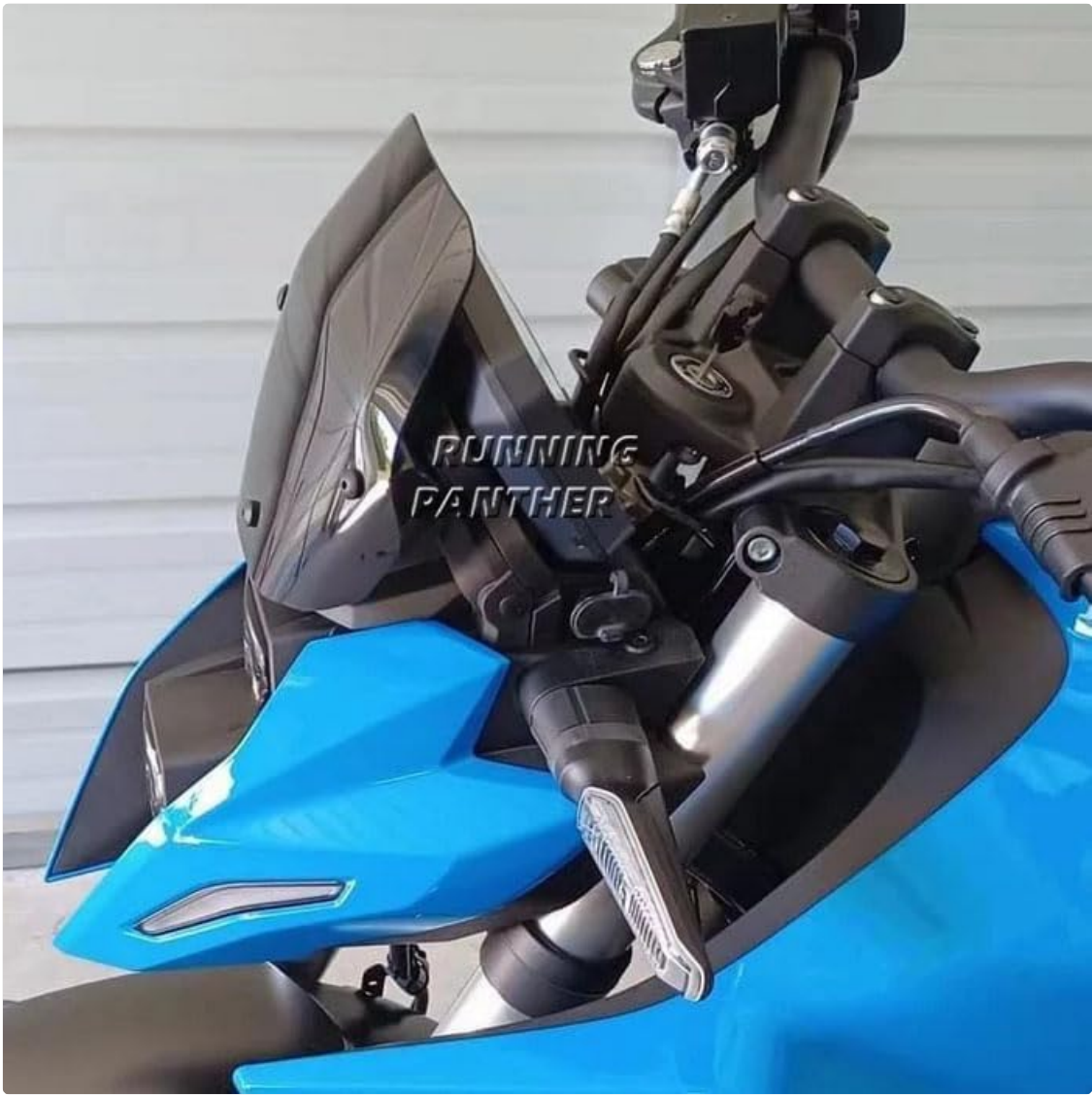
Figure 4.2: Detailed view of the installed windshield and its integration with the motorcycle's front.