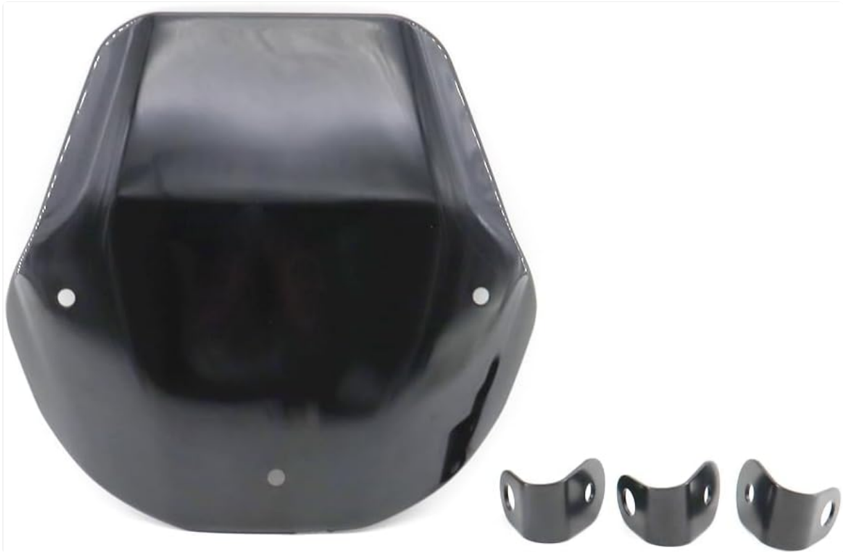
Figure 3.1: Included components: Windshield and mounting hardware.

If any parts are missing or damaged, contact your retailer or ZYTIGHTER customer support immediately.