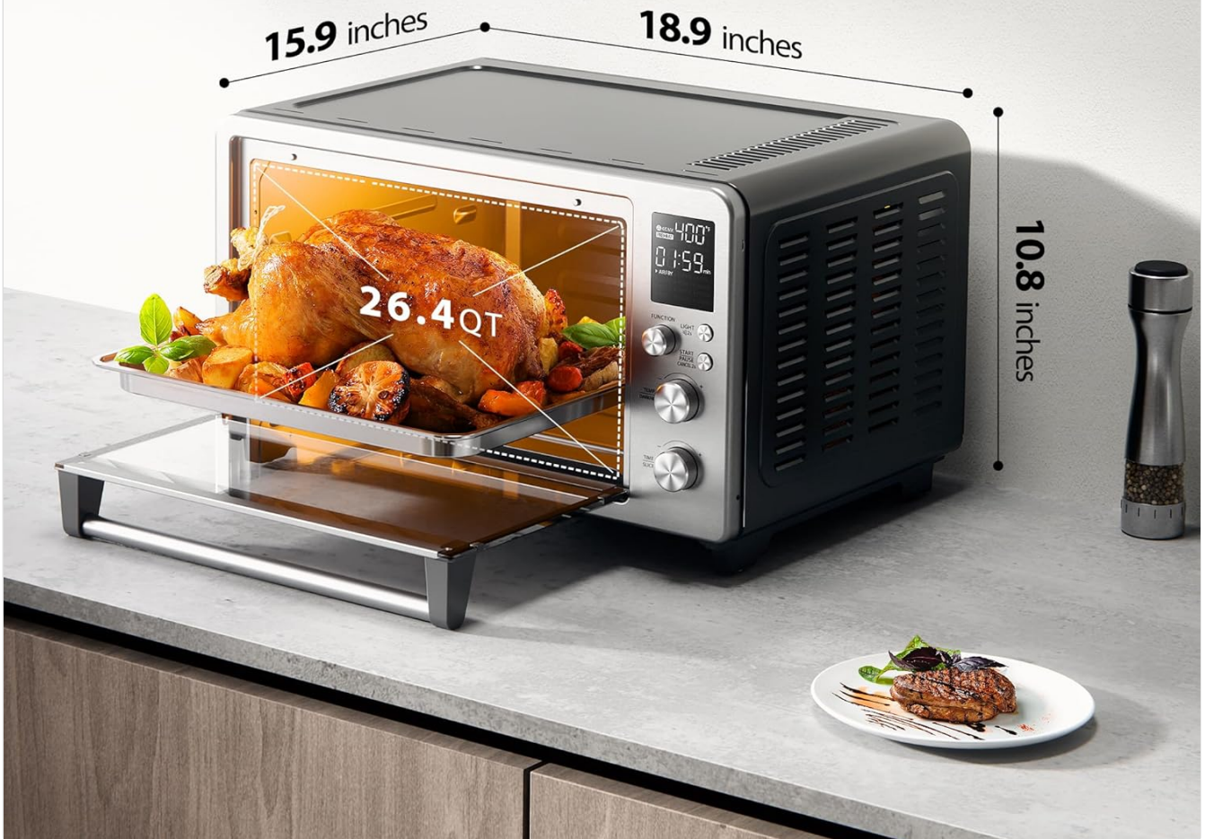
Figure 6: Dimensions and capacity of the oven, highlighting its family-sized capability.