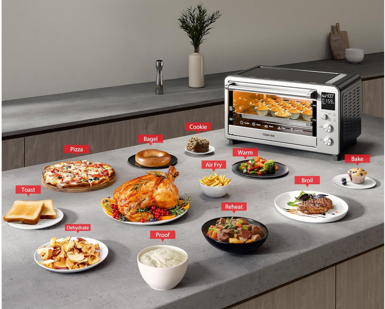
Figure 4: Visual representation of the 12 preset cooking functions.

Meet your daily cooking needs with 12 presets