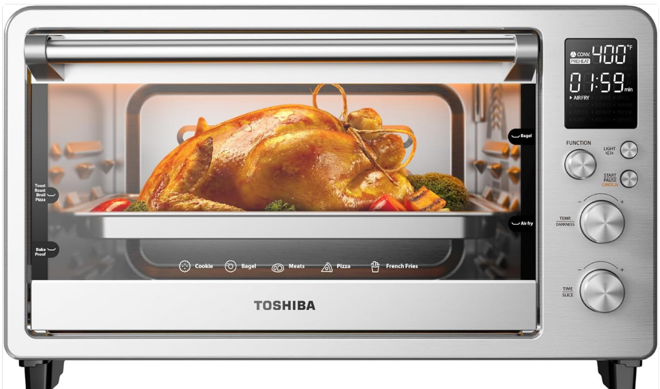
Figure 1: Front view of the TOSHIBA ChefFry Air Fryer Toaster Oven Combo, showcasing its sleek stainless steel design and digital display.

Familiarize yourself with the parts of your TOSHIBA ChefFry Air Fryer Toaster Oven.