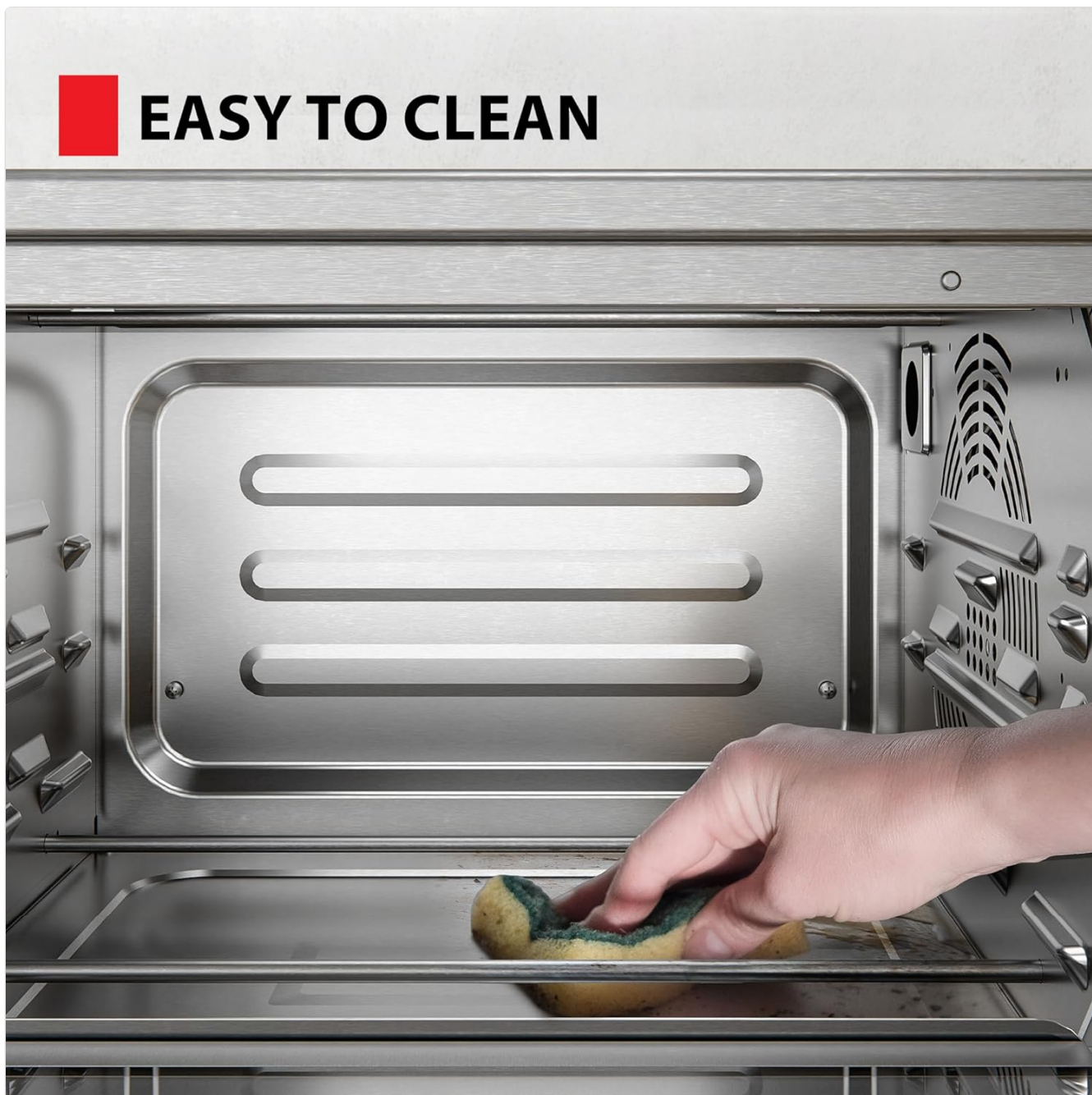
Figure 7: Demonstrating the ease of cleaning the oven's interior.

4. Clean the Exterior: For standard cleaning, wipe the exterior with a soft, damp cloth. Avoid abrasive cleaners.