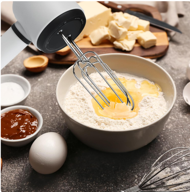
Image 5.2: Hand mixer in use, demonstrating mixing of ingredients.