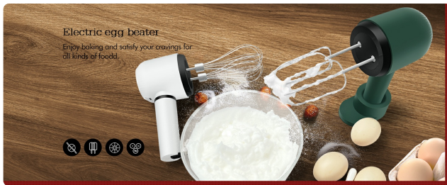
Image 5.3: Hand mixer mixing batter in a bowl, showcasing its cordless operation.