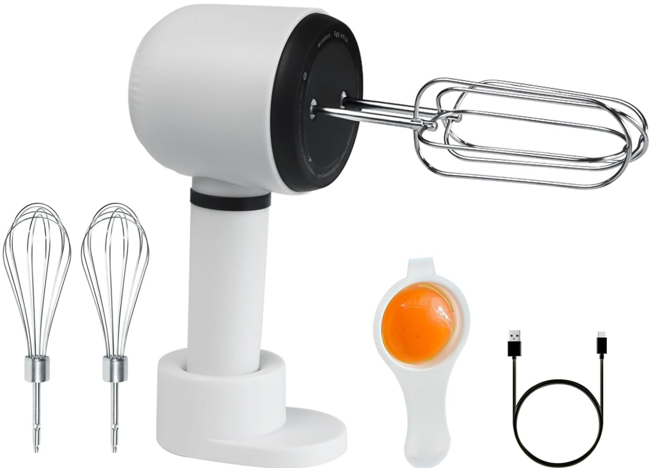
Image 1.1: SUNHAIXIA HM903 3-Speed Hand Mixer with included beaters, whisk, egg separator, and charging cable.

Thank you for purchasing the SUNHAIXIA HM903 3-Speed Hand Mixer. This manual provides essential information for the safe and efficient operation, maintenance, and troubleshooting of your new appliance. Please read these instructions thoroughly before first use and retain them for future reference.