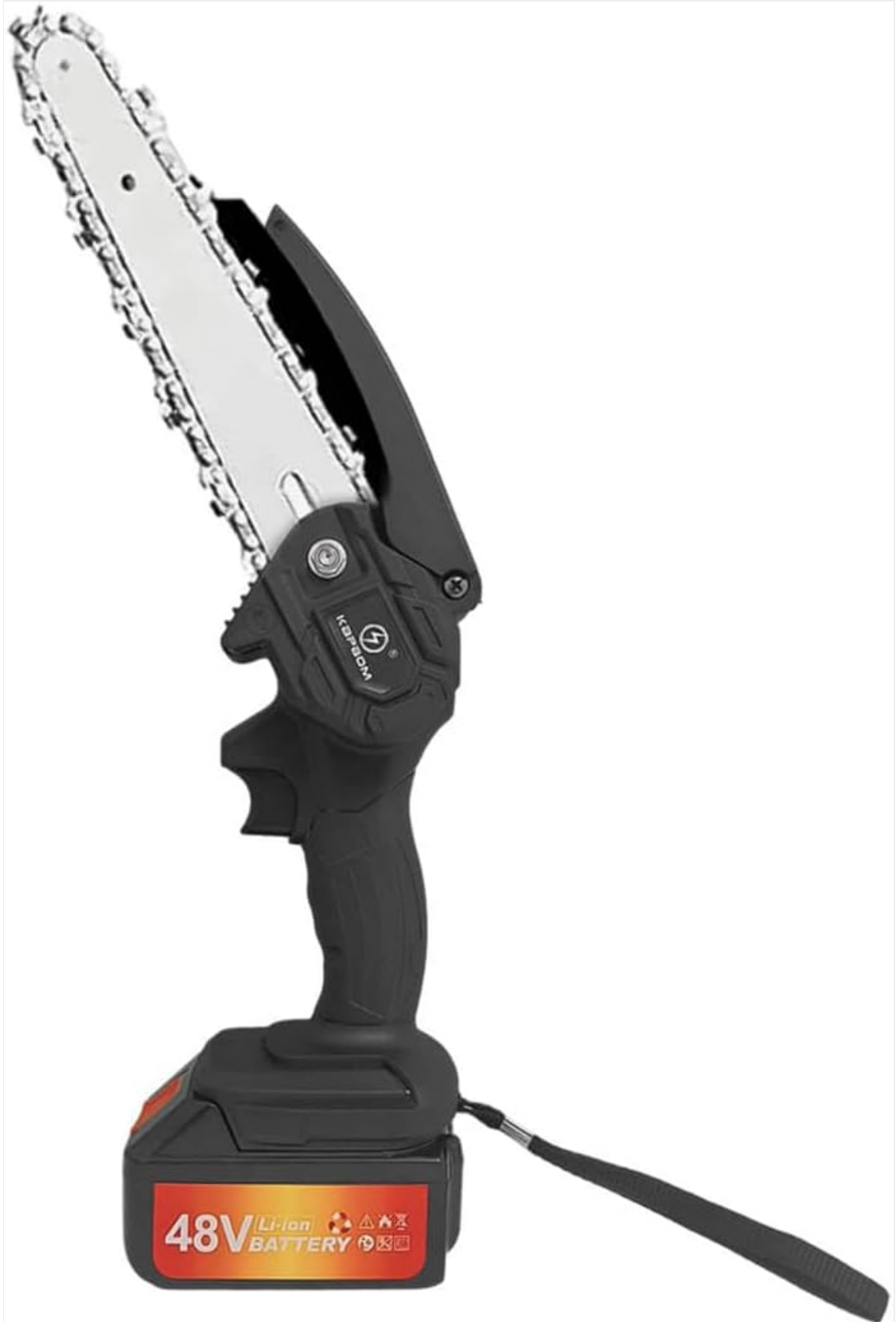
Image: The Kapbom Mini Electric Portable Chainsaw fully assembled, showing the guide bar and chain in place.