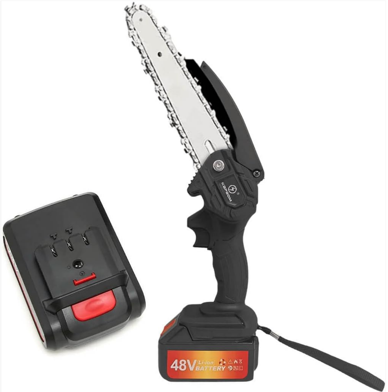
Image: A close-up view of the chainsaw chain wrapped around the guide bar, highlighting the chain teeth and guide bar tip.