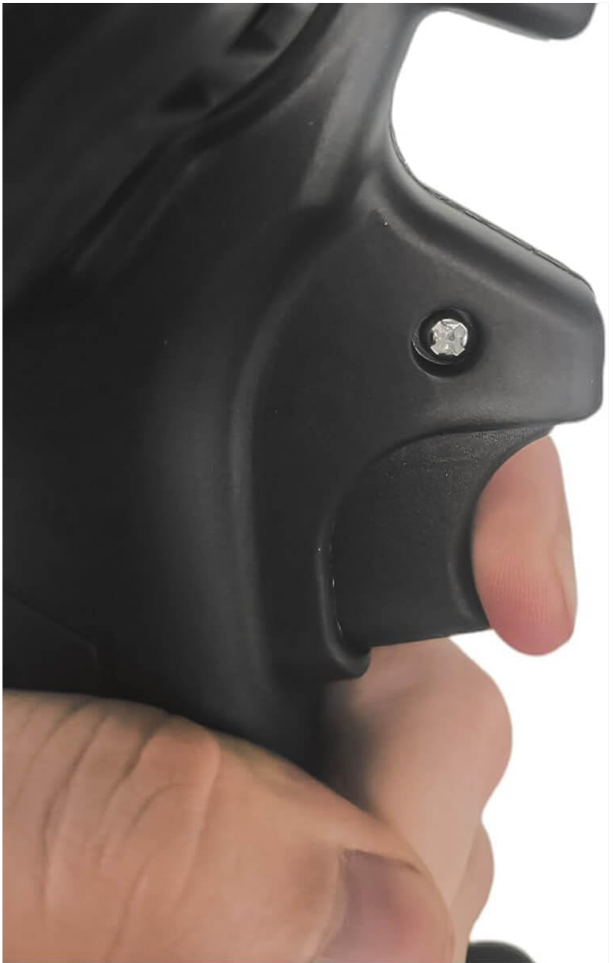
Image: A hand demonstrating how to press the safety switch located on the handle of the Kapbom Mini Electric Portable Chainsaw before operating.