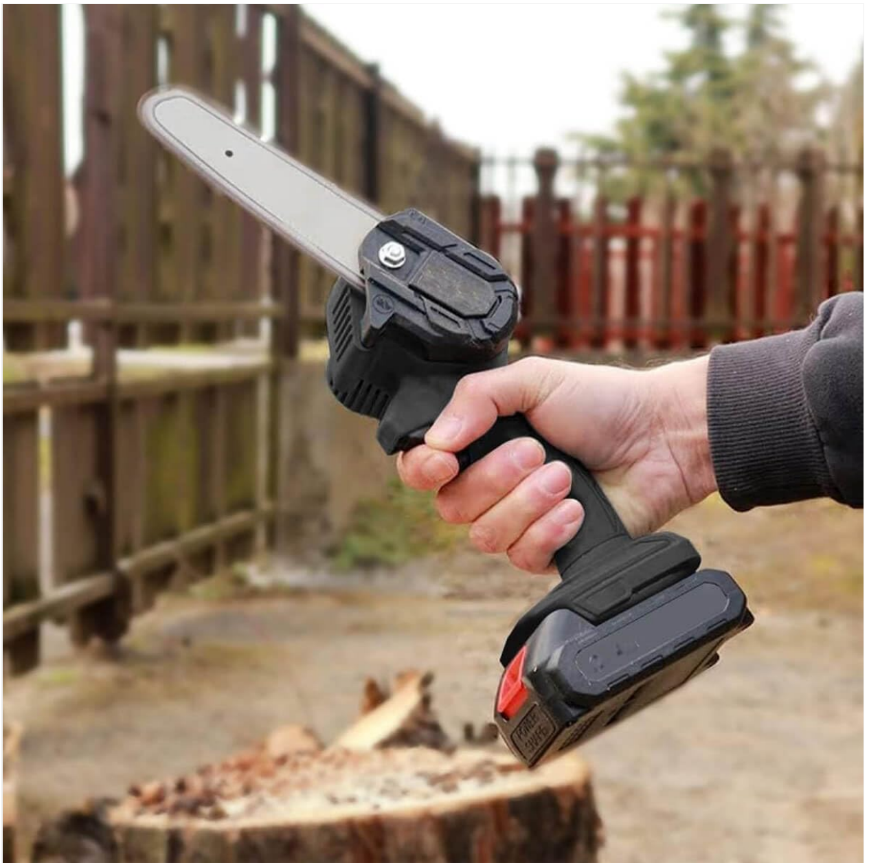
Image: A person using the Kapbom Mini Electric Portable Chainsaw to cut a tree stump outdoors, showing the compact size and portability of the tool.