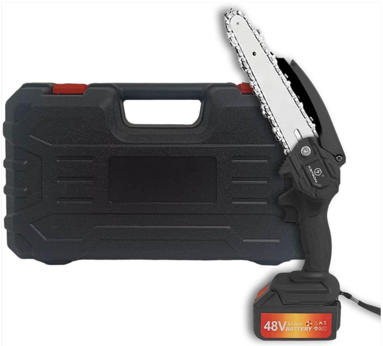
Image: The Kapbom Mini Electric Portable Chainsaw with the 48V Lithium-Ion battery securely inserted into its base, ready for operation.