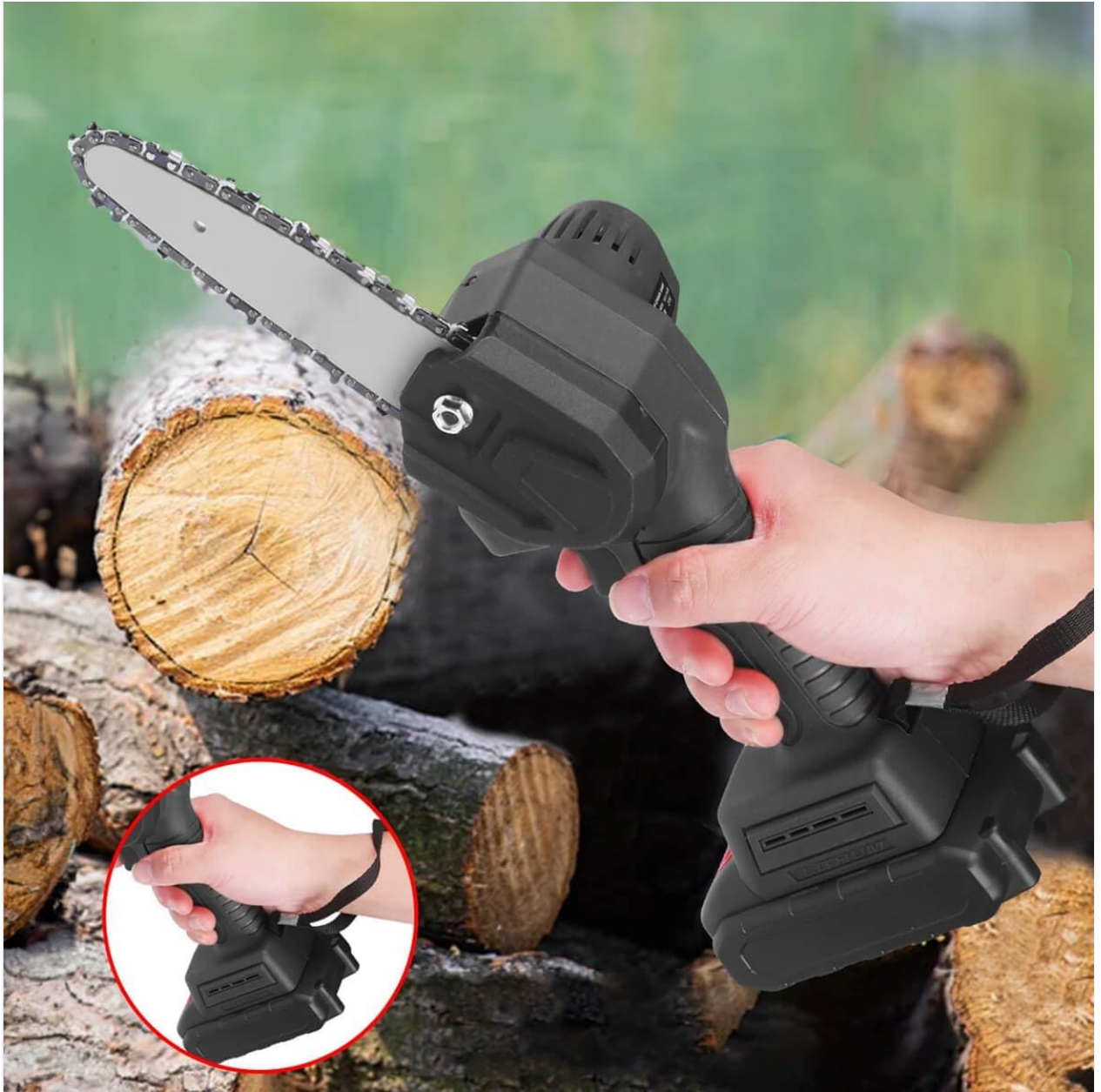
Image: A person holding the Kapbom Mini Electric Portable Chainsaw, demonstrating its use for cutting small logs or branches in a garden setting.