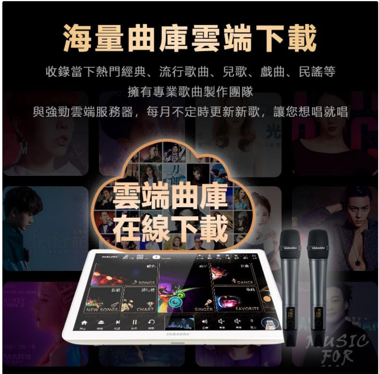
Figure 6.5: The new overseas version system interface, designed for international users with support for various regions including Hong Kong, Taiwan, and other international interfaces.