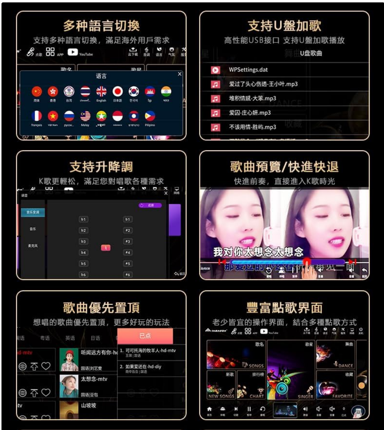
Figure 6.3: Advanced settings interface, demonstrating multi-language switching, USB song support, pitch adjustment, song preview/fast-forward, song priority ordering, and a rich song ordering interface.