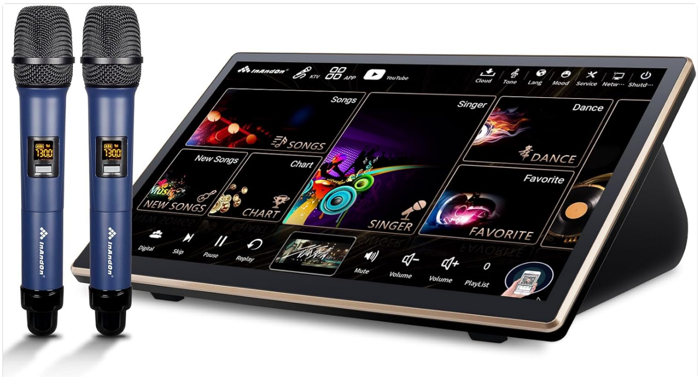
Figure 4.1: Front view of the InAndOn Karaoke System, showing the 18.5-inch capacitive touch screen and the two included wireless microphones.