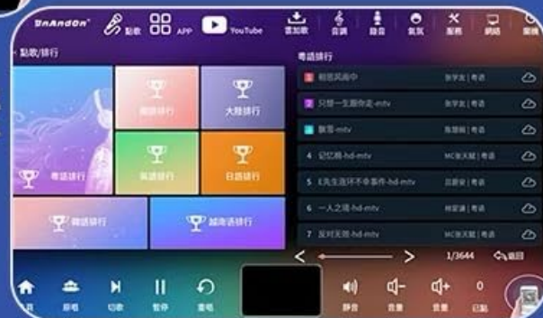
Figure 6.2: New features interface, showcasing integrated YouTube song ordering, accurate regional song rankings, various song play modes, and quick access to popular language categories.