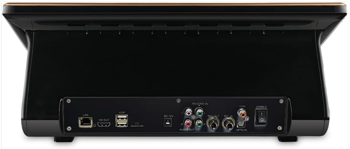
Figure 4.2: Rear panel of the InAndOn Karaoke System, illustrating the various input and output ports including LAN, HD-OUT (HDMI), USB, DC 12V power, RECORD IN, MIC OUT, AUDIO OUT (RCA), and OPTICAL.