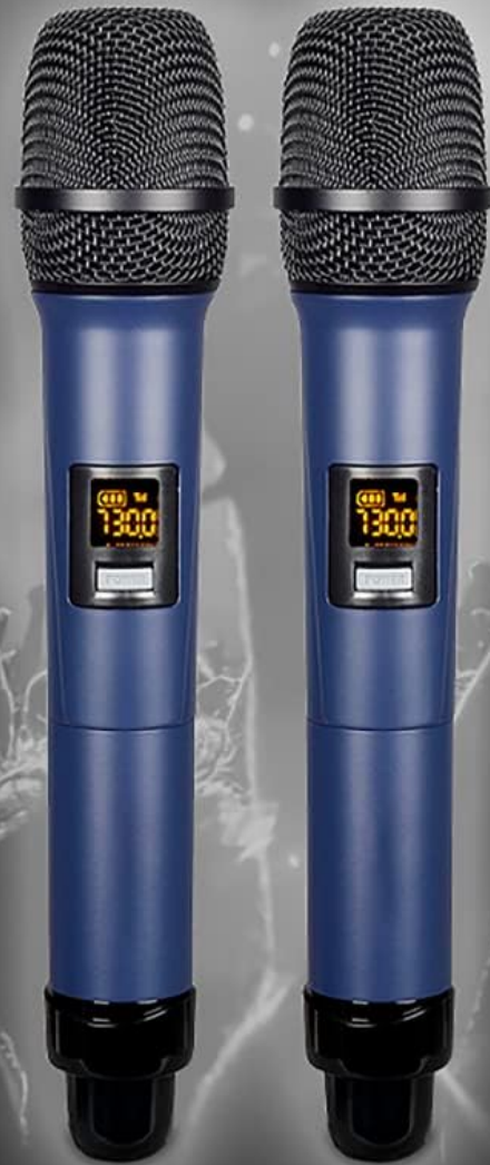
Figure 4.3: Detailed view of the wireless microphones, highlighting features such as high fidelity sound, imported core for accurate pickup, UHF high-frequency technology, professional anti-howling design, and durable metal mesh.