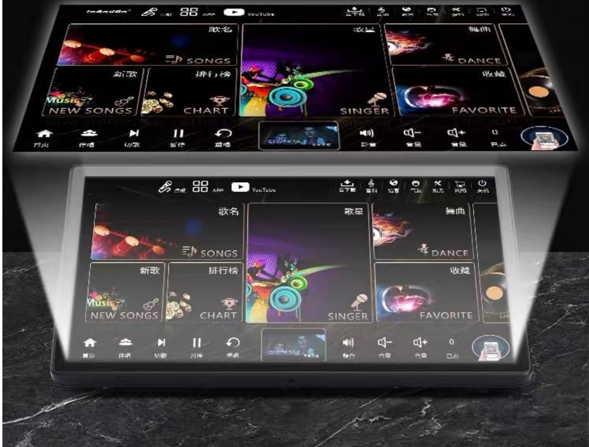
Figure 6.4: Interface for downloading songs from the massive cloud song library, which includes popular classics, trending songs, children's songs, opera, folk songs, and more, with regular updates.