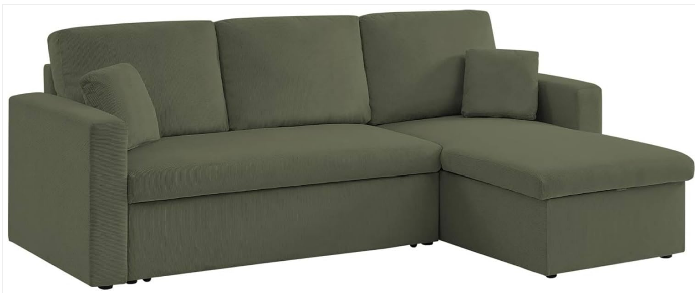
Image 1: Overview of the sweeek Ida Reversible Corner Sofa Bed. This image displays the sofa bed in its standard configuration, featuring a corner chaise lounge and three seating cushions, all upholstered in kaki corduroy fabric.

Before beginning assembly, verify that all components are present and undamaged. Refer to the parts list provided in the packaging for a complete inventory.